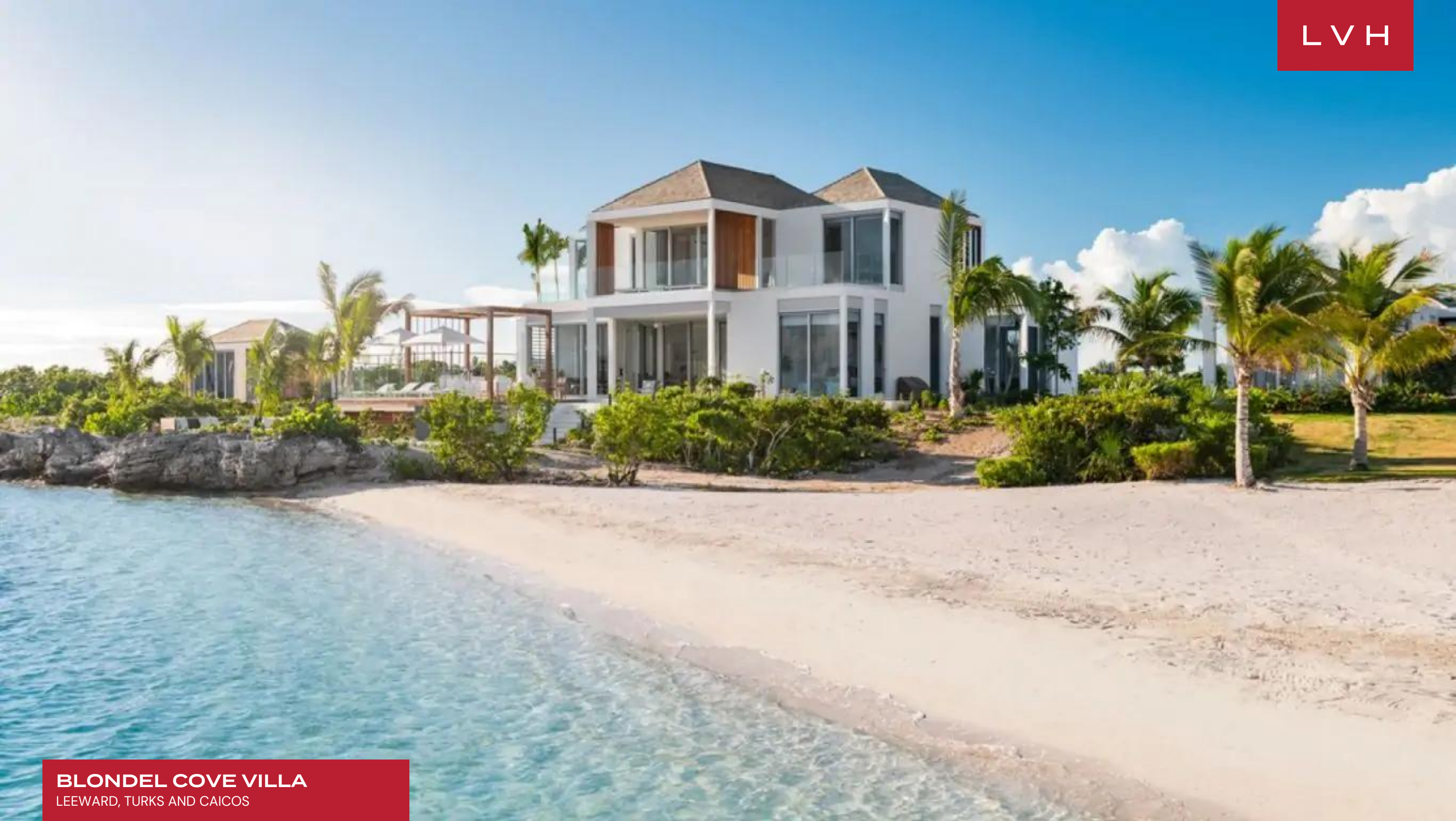
BLONDEL COVE VILLA LEEWARD, TURKS AND CAICOS