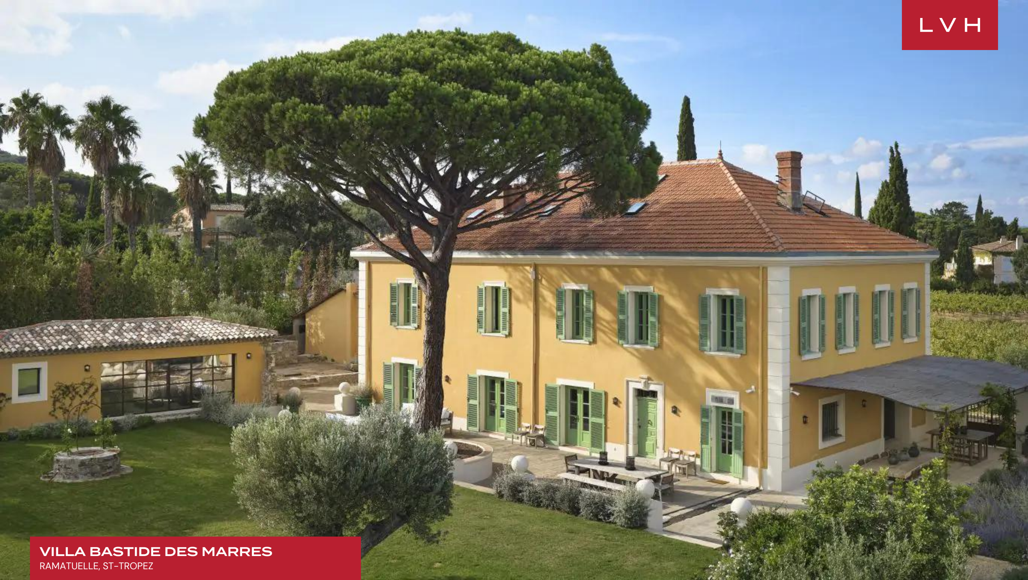
VILLA BASTIDE DES MARRES RAMATUELLE, ST-TROPEZ