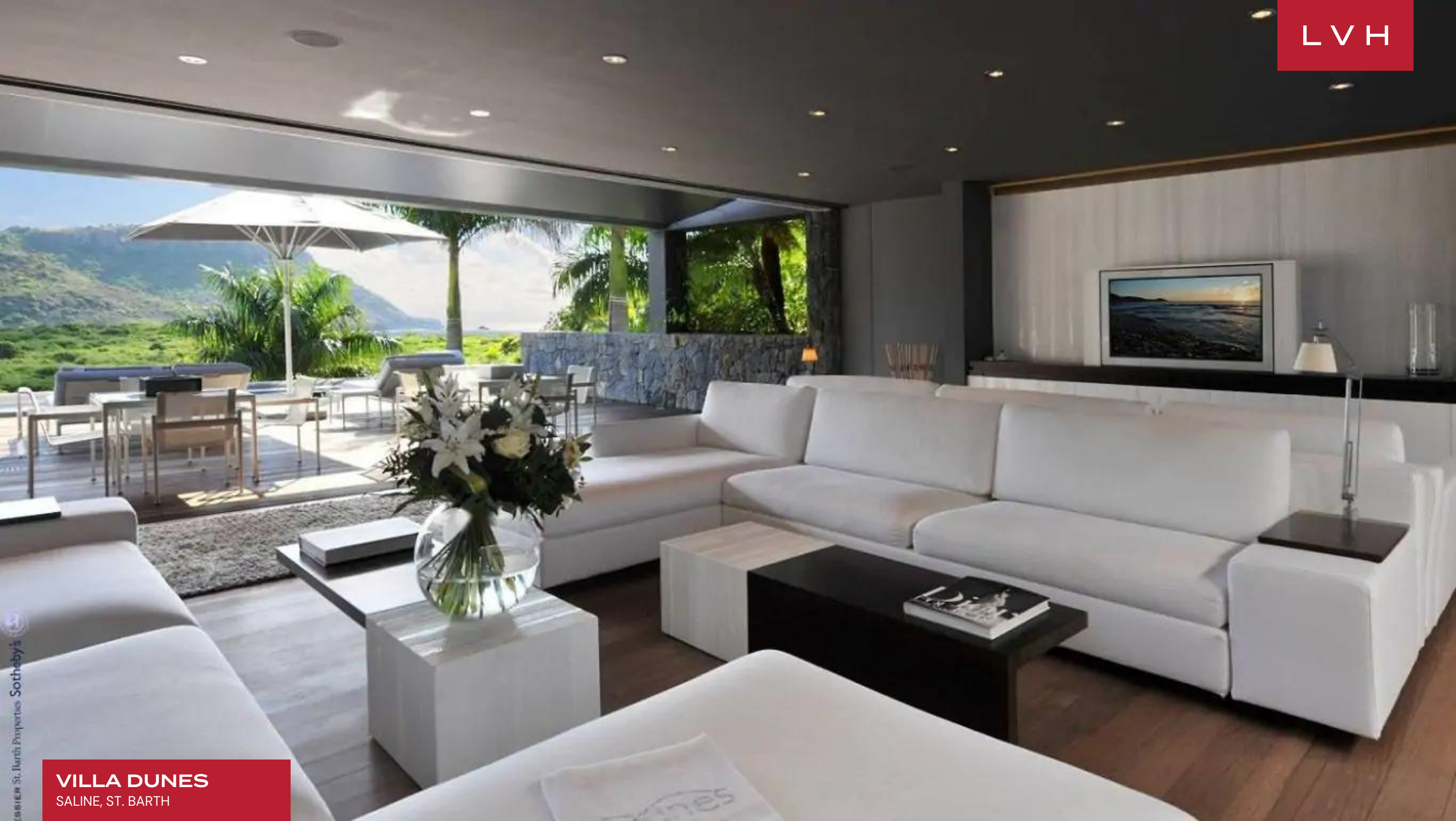
VILLA DUNES SALINE, ST. BARTH