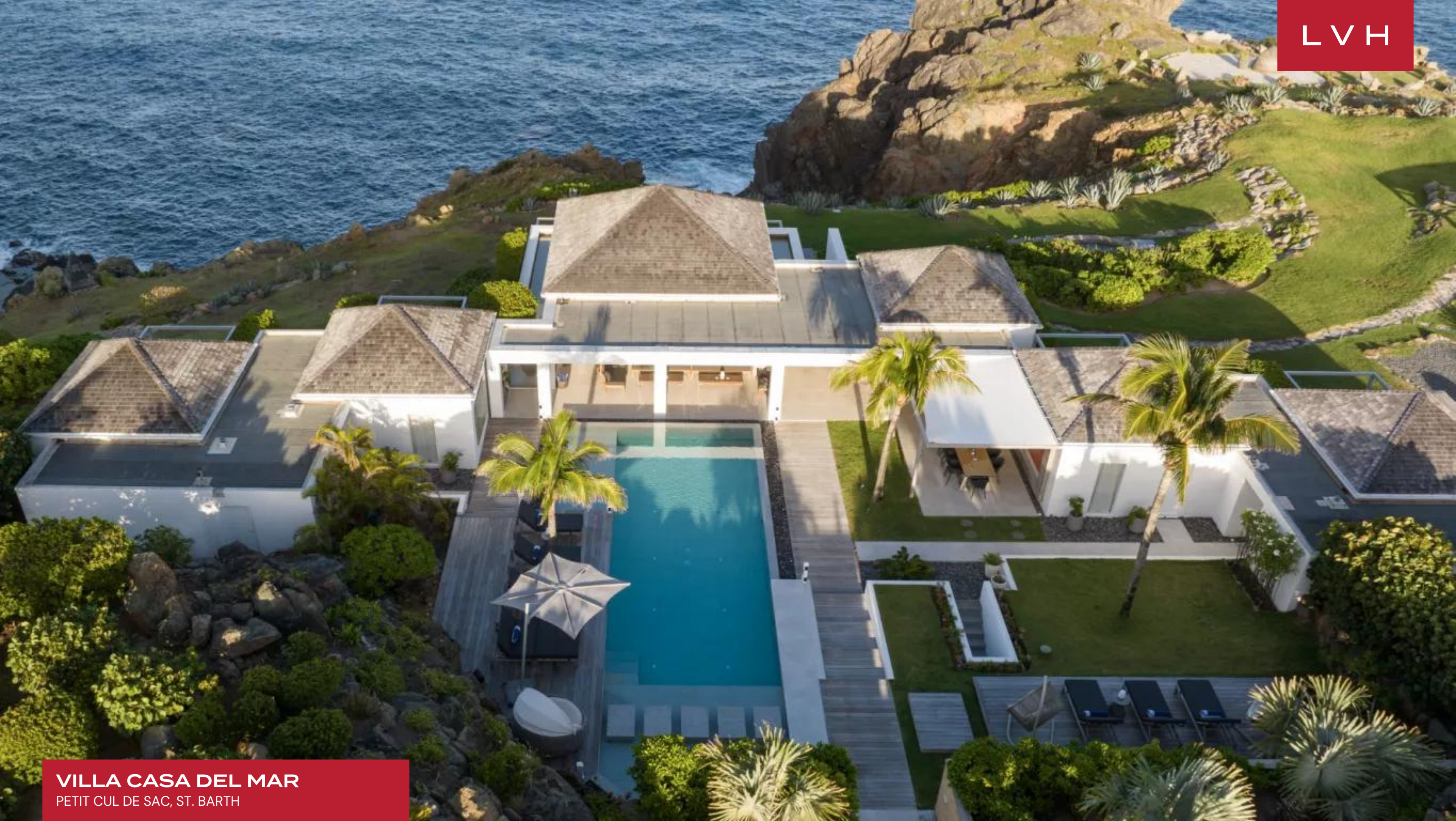
VILLA CASA DEL MAR PETIT CUL DE SAC, ST. BARTH