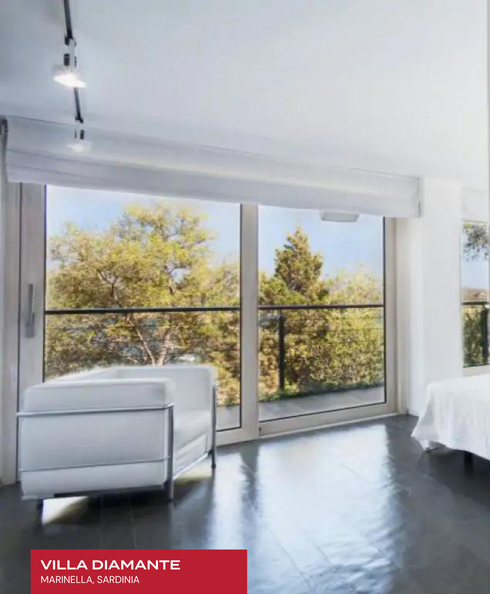
VILLA DIAMANTE MARINELLA, SARDINIA