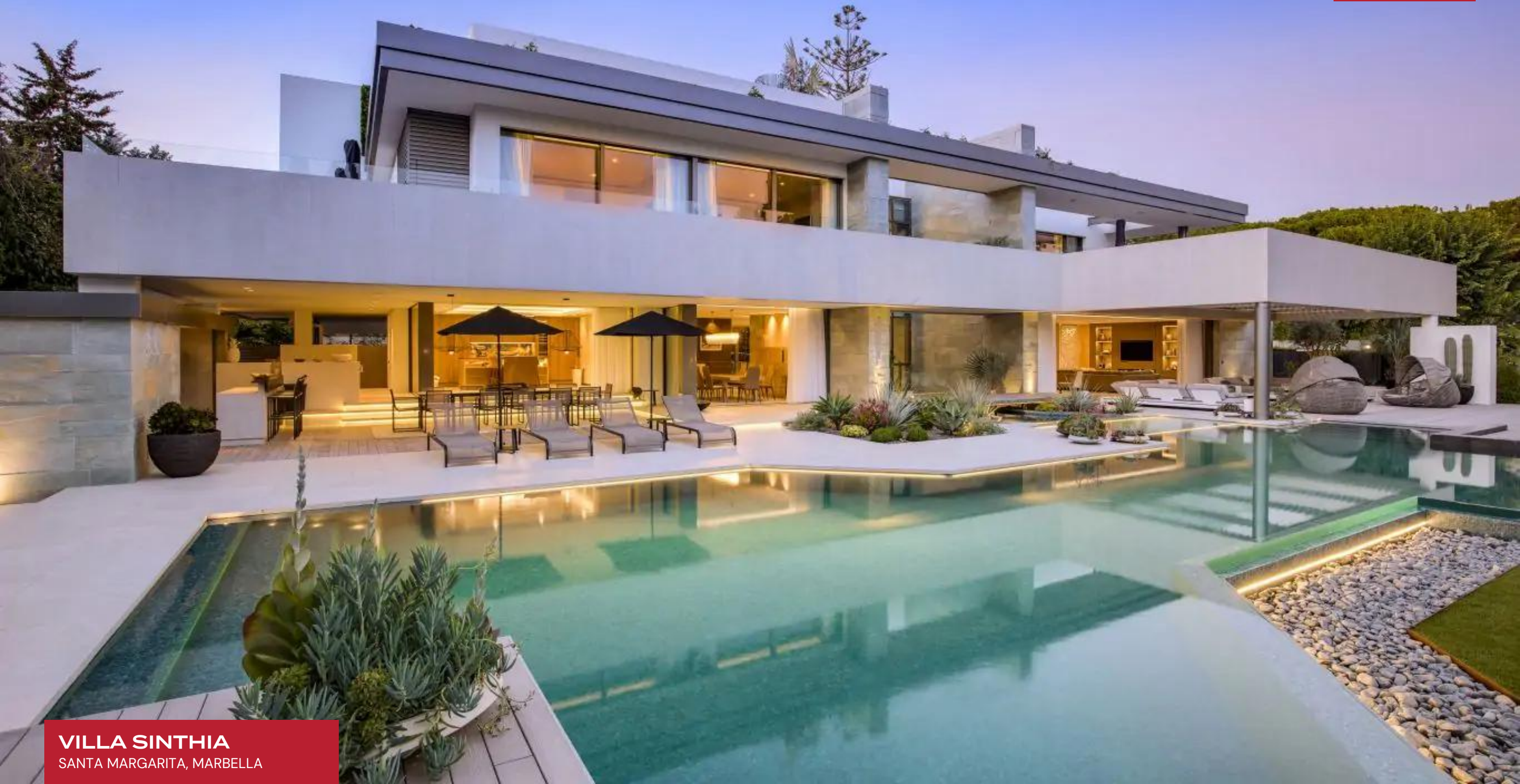
VILLA SINTHIA SANTA MARGARITA, MARBELLA