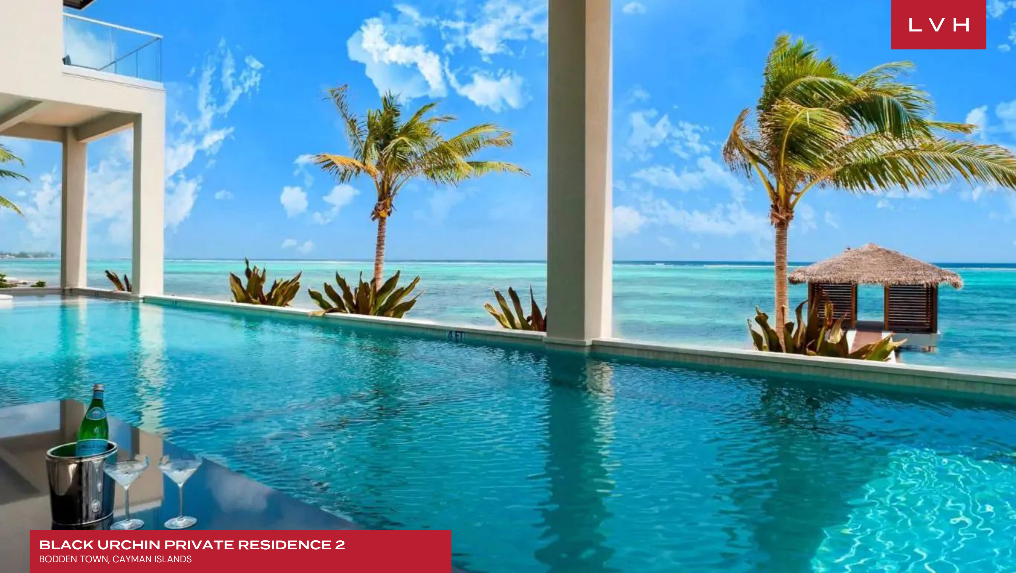
BLACK URCHIN PRIVATE RESIDENCE 2 BODDEN TOWN, CAYMAN ISLANDS