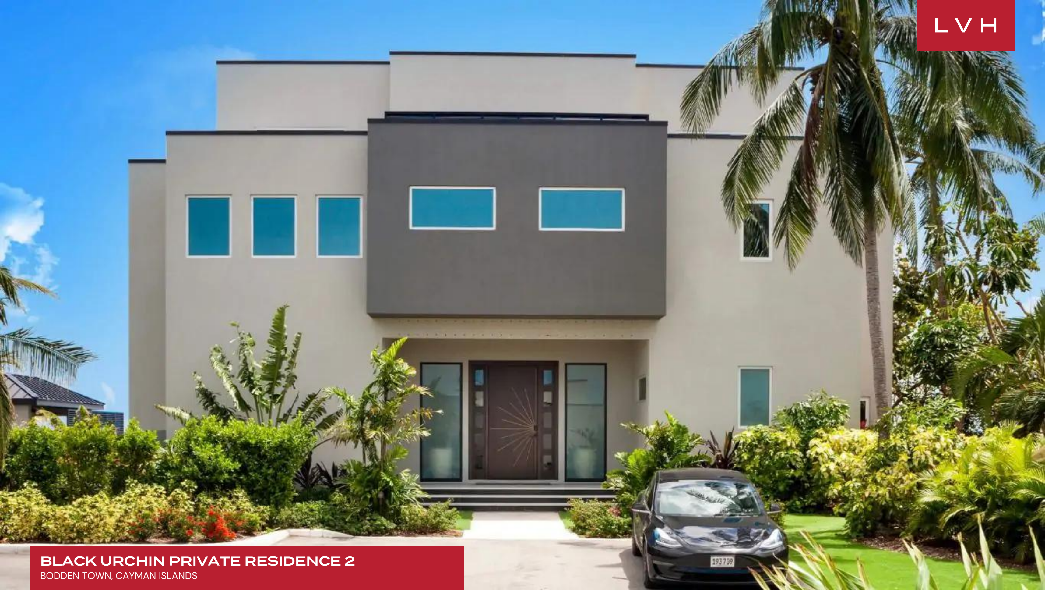
BLACK URCHIN PRIVATE RESIDENCE 2 BODDEN TOWN, CAYMAN ISLANDS