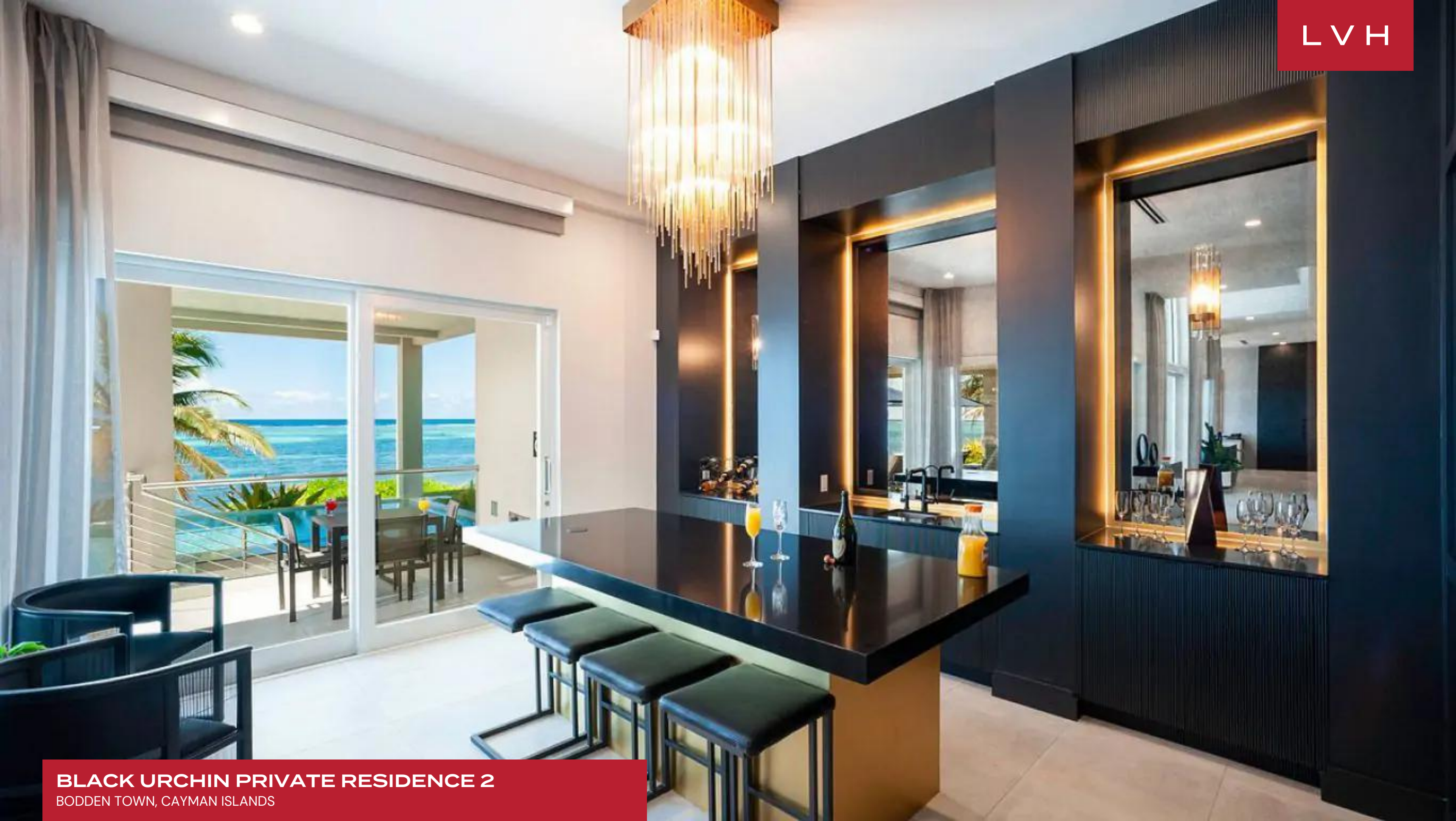
BLACK URCHIN PRIVATE RESIDENCE 2 BODDEN TOWN, CAYMAN ISLANDS