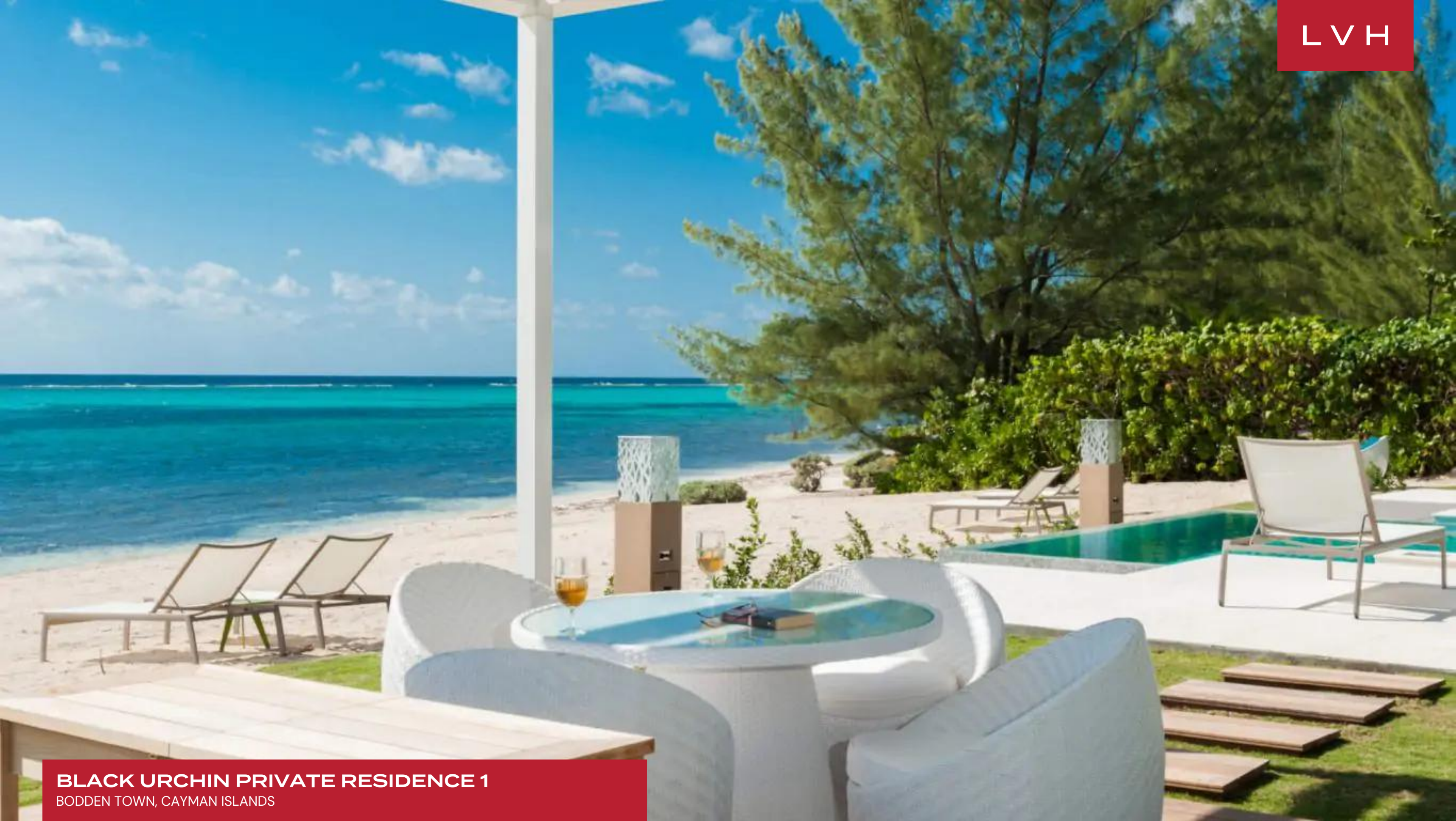
BLACK URCHIN PRIVATE RESIDENCE 1 BODDEN TOWN, CAYMAN ISLANDS