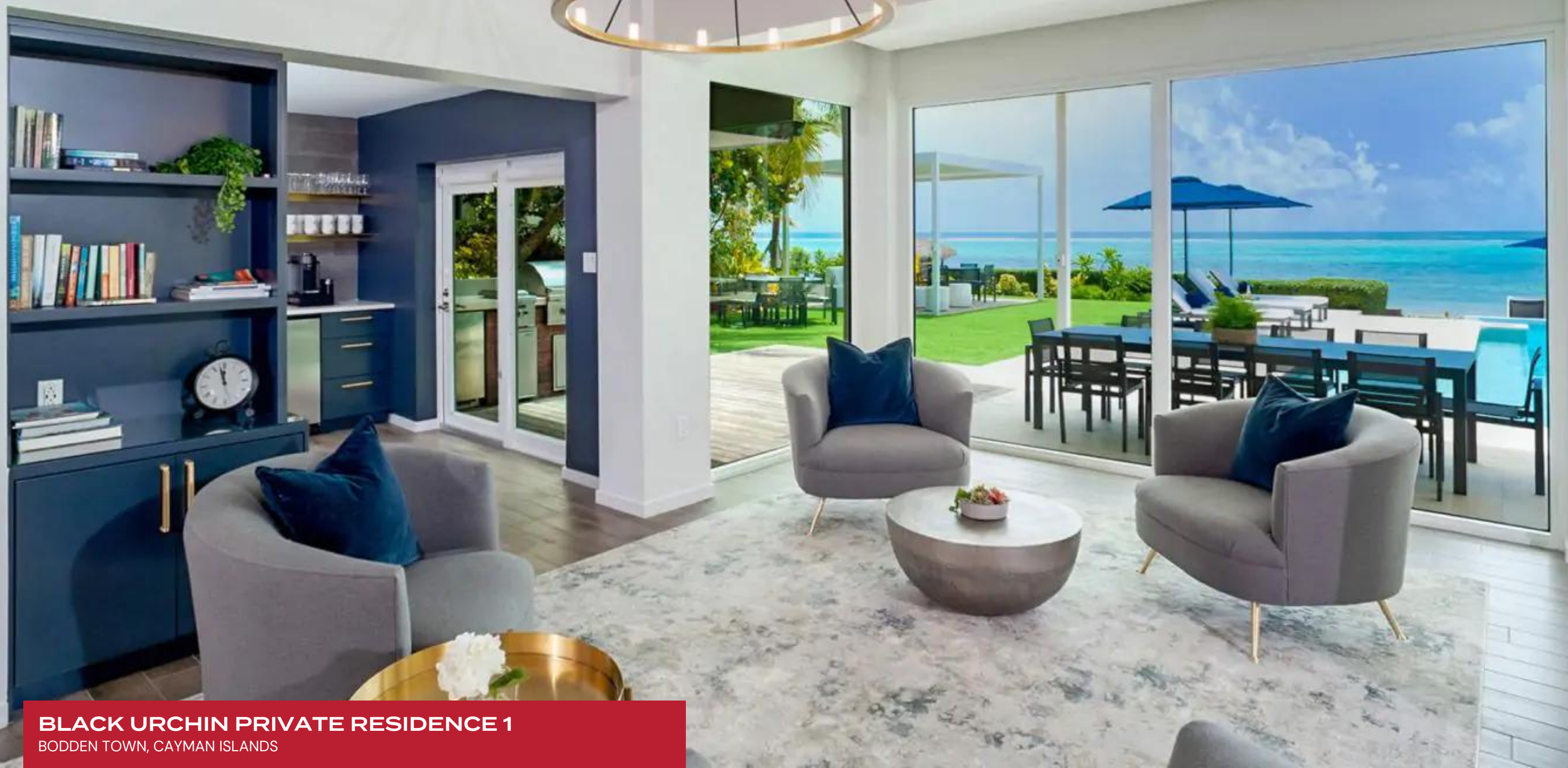
BLACK URCHIN PRIVATE RESIDENCE 1 BODDEN TOWN, CAYMAN ISLANDS