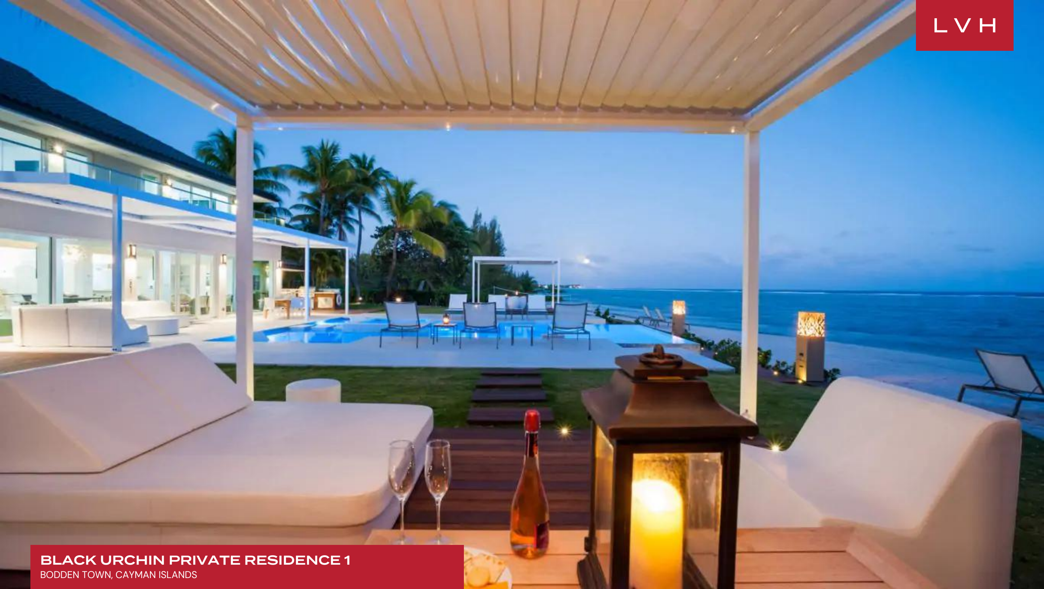
BLACK URCHIN PRIVATE RESIDENCE 1 BODDEN TOWN, CAYMAN ISLANDS