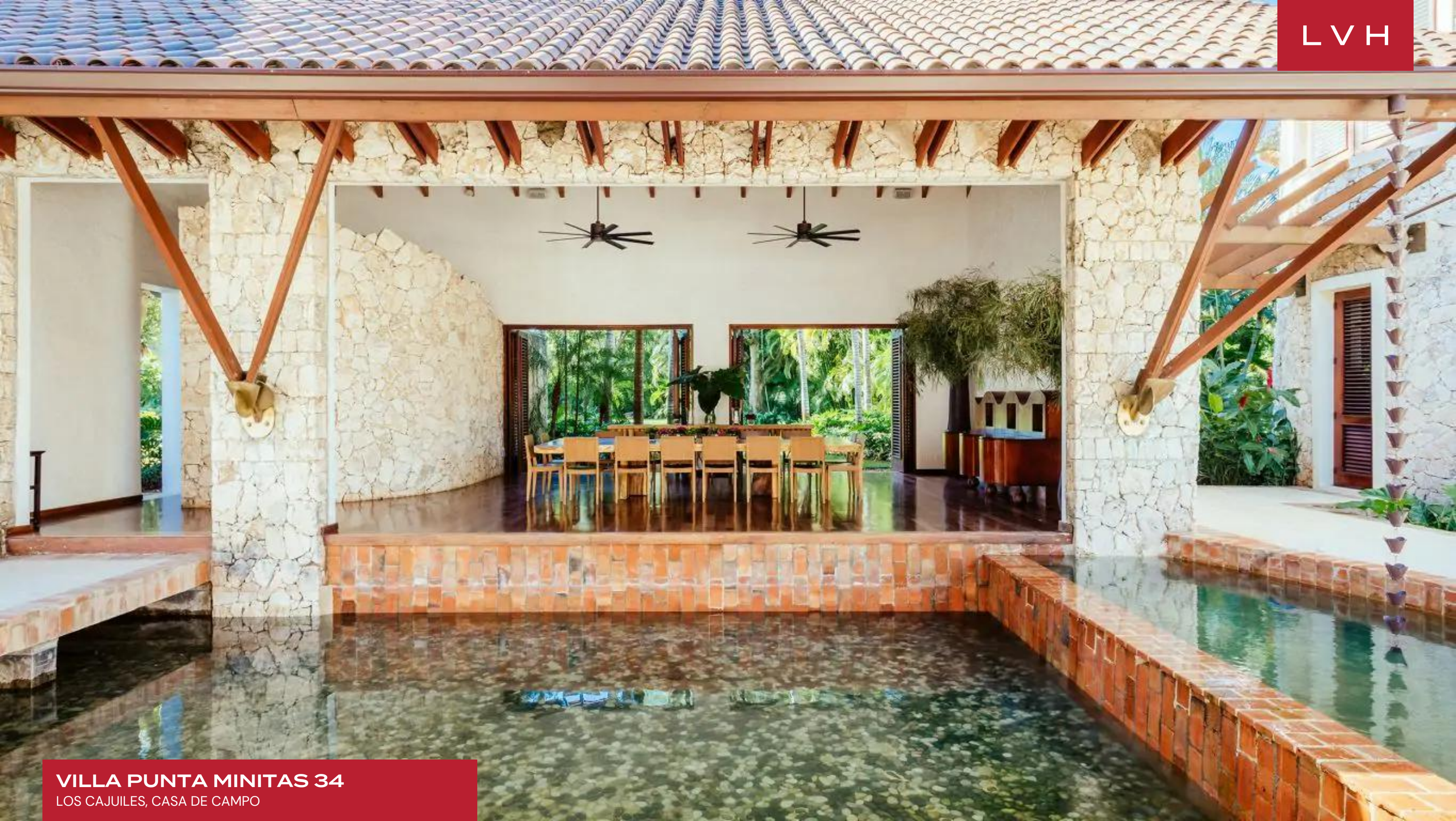
VILLA PUNTA MINITAS 34 LOS CAJUILES, CASA DE CAMPO