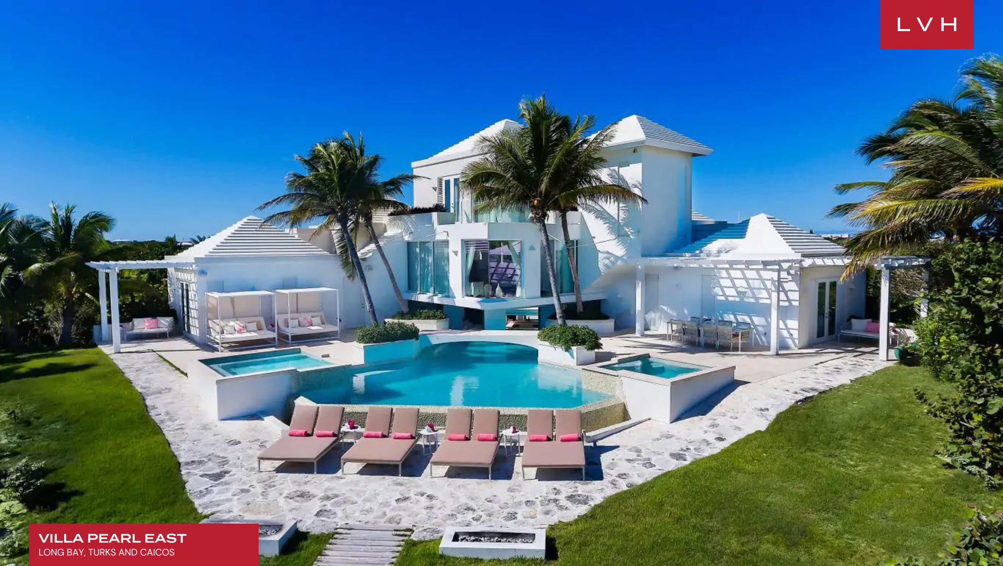
VILLA PEARL EAST LONG BAY, TURKS AND CAICOS