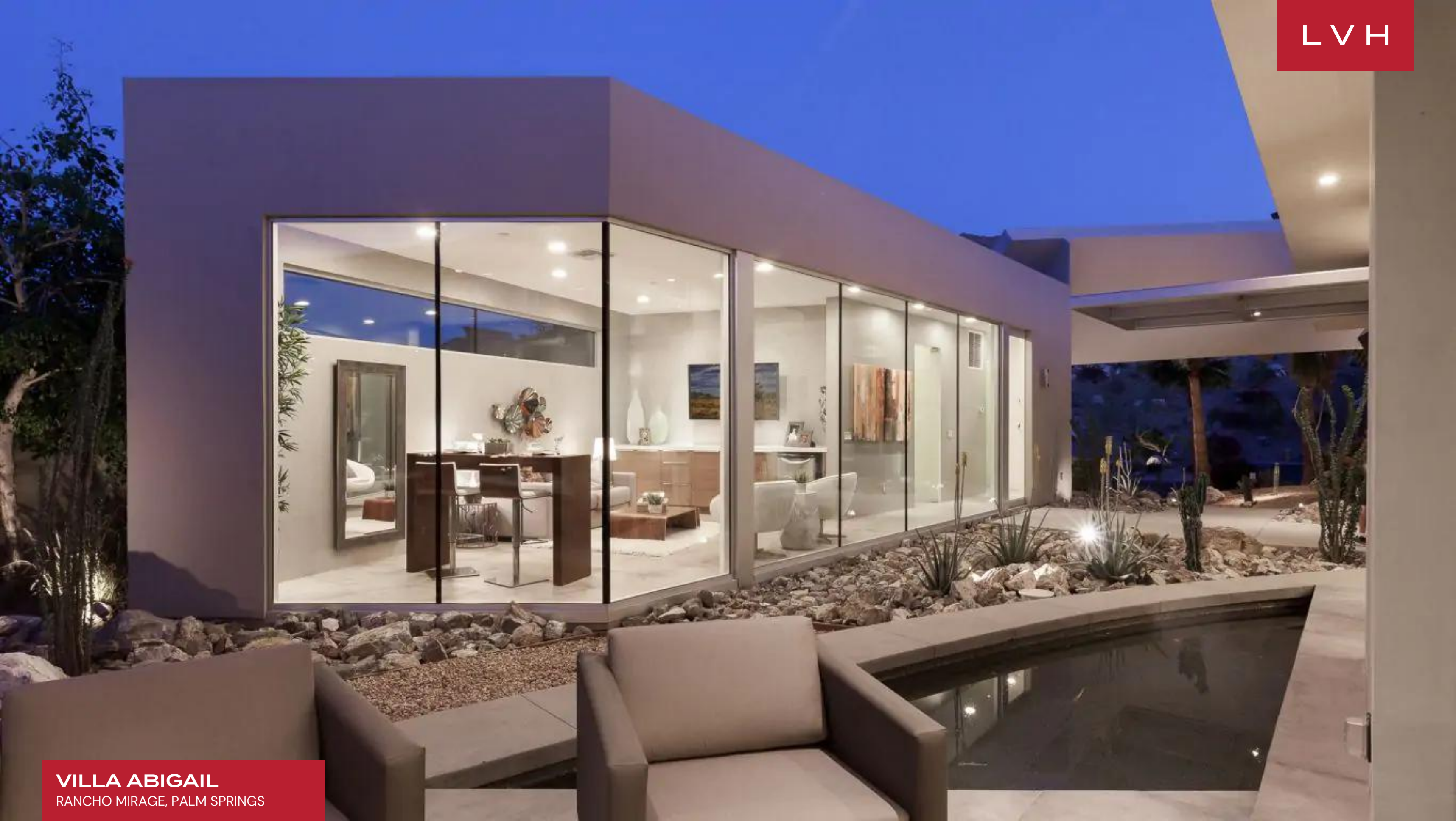
VILLA ABIGAIL RANCHO MIRAGE, PALM SPRINGS