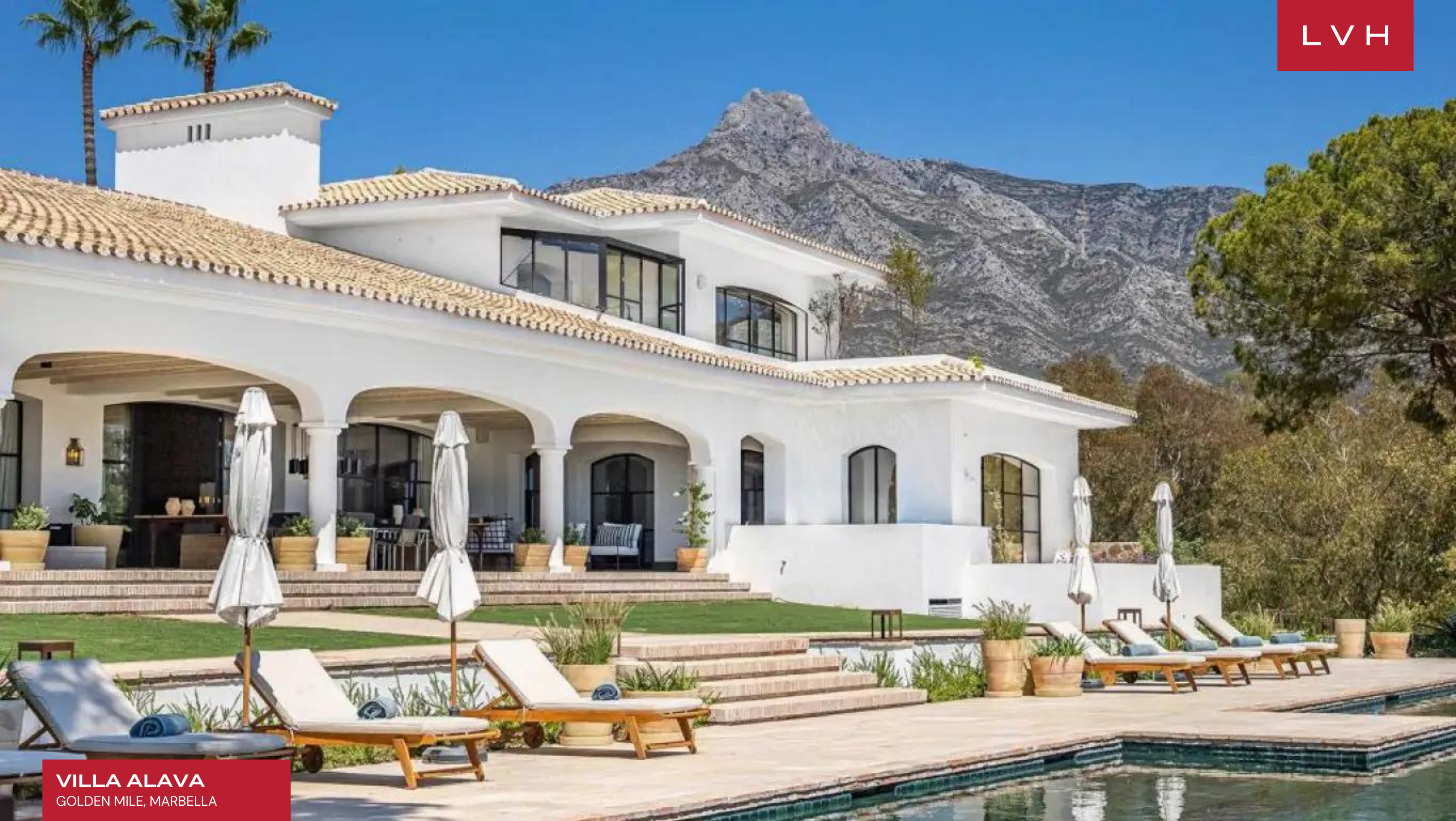
VILLA ALAVA GOLDEN MILE, MARBELLA