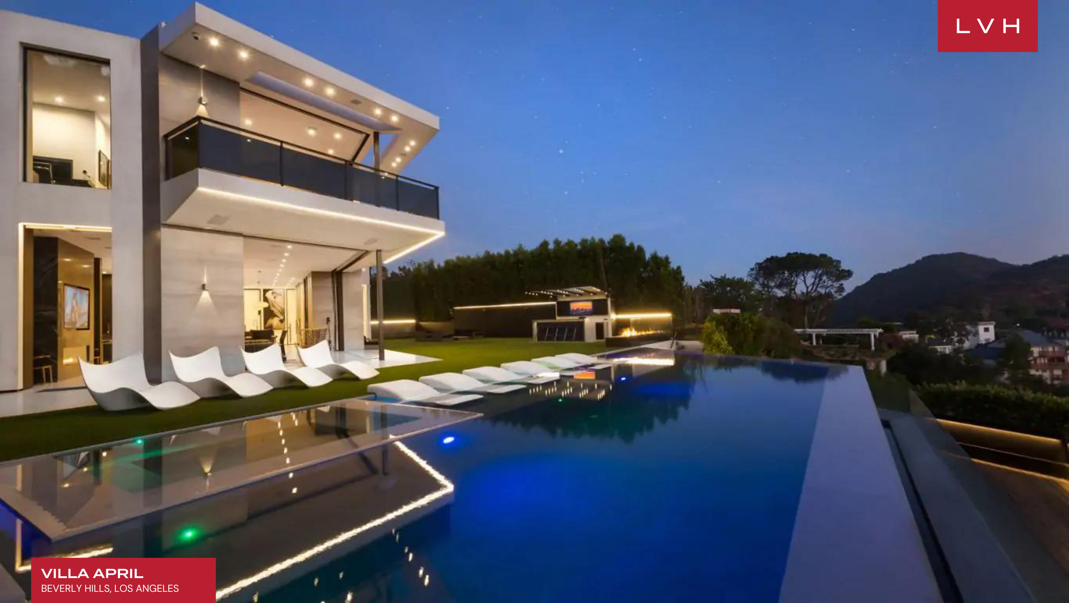
VILLA APRIL BEVERLY HILLS, LOS ANGELES