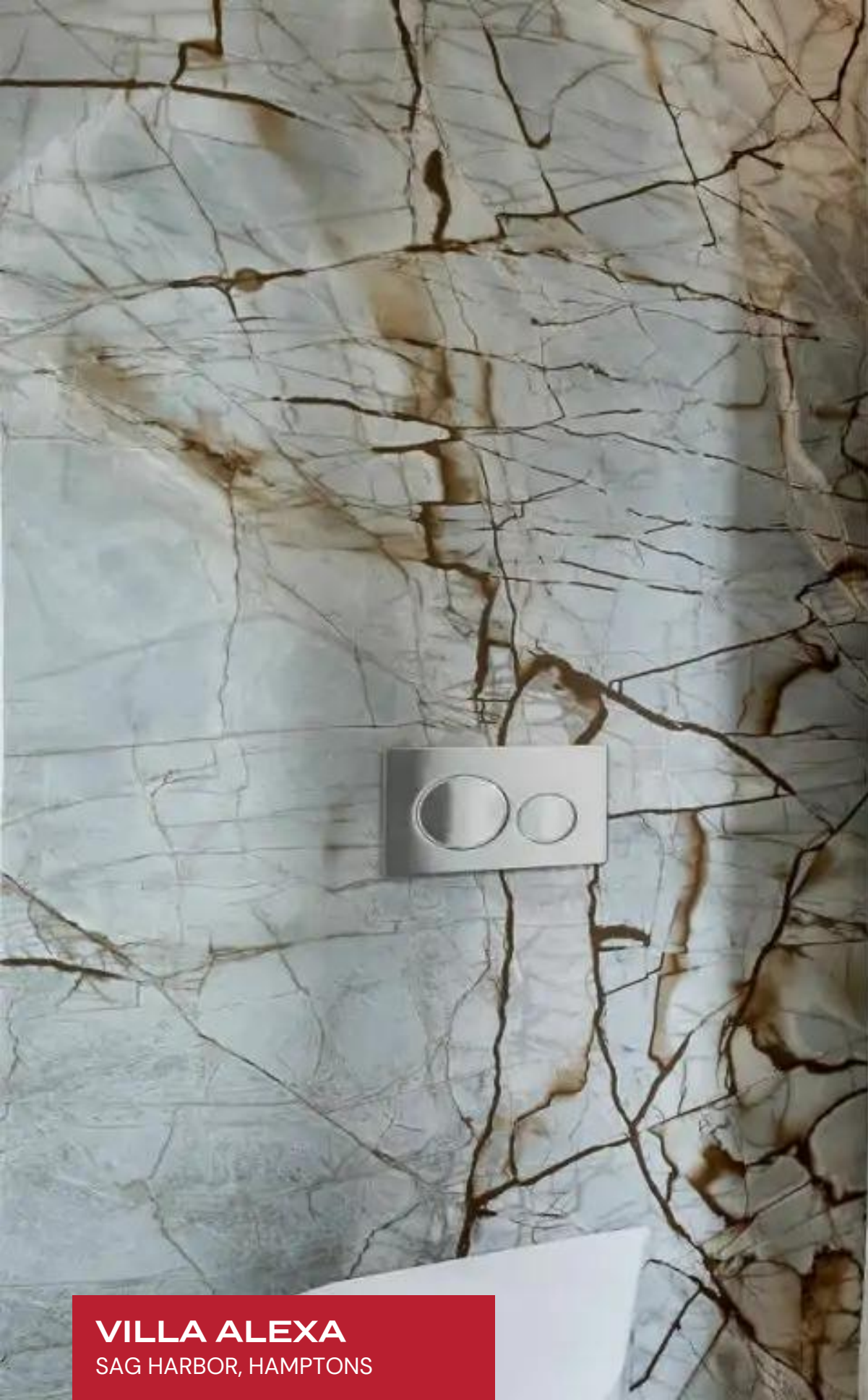
VILLA ALEXA SAG HARBOR, HAMPTONS