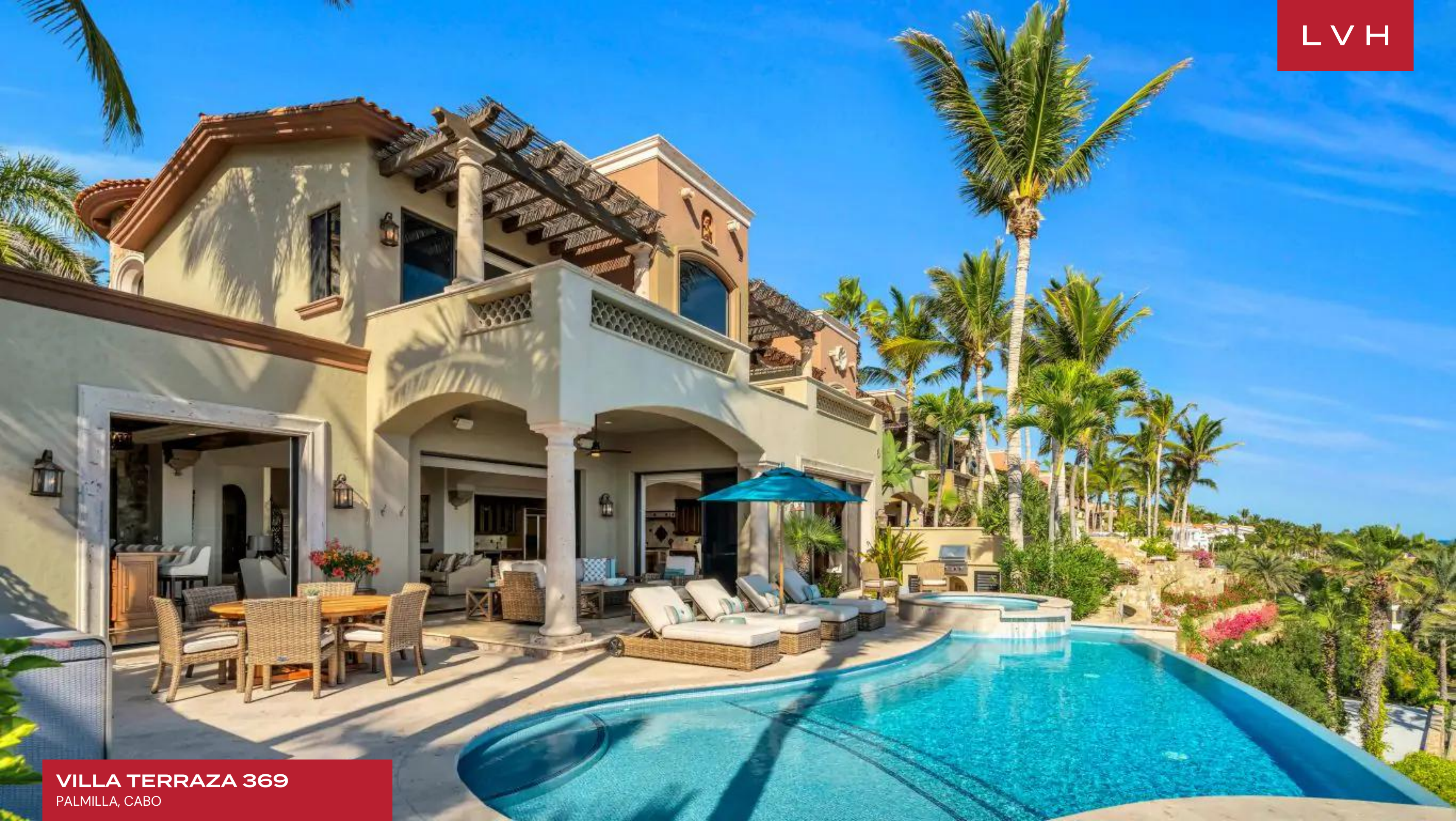
VILLA TERRAZA 369 PALMILLA, CABO