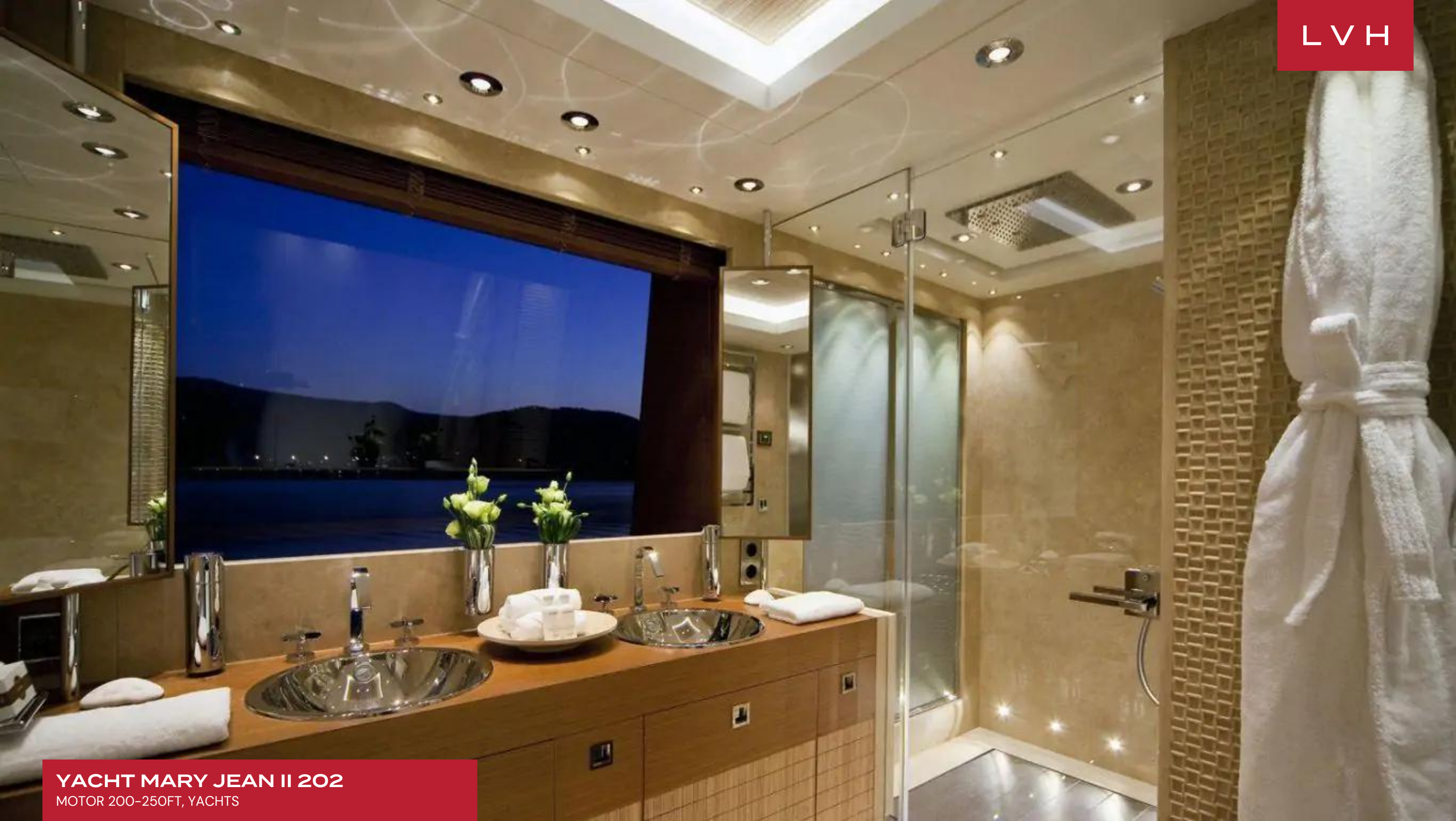
YACHT MARY JEAN II 202 MOTOR 200-250FT, YACHTS