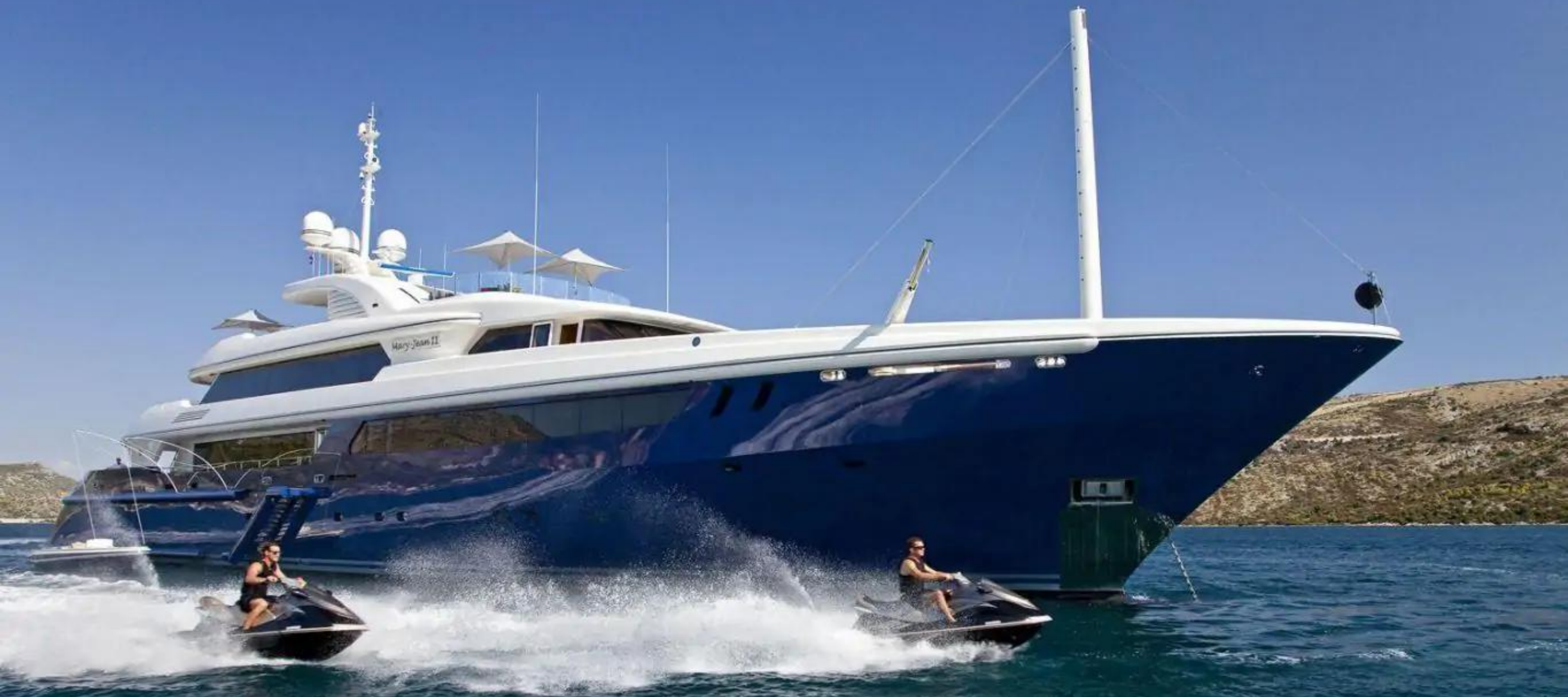
YACHT MARY JEAN II 202 MOTOR 200-250FT, YACHTS