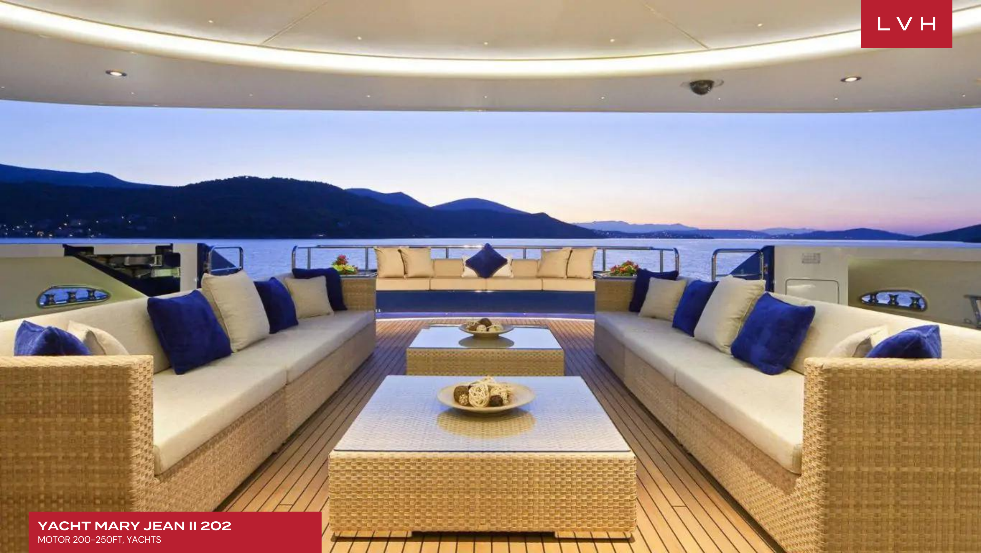
YACHT MARY JEAN II 202 MOTOR 200-250FT, YACHTS