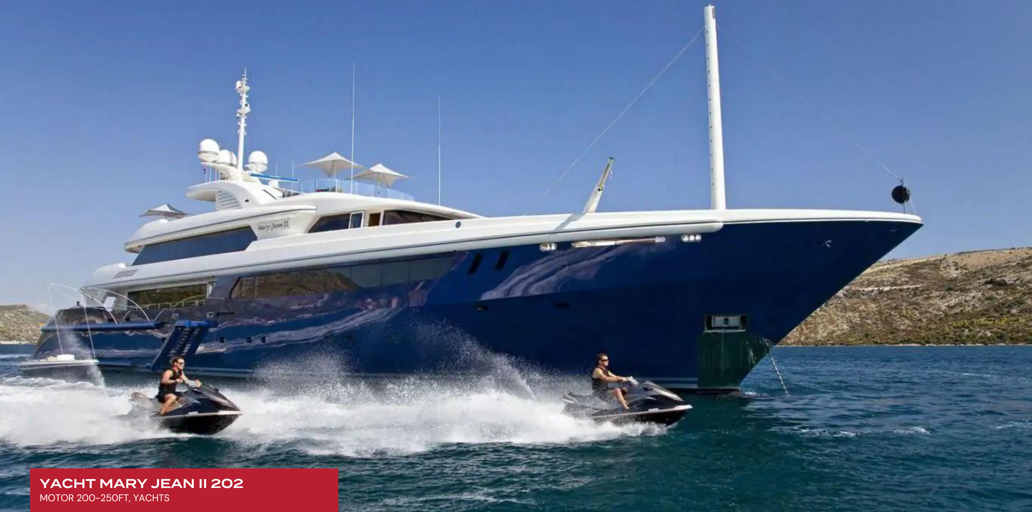
YACHT MARY JEAN II 202 MOTOR 200-250FT, YACHTS