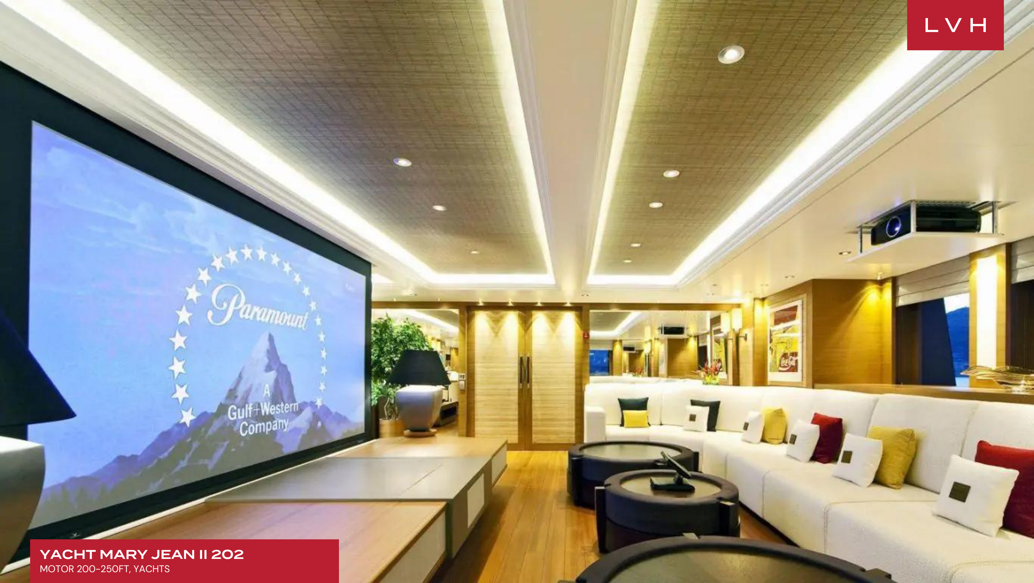
YACHT MARY JEAN II 202 MOTOR 200-250FT, YACHTS