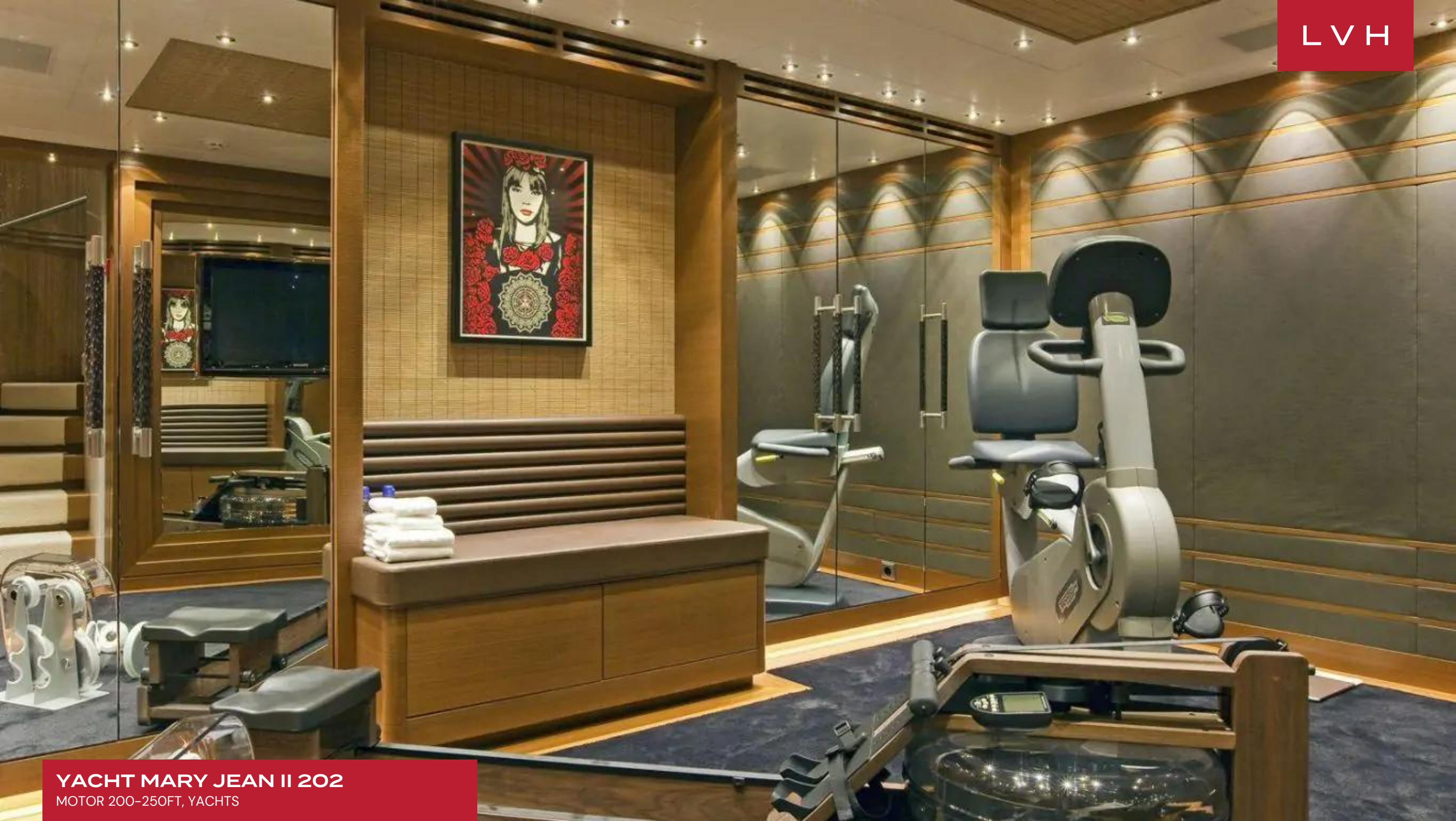
YACHT MARY JEAN II 202 MOTOR 200-250FT, YACHTS