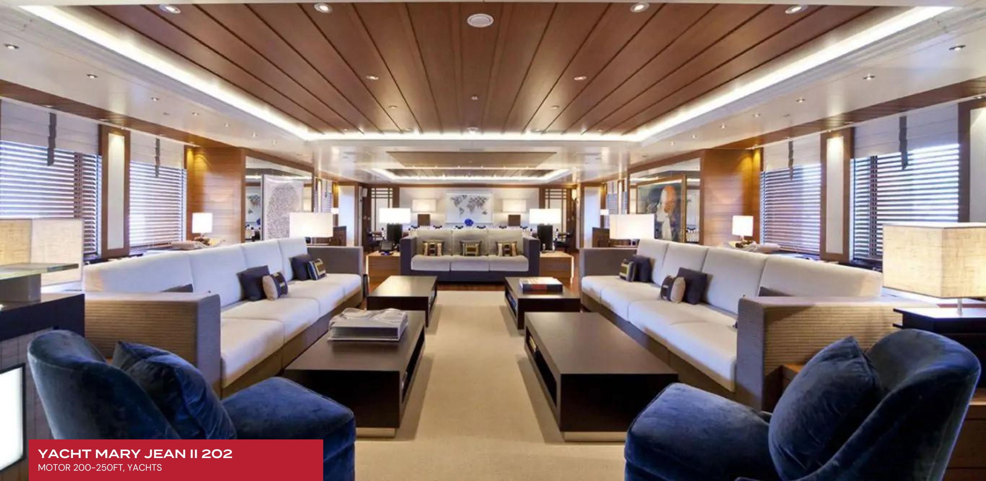
YACHT MARY JEAN II 202 MOTOR 200-250FT, YACHTS