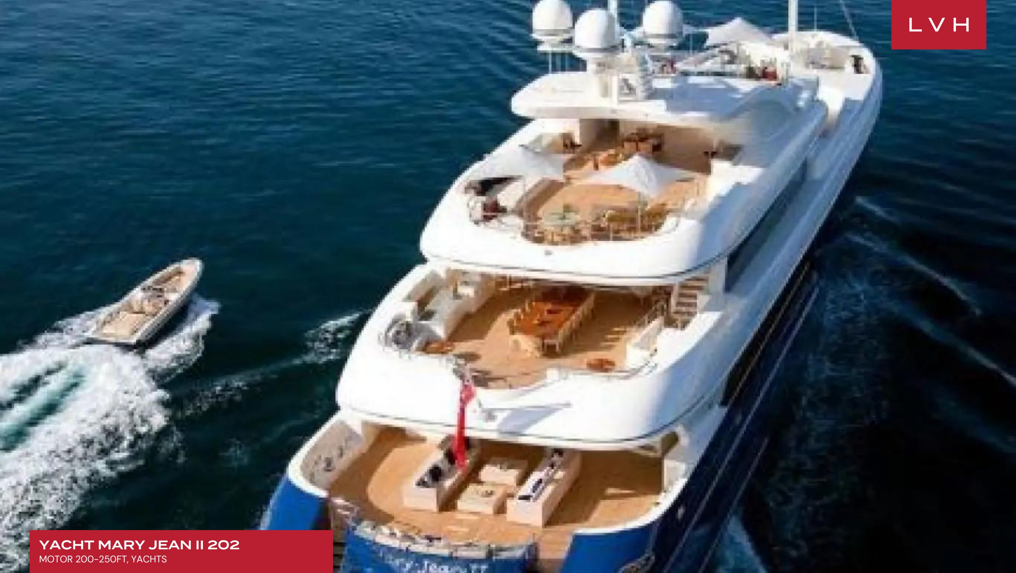
YACHT MARY JEAN II 202 MOTOR 200-250FT, YACHTS