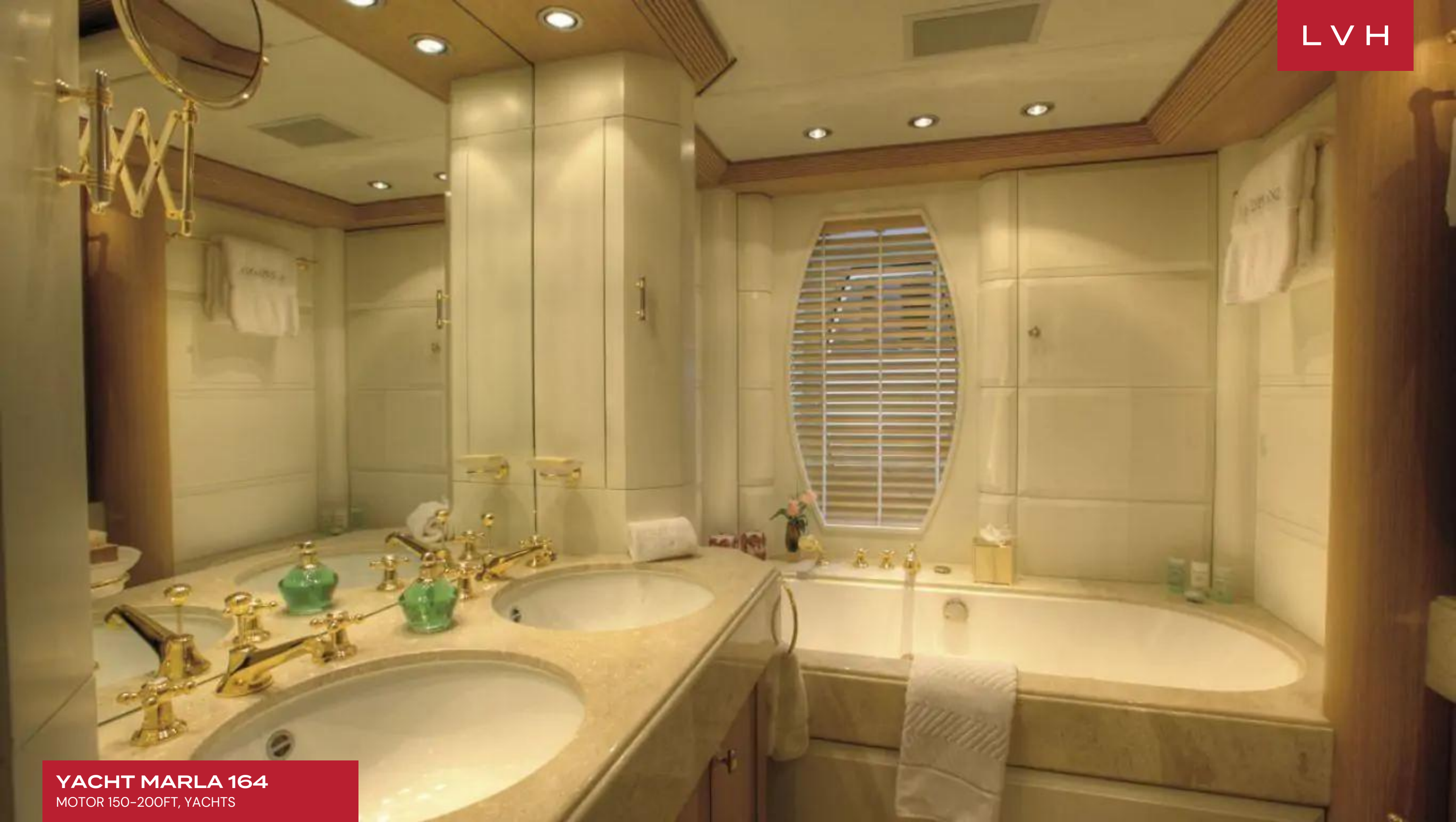
YACHT MARLA 164 MOTOR 150-200FT, YACHTS