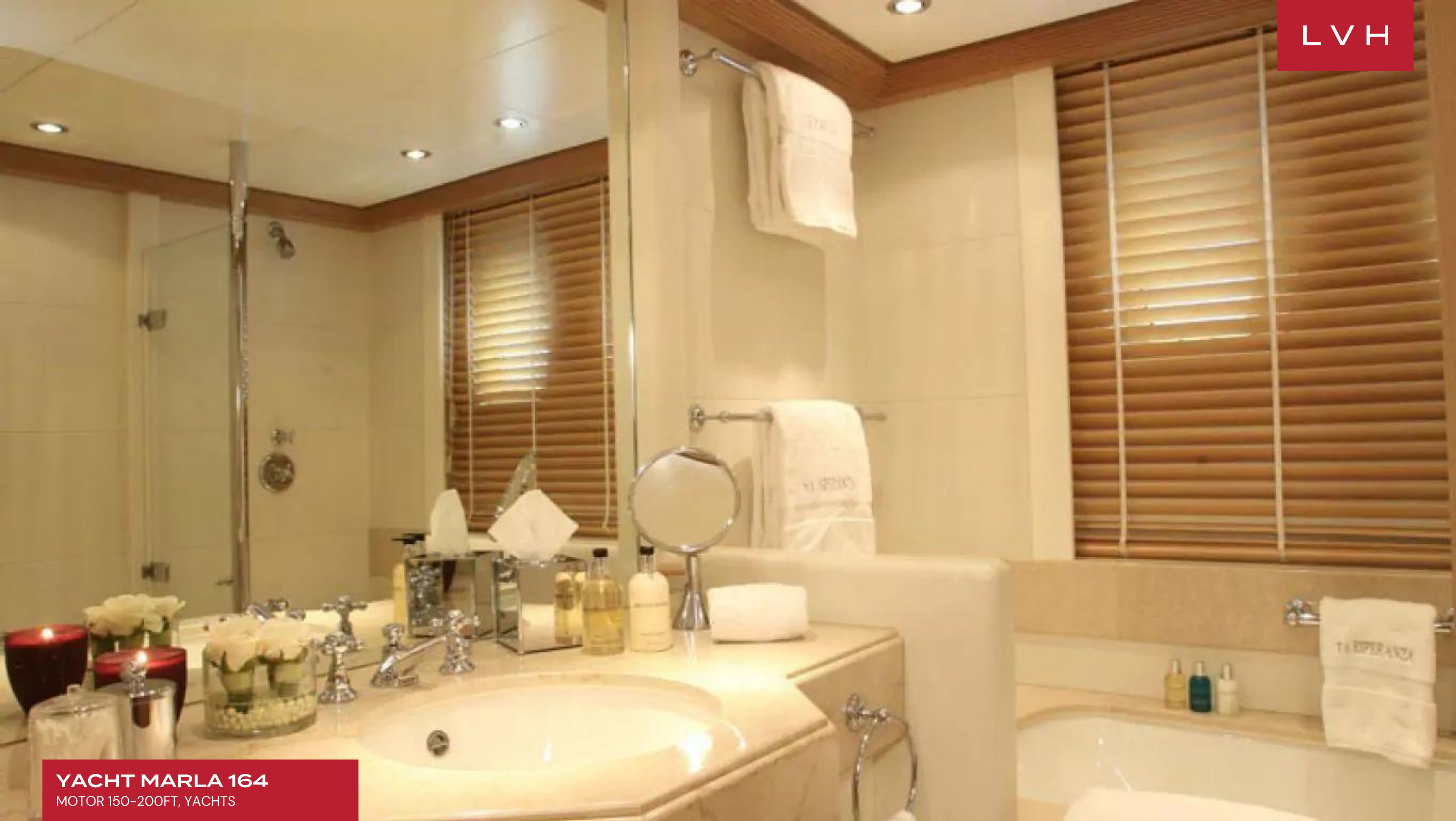
YACHT MARLA 164 MOTOR 150-200FT, YACHTS