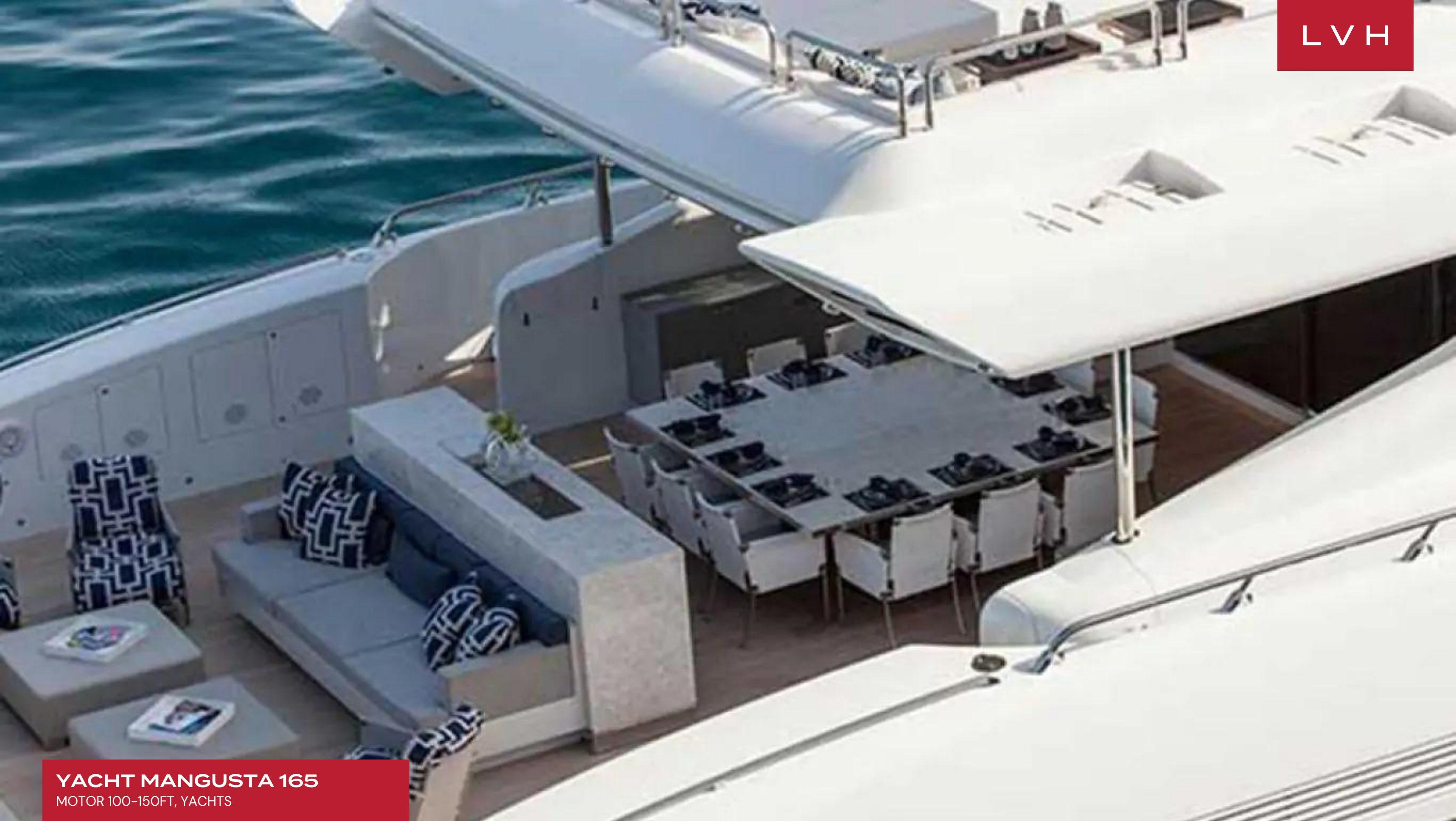
YACHT MANGUSTA 165 MOTOR 100-150FT, YACHTS