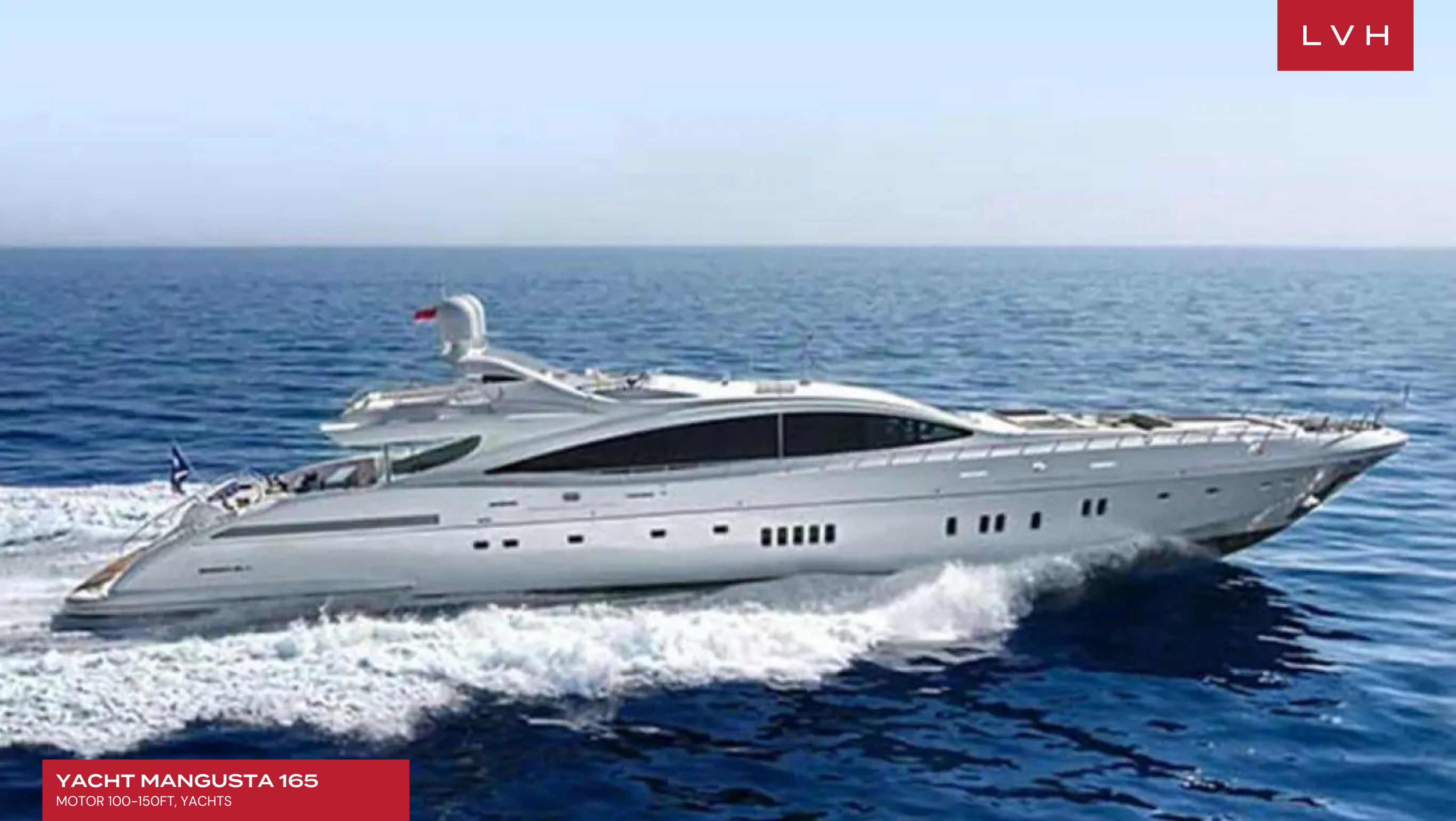
YACHT MANGUSTA 165 MOTOR 100-150FT, YACHTS