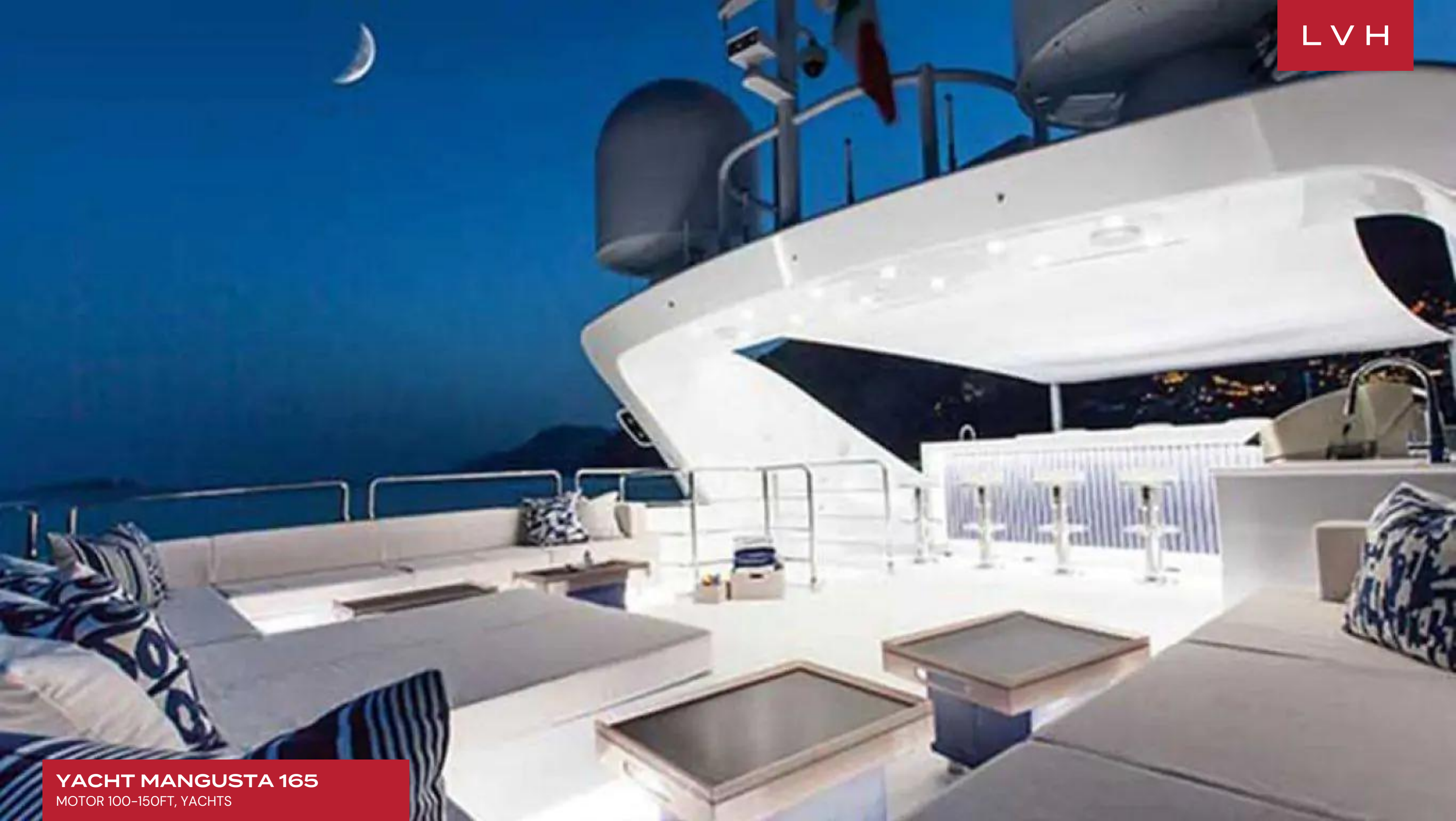
YACHT MANGUSTA 165 MOTOR 100-150FT, YACHTS