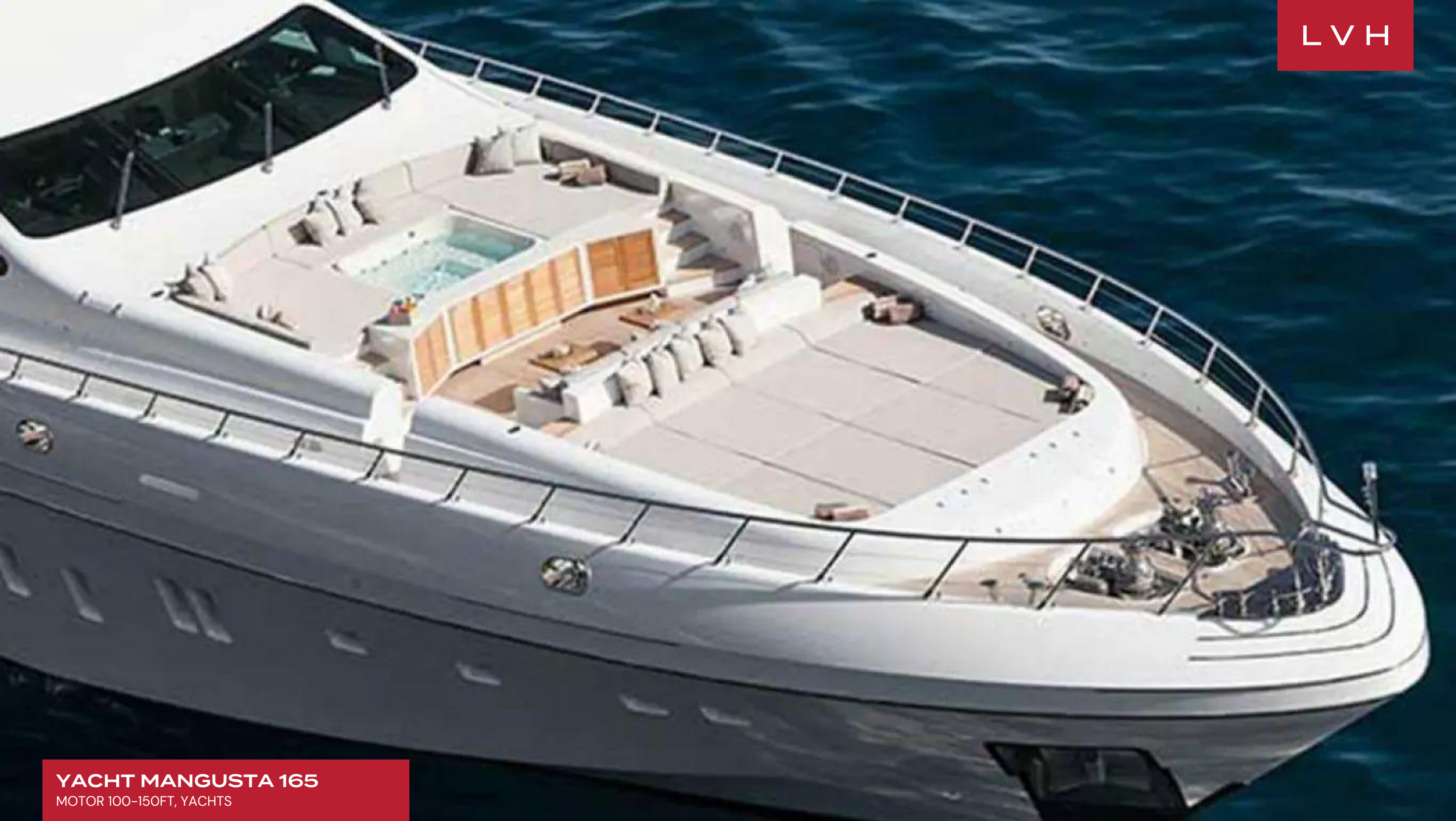
YACHT MANGUSTA 165 MOTOR 100-150FT, YACHTS