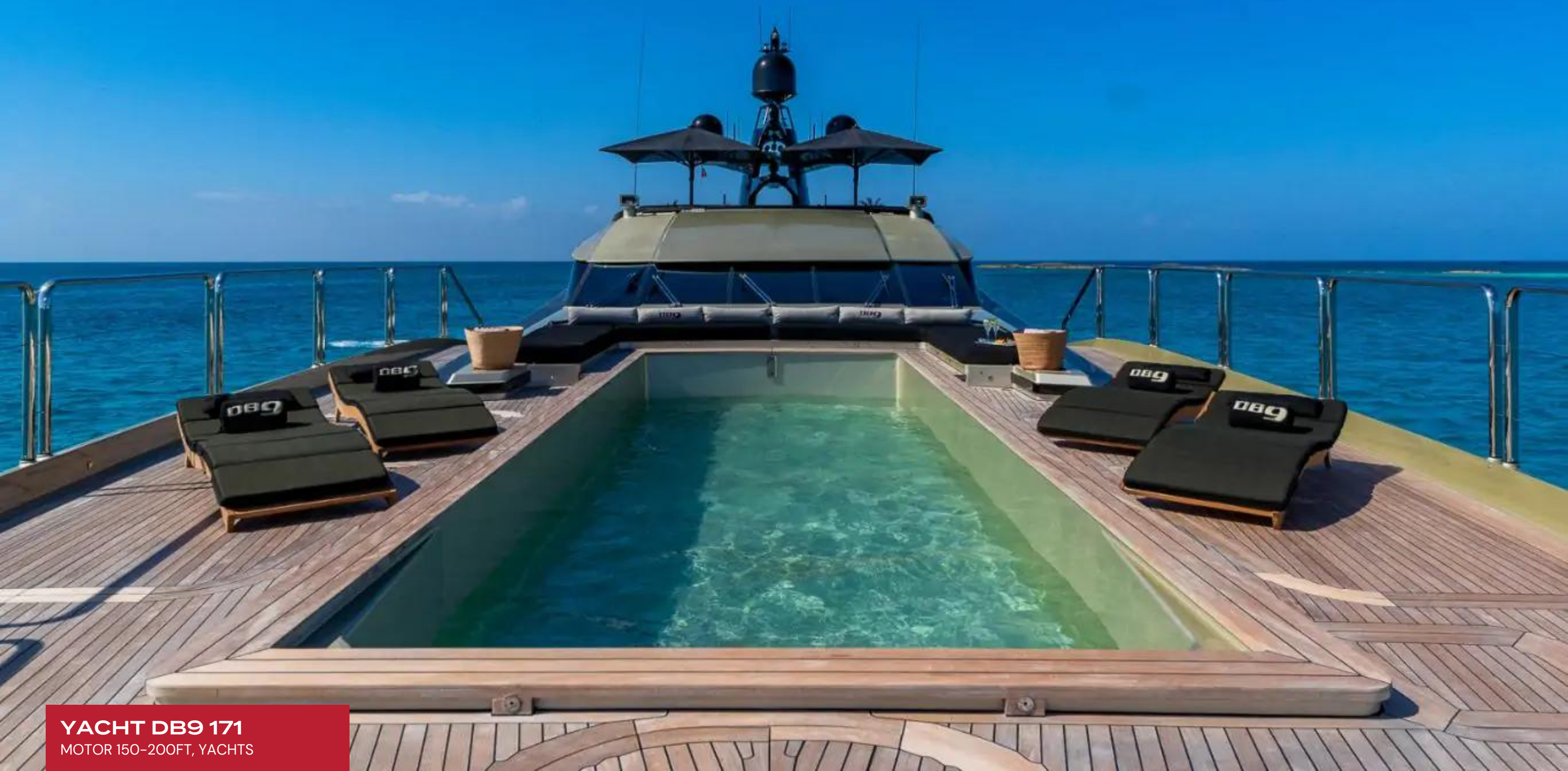
YACHT DB9 171 MOTOR 150-200FT, YACHTS