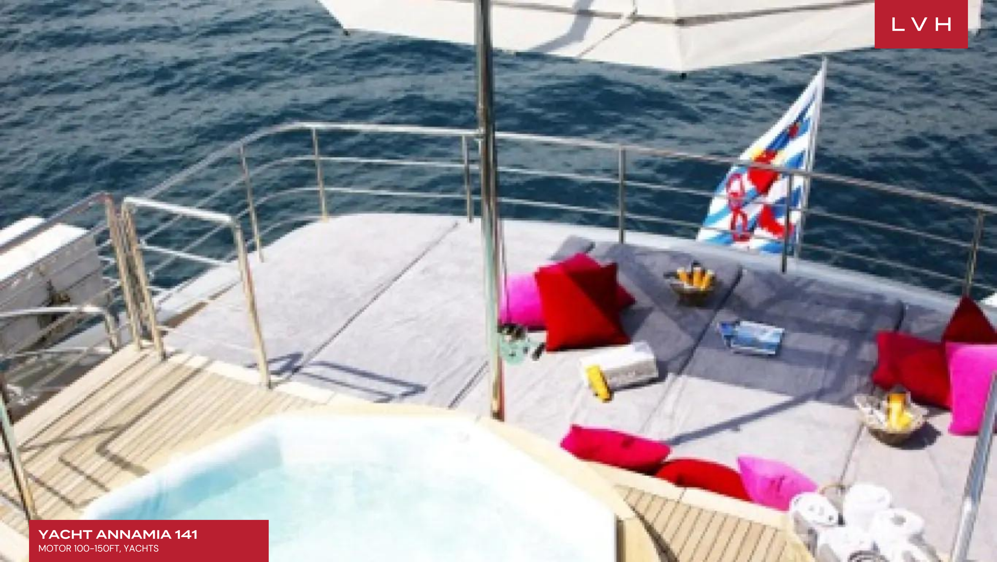
YACHT ANNAMIA 141 MOTOR 100-150FT, YACHTS