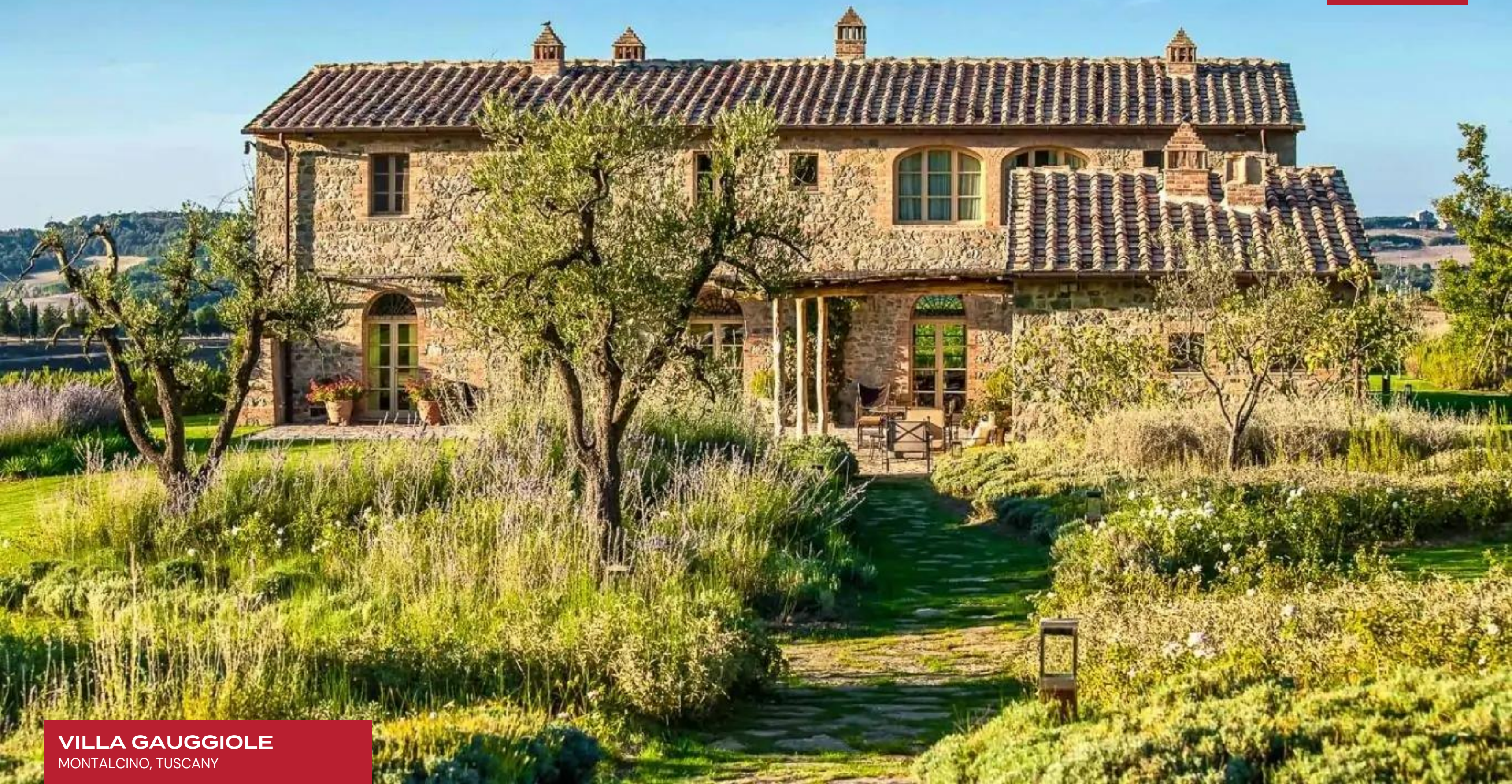
VILLA GAUGGIOLE MONTALCINO, TUSCANY