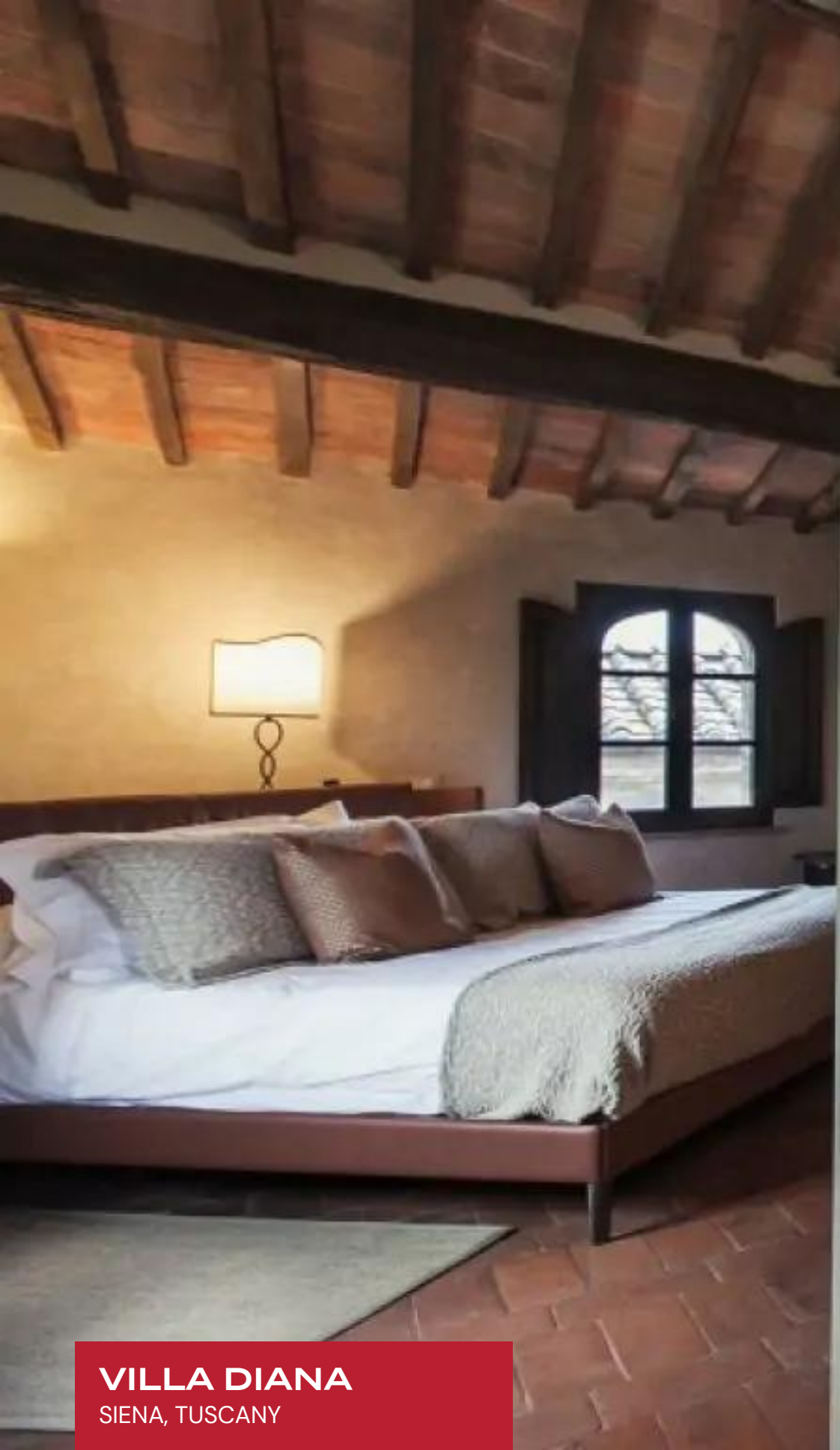
VILLA DIANA SIENA, TUSCANY