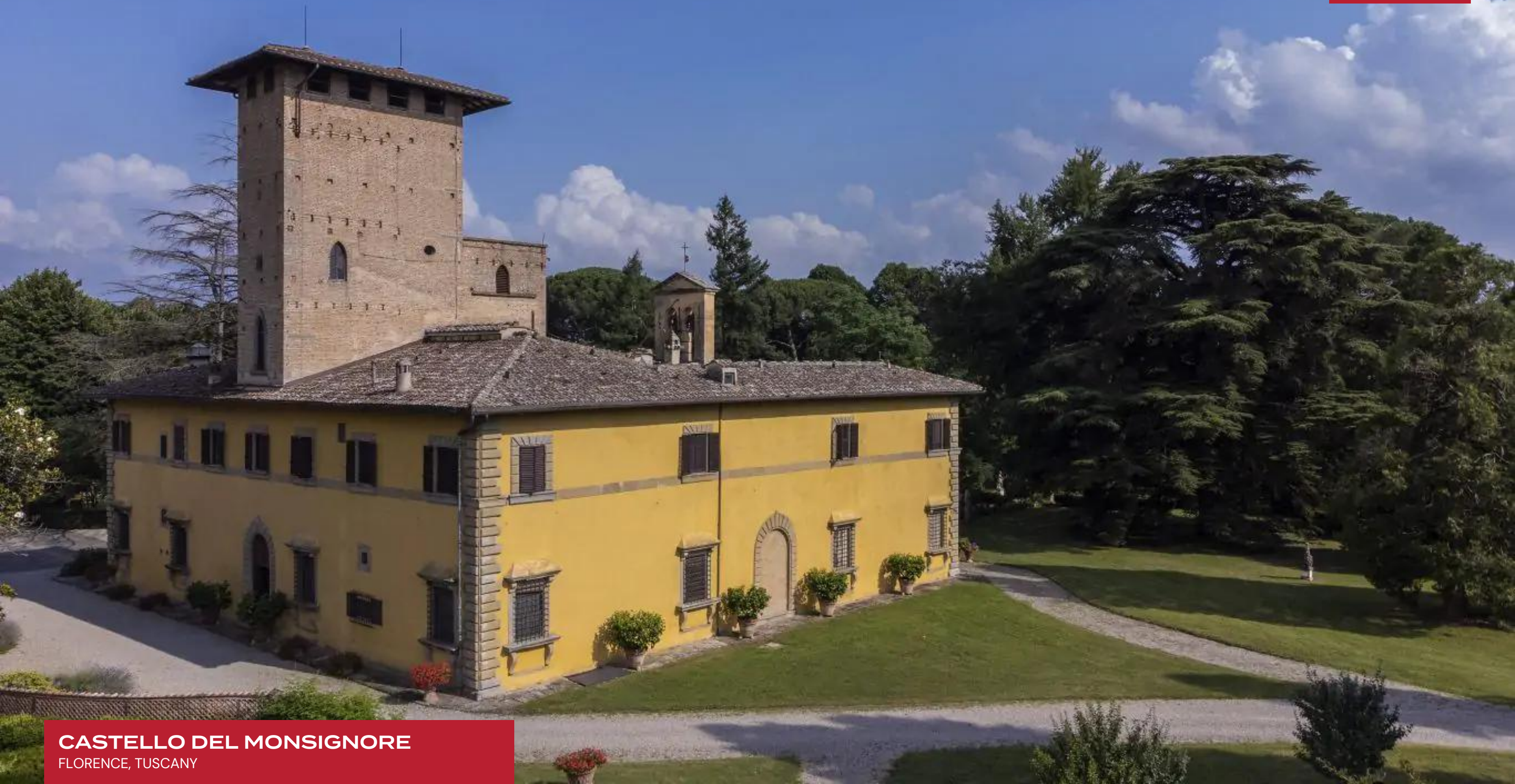
CASTELLO DEL MONSIGNORE FLORENCE, TUSCANY