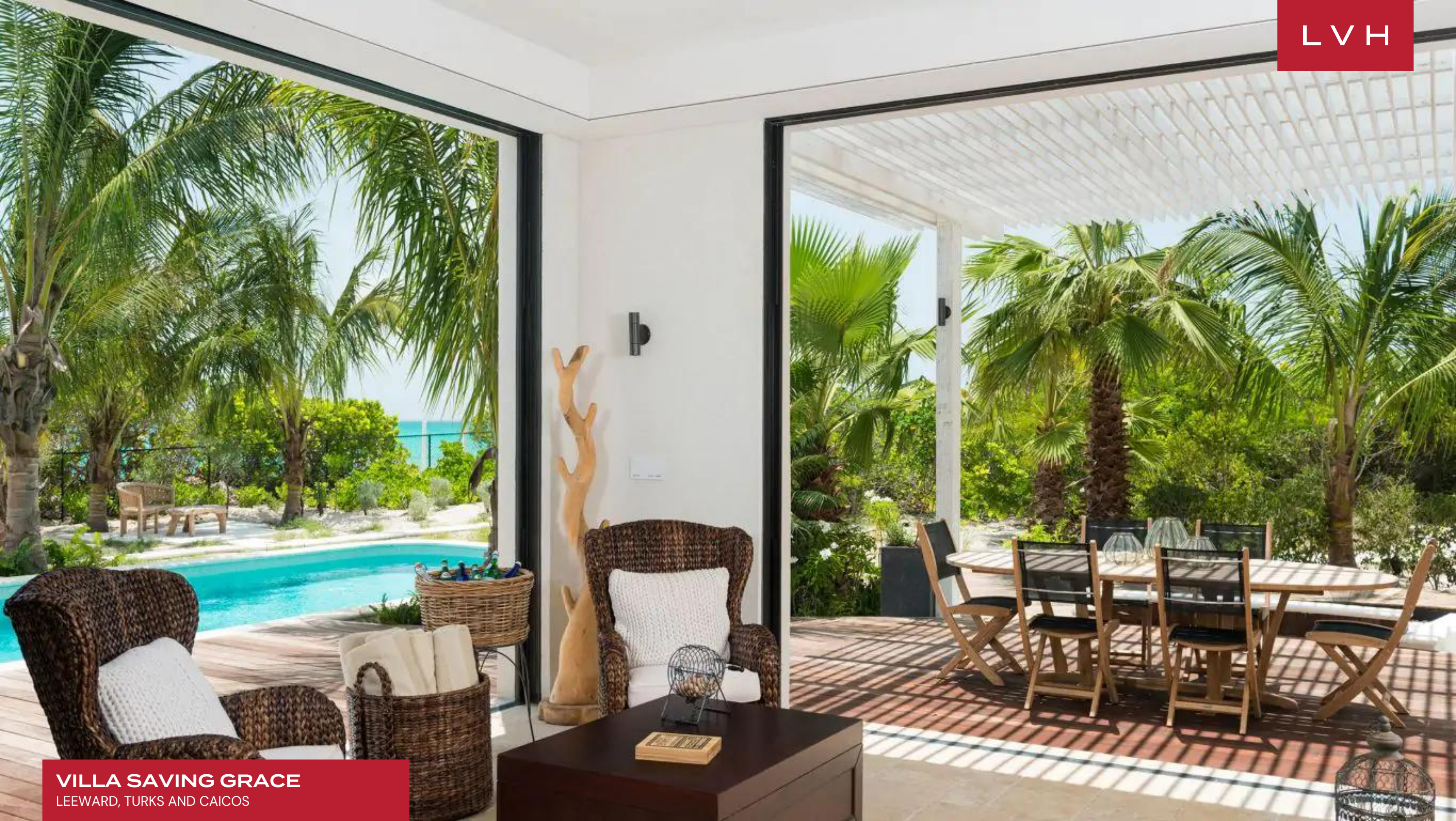
VILLA SAVING GRACE LEEWARD, TURKS AND CAICOS