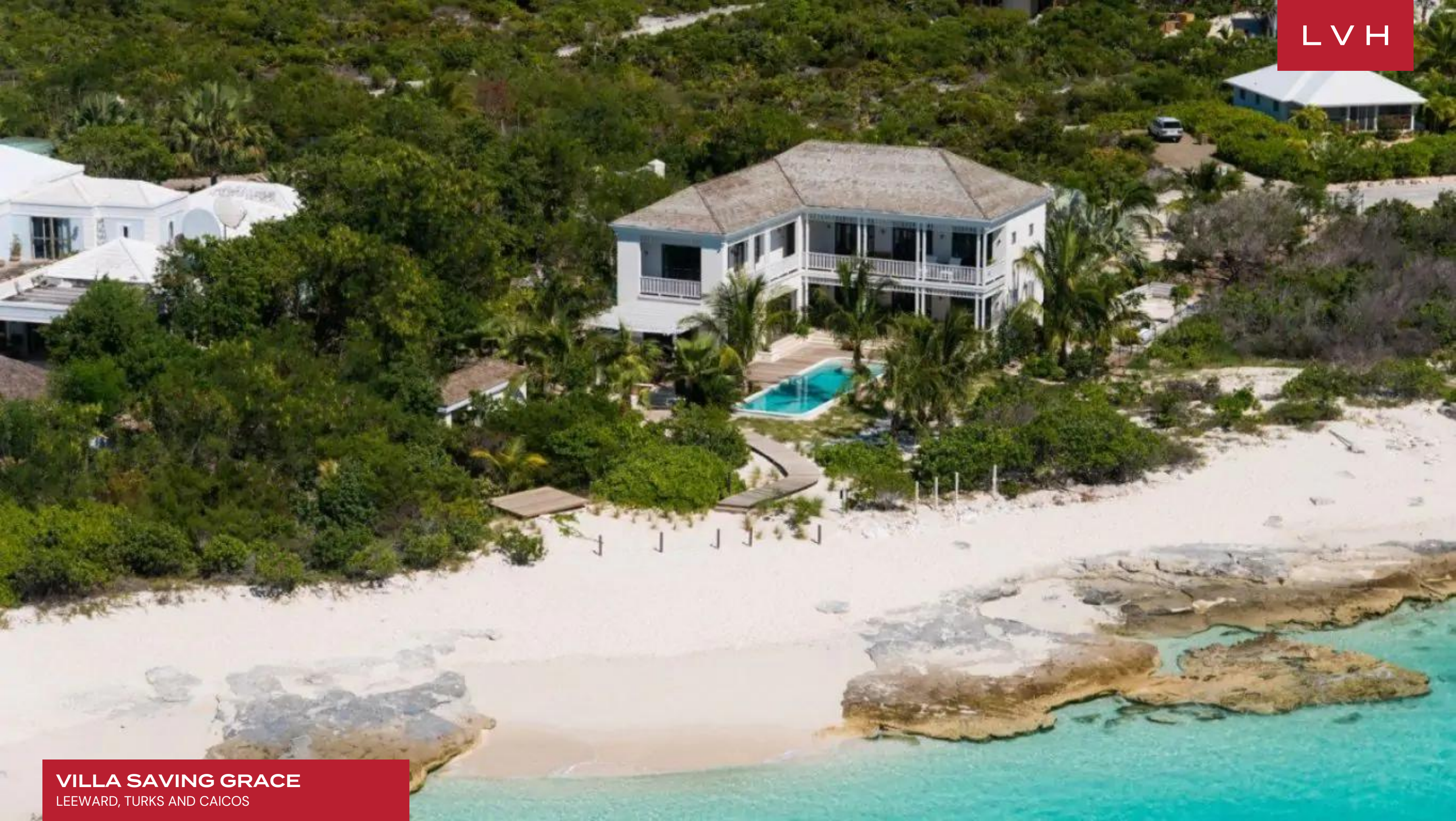
VILLA SAVING GRACE LEEWARD, TURKS AND CAICOS