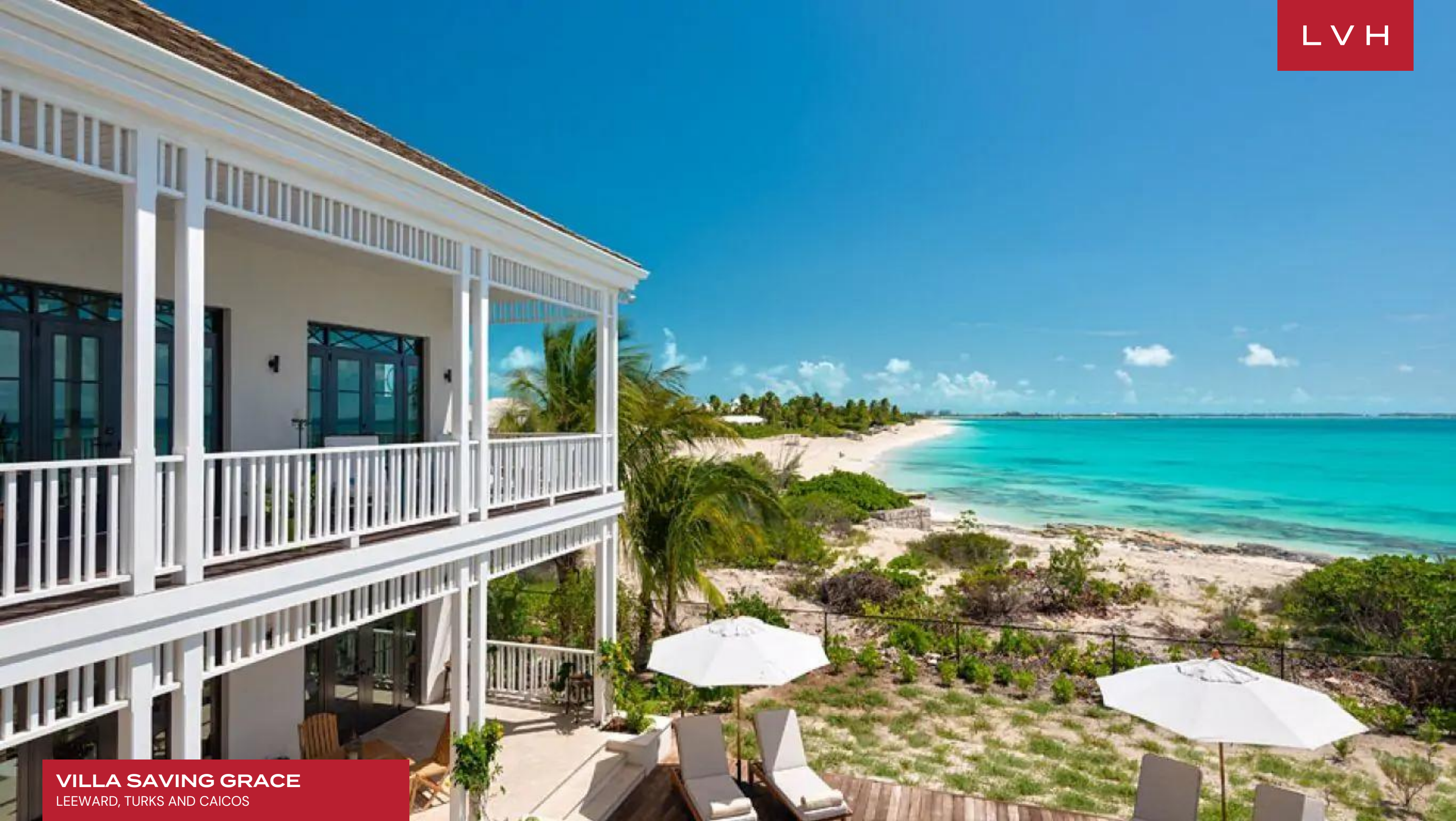
VILLA SAVING GRACE LEEWARD, TURKS AND CAICOS