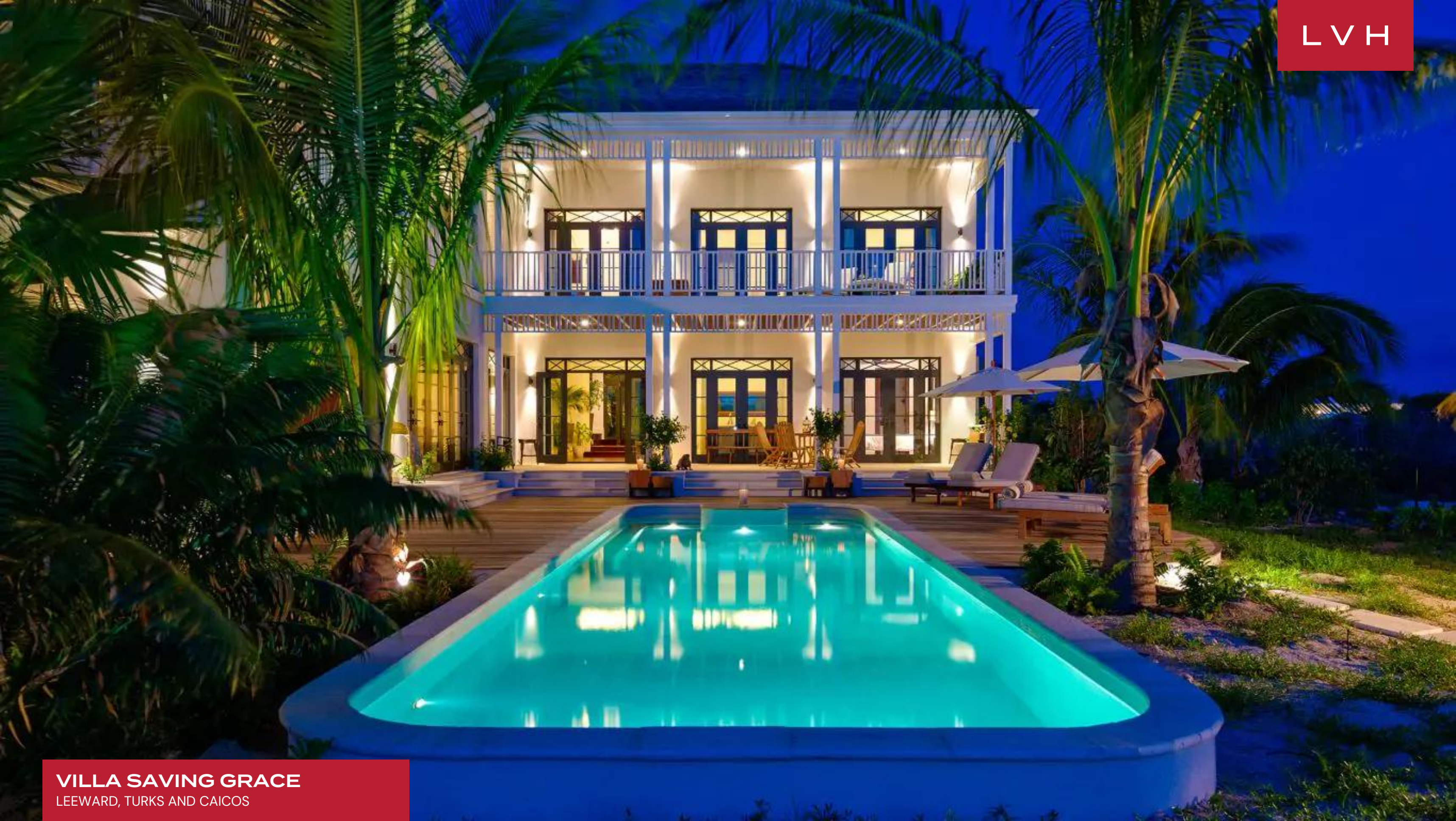
VILLA SAVING GRACE LEEWARD, TURKS AND CAICOS