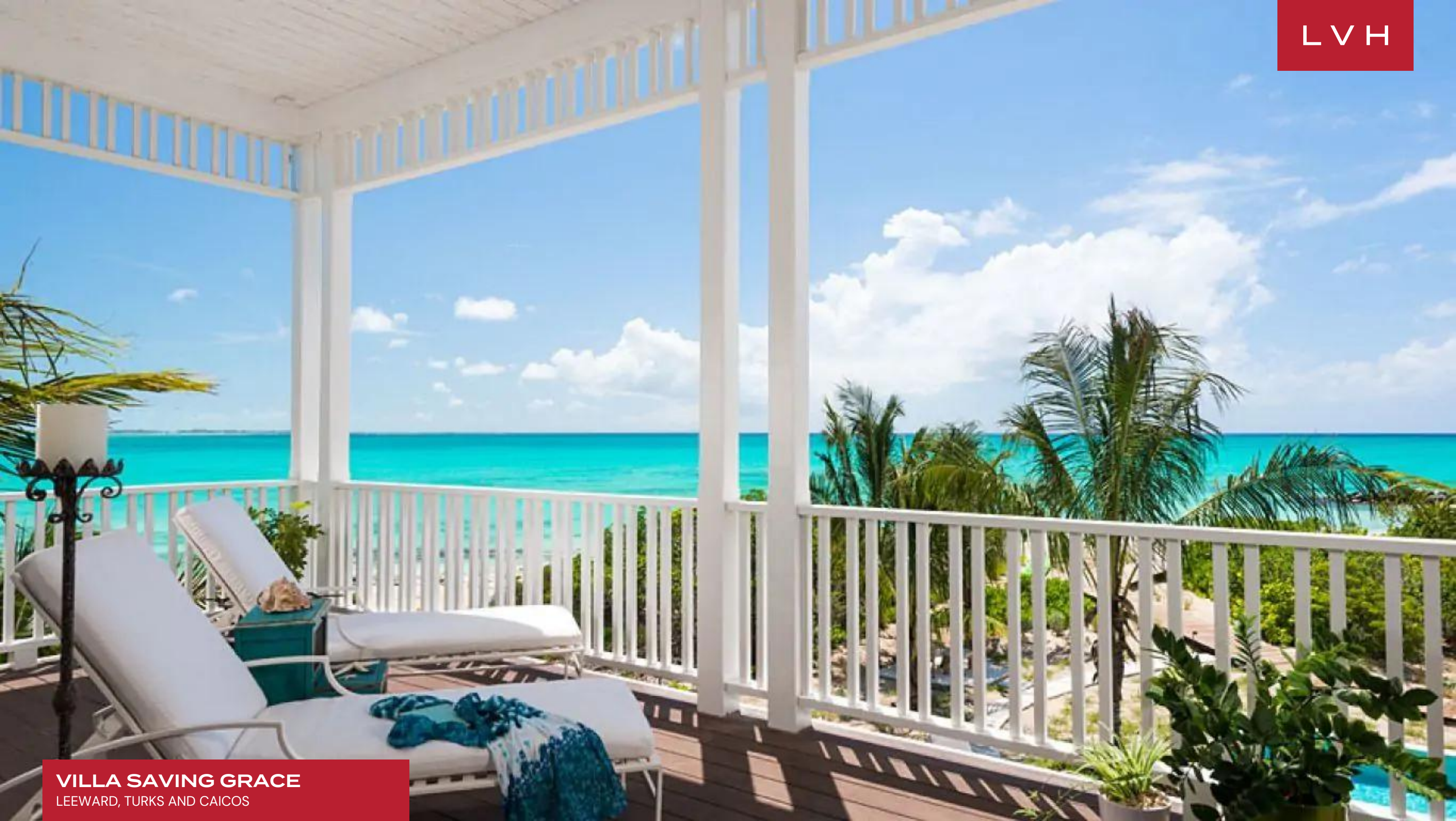
VILLA SAVING GRACE LEEWARD, TURKS AND CAICOS