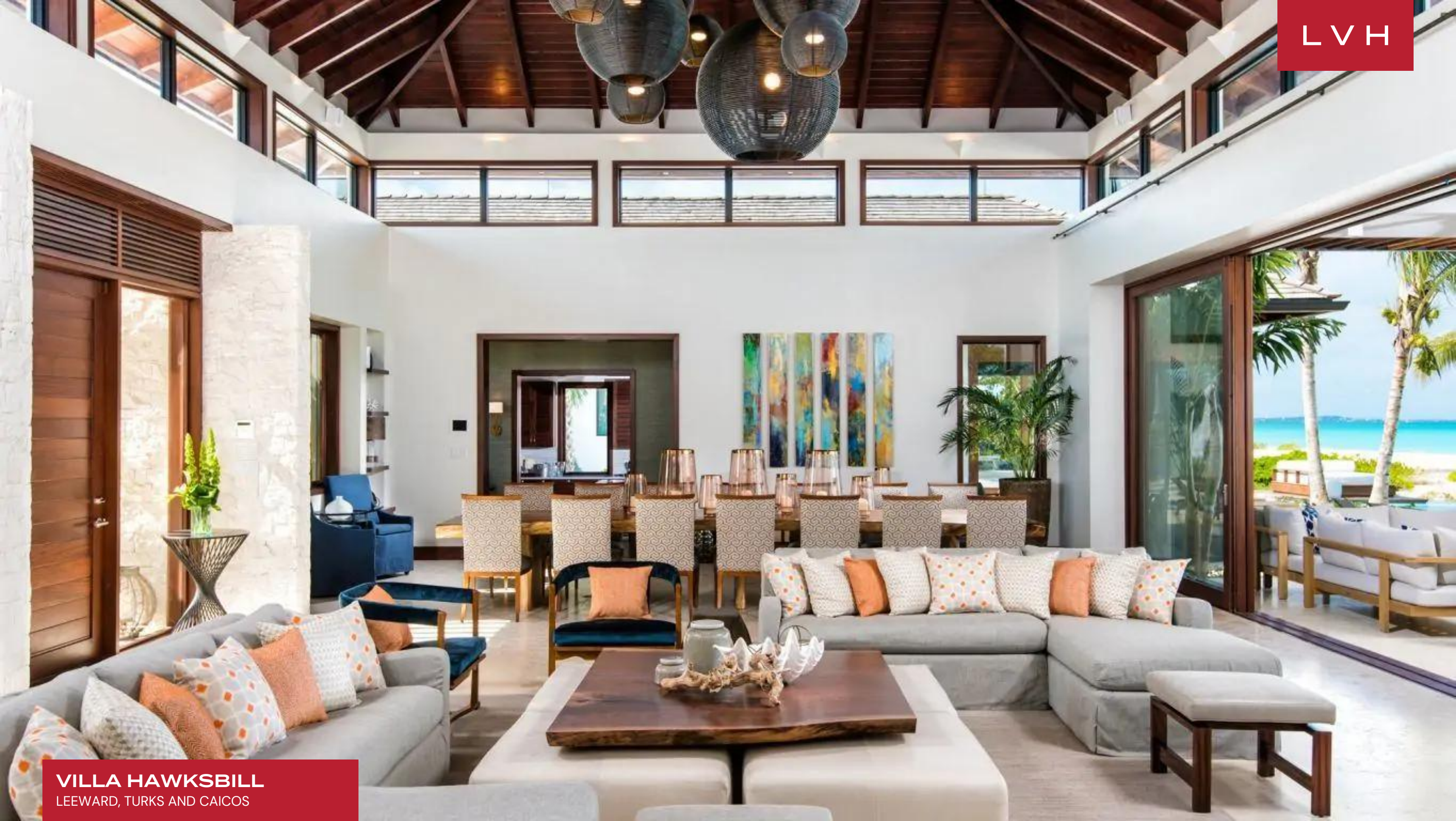
VILLA HAWKSBILL LEEWARD, TURKS AND CAICOS