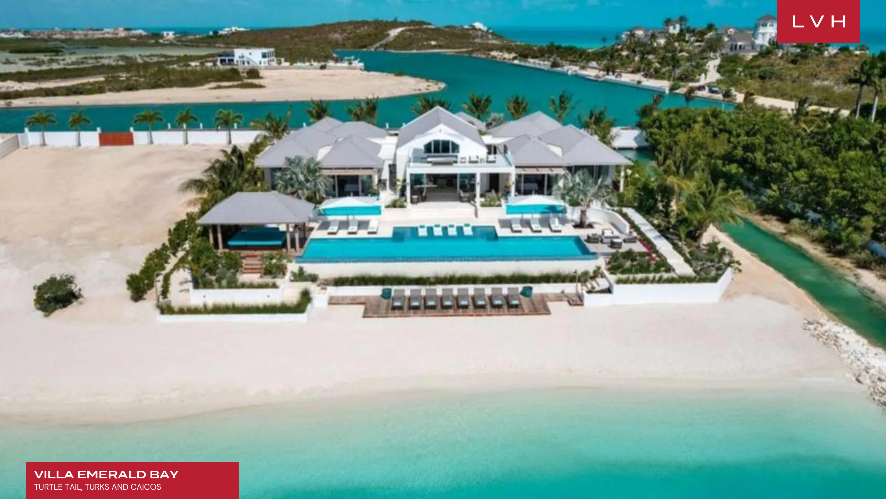
VILLA EMERALD BAY TURTLE TAIL, TURKS AND CAICOS