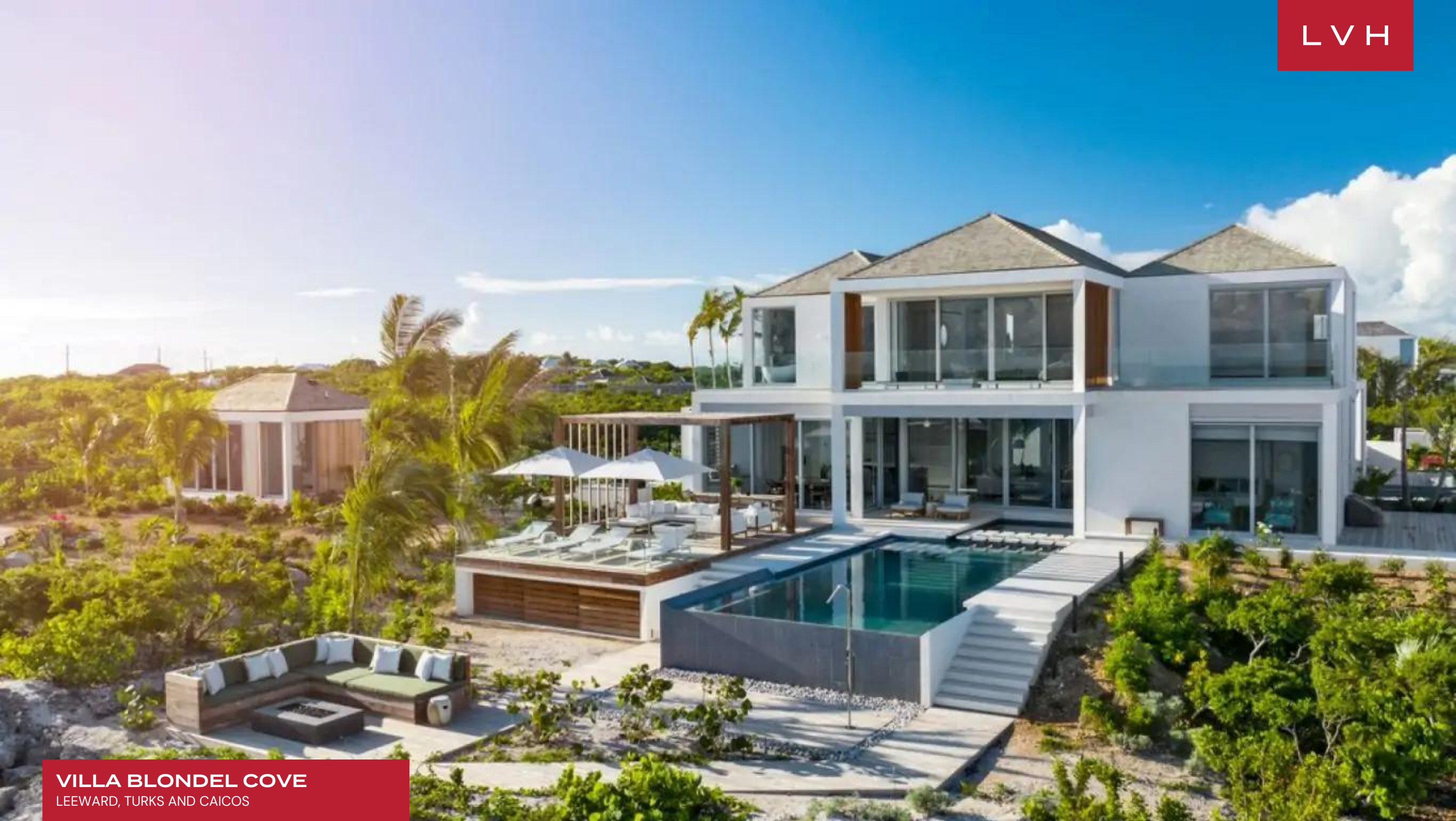
VILLA BLONDEL COVE LEEWARD, TURKS AND CAICOS