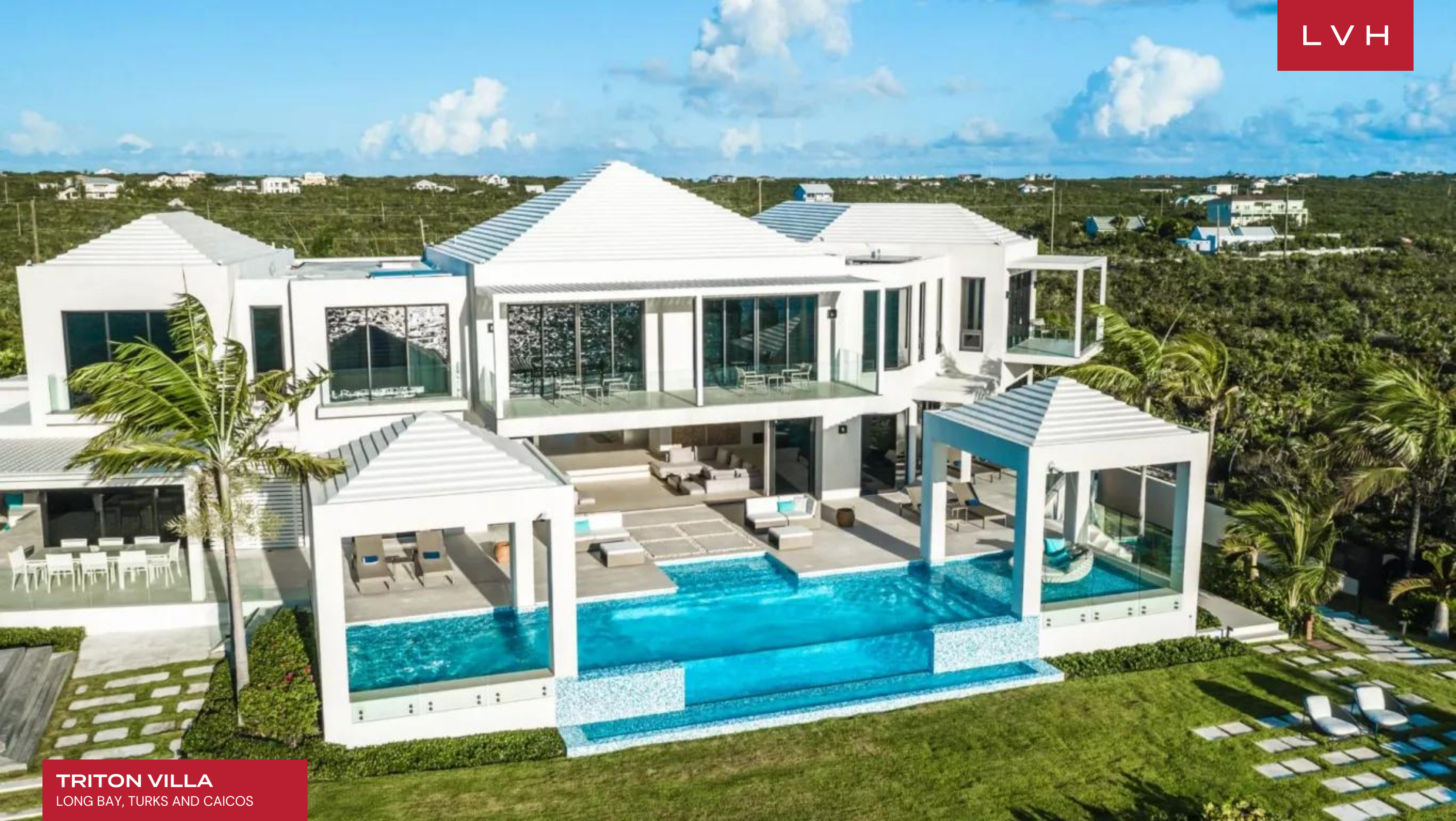
TRITON VILLA LONG BAY, TURKS AND CAICOS