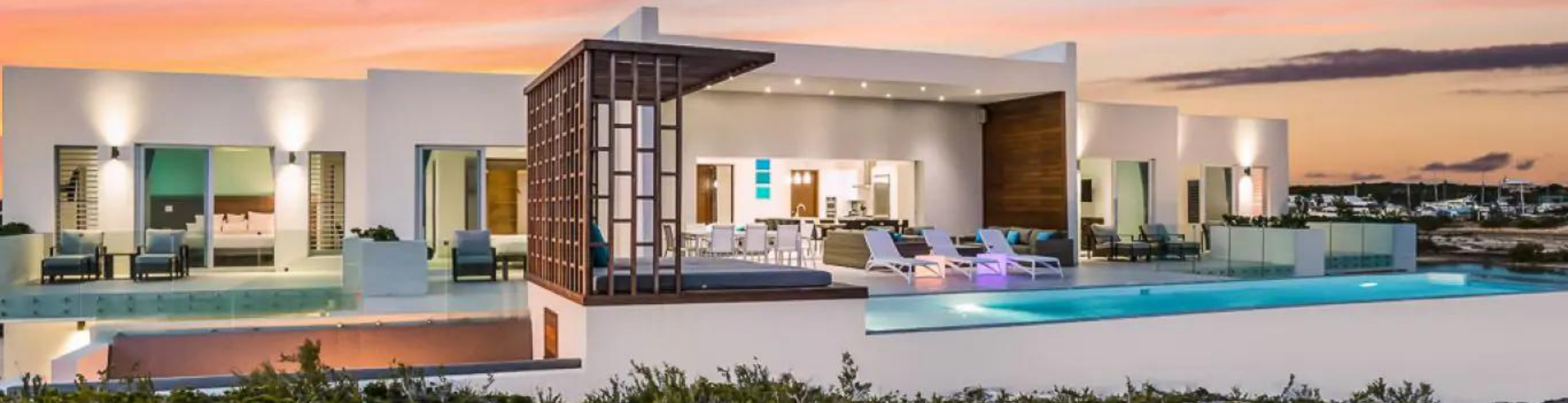
TIP OF THE TAIL VILLA TURTLE TAIL, TURKS AND CAICOS