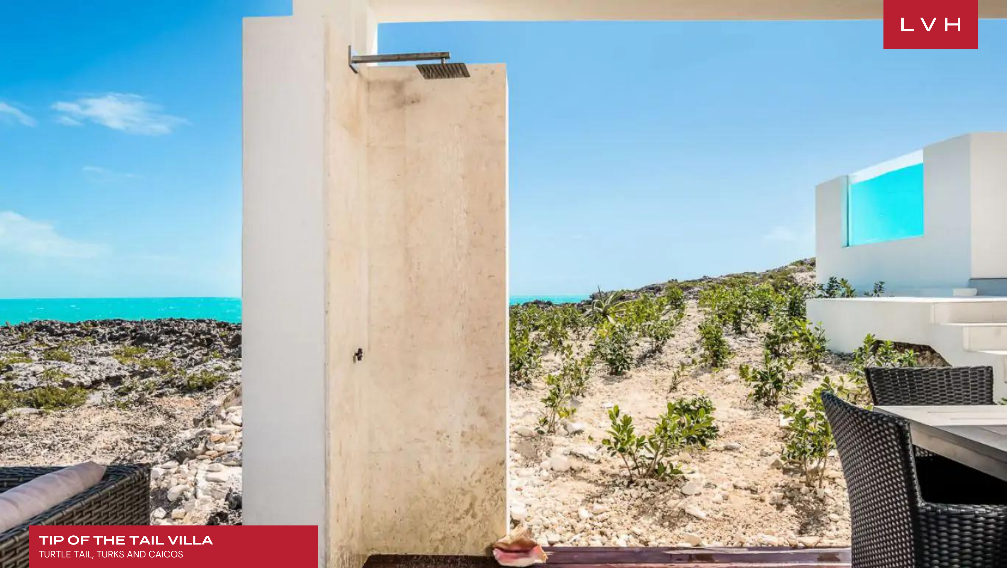
TIP OF THE TAIL VILLA TURTLE TAIL, TURKS AND CAICOS