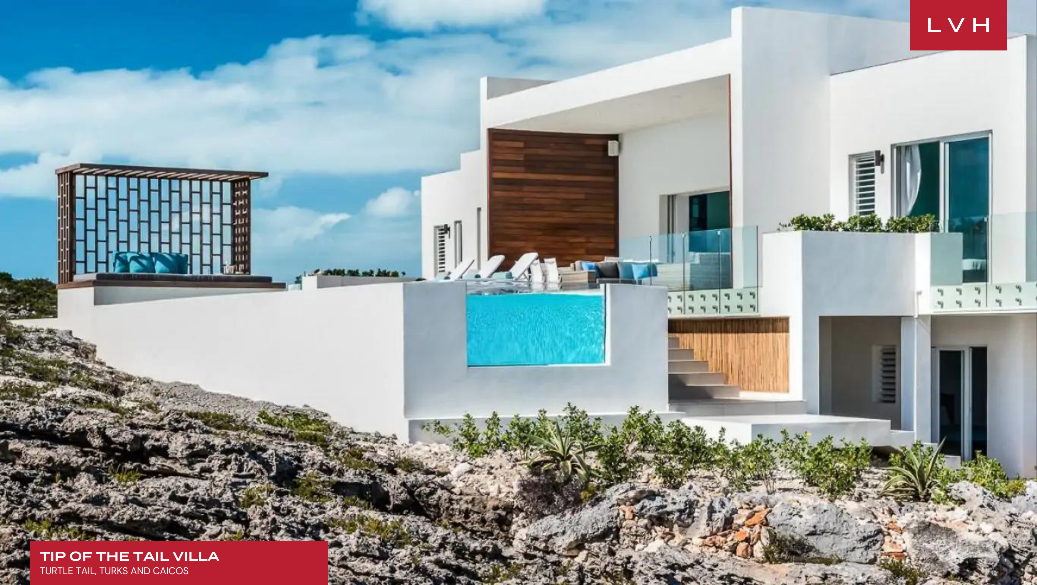
TIP OF THE TAIL VILLA TURTLE TAIL, TURKS AND CAICOS