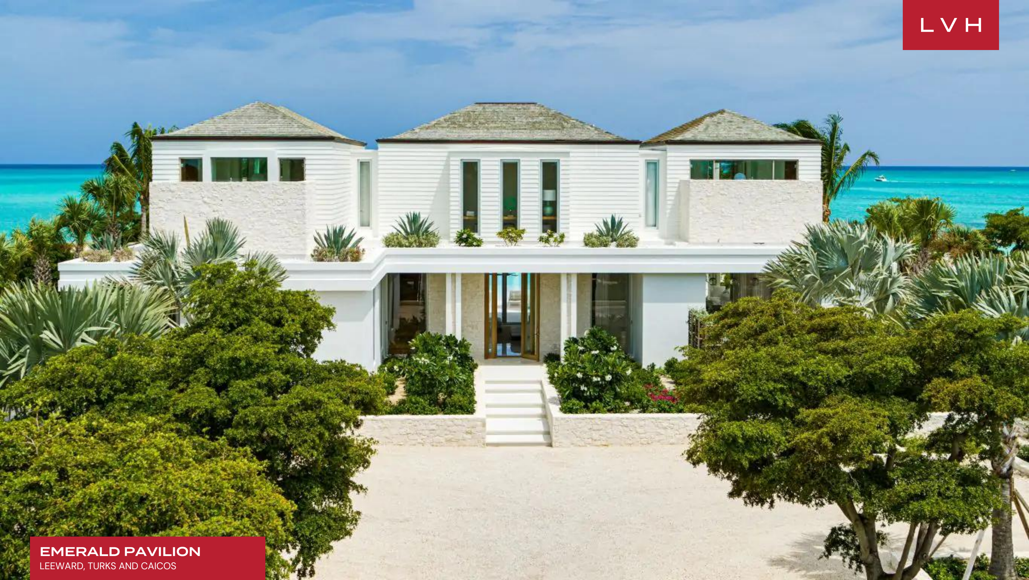
EMERALD PAVILION LEEWARD, TURKS AND CAICOS