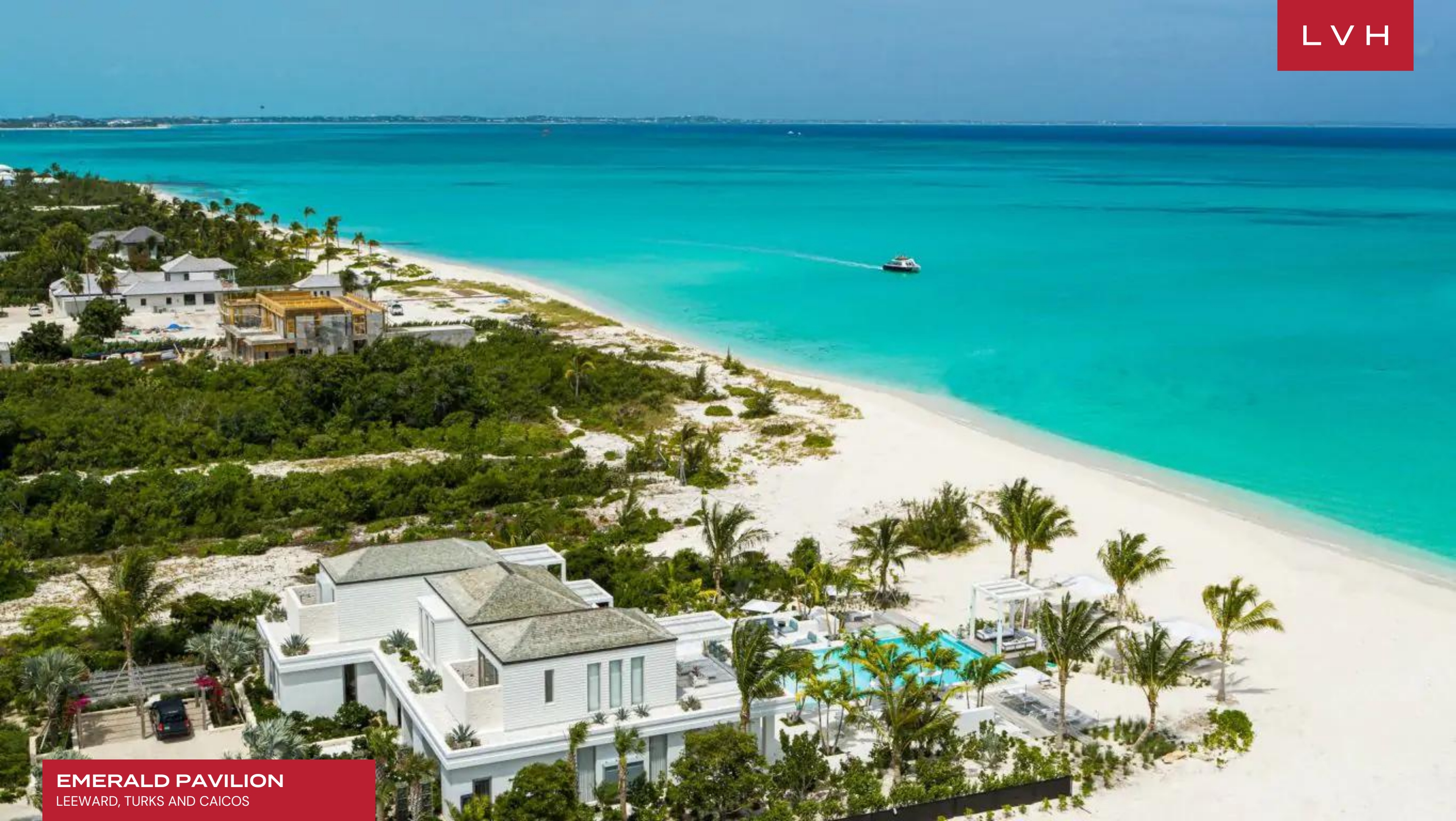
EMERALD PAVILION LEEWARD, TURKS AND CAICOS