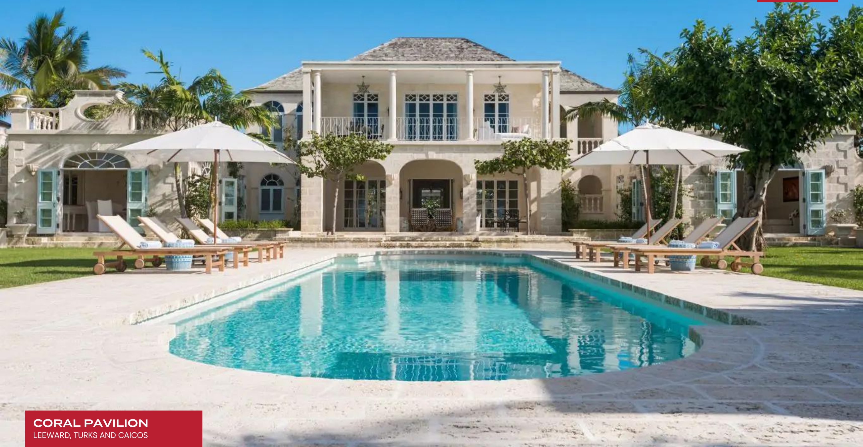
CORAL PAVILION LEEWARD, TURKS AND CAICOS