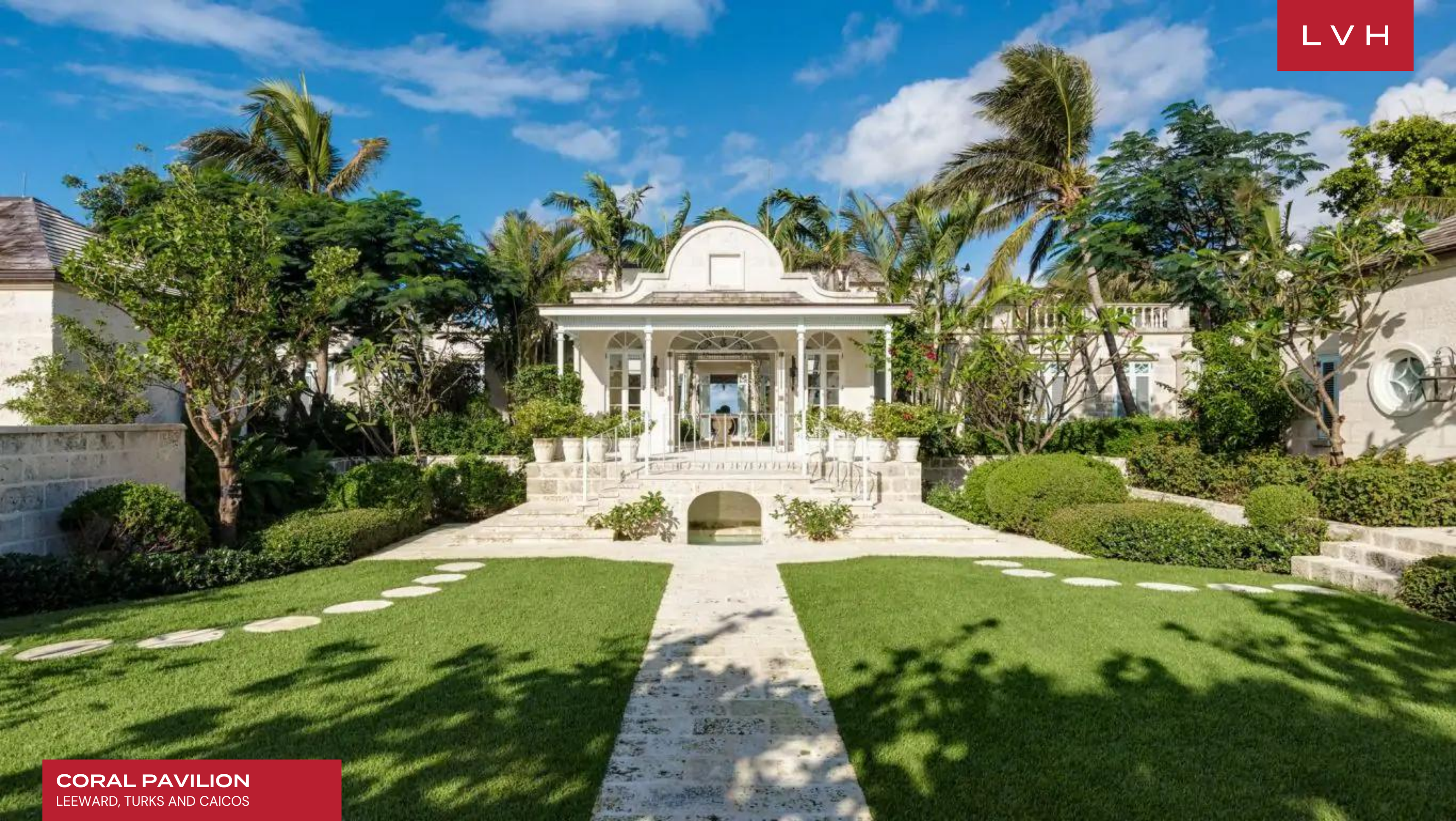
CORAL PAVILION LEEWARD, TURKS AND CAICOS