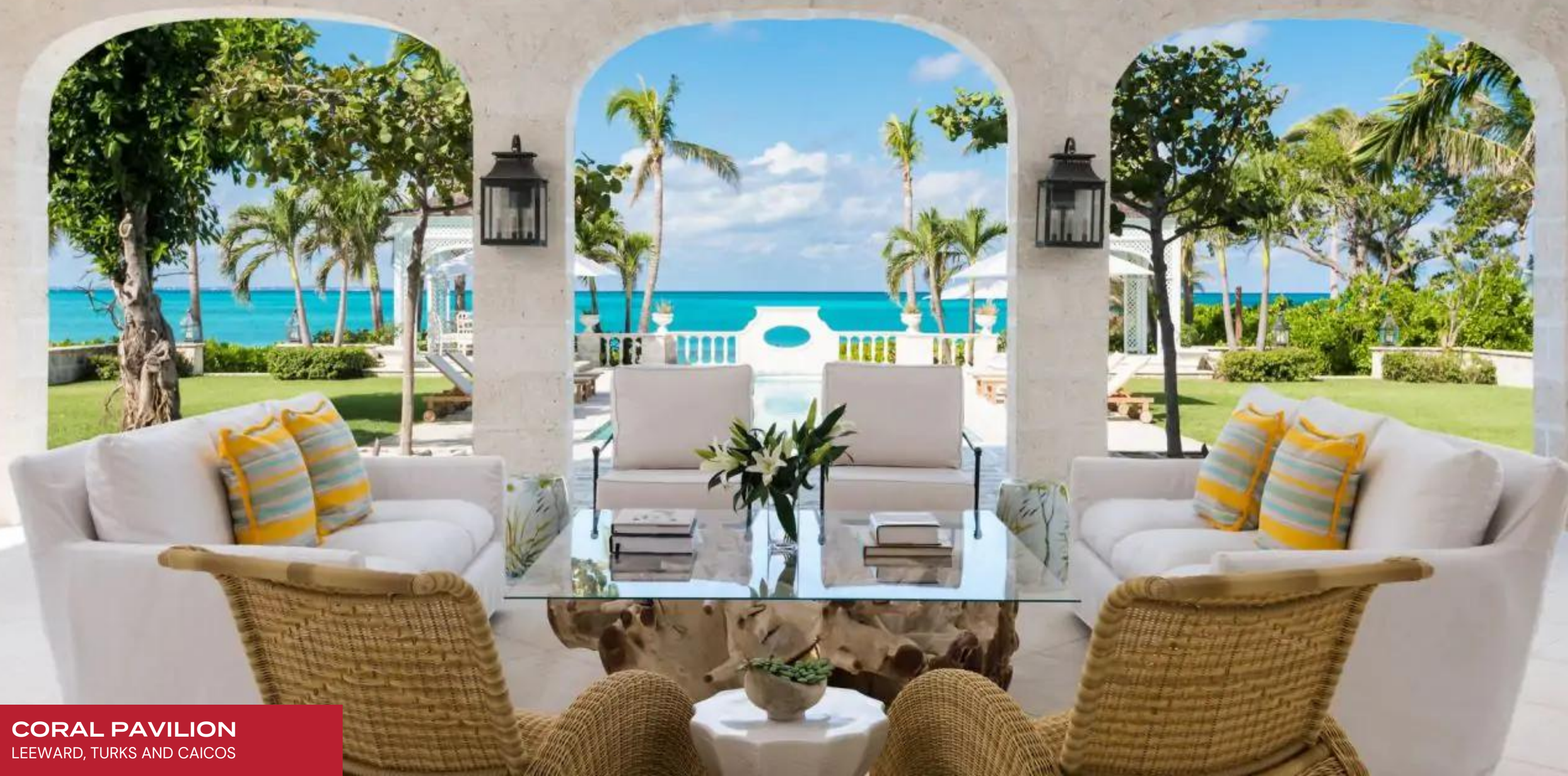
CORAL PAVILION LEEWARD, TURKS AND CAICOS