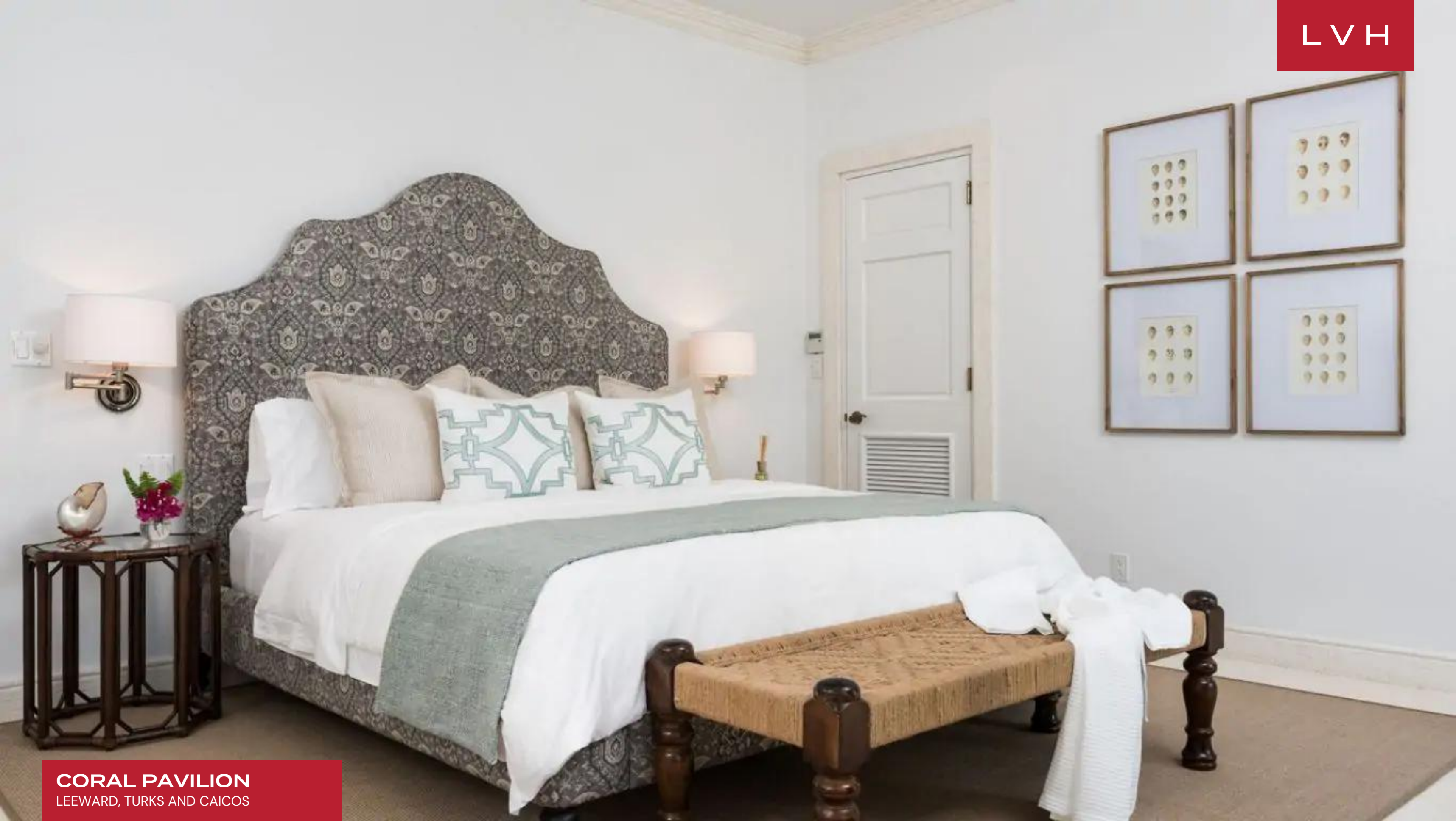
CORAL PAVILION LEEWARD, TURKS AND CAICOS