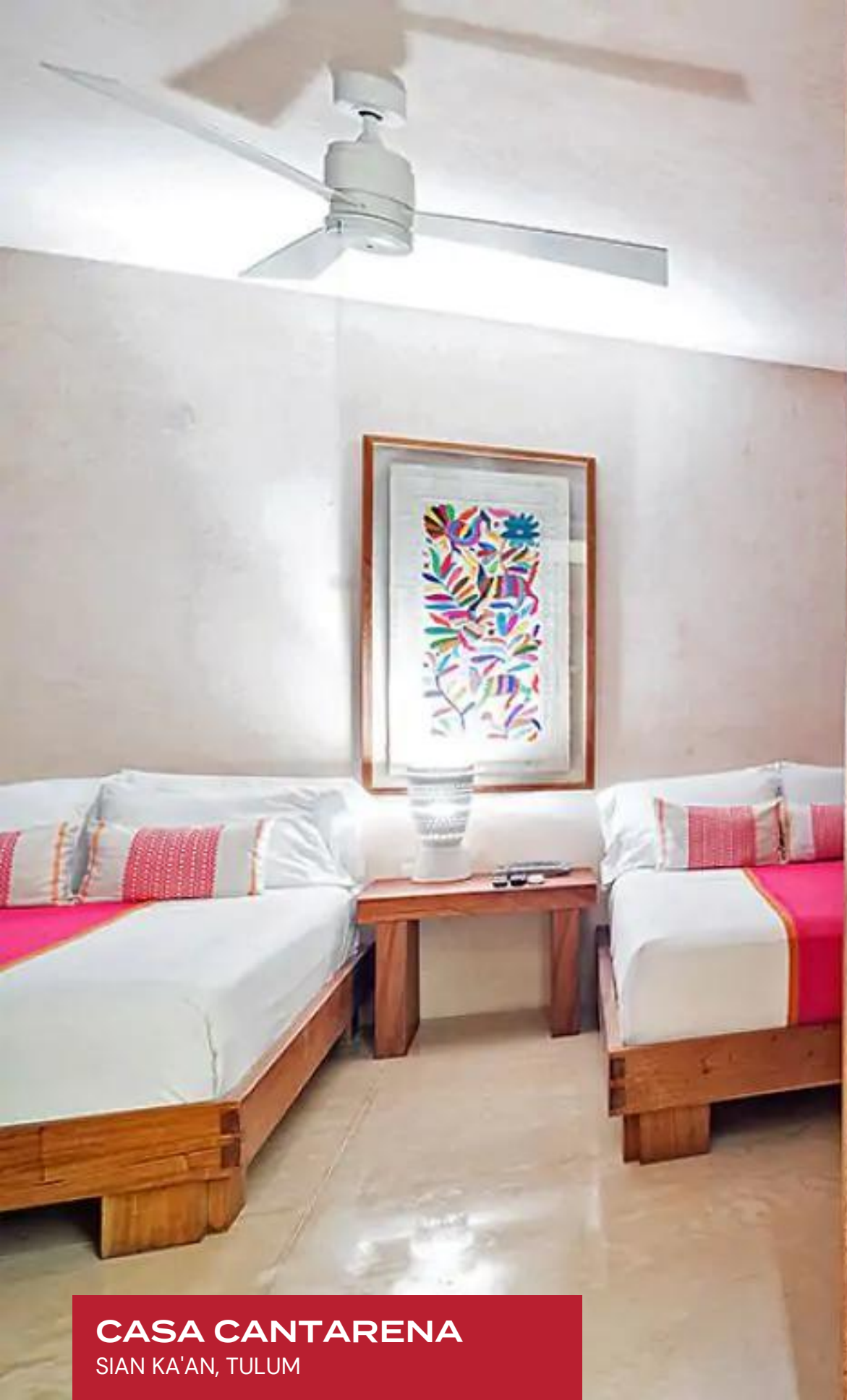
CASA CANTARENA SIAN KA'AN, TULUM