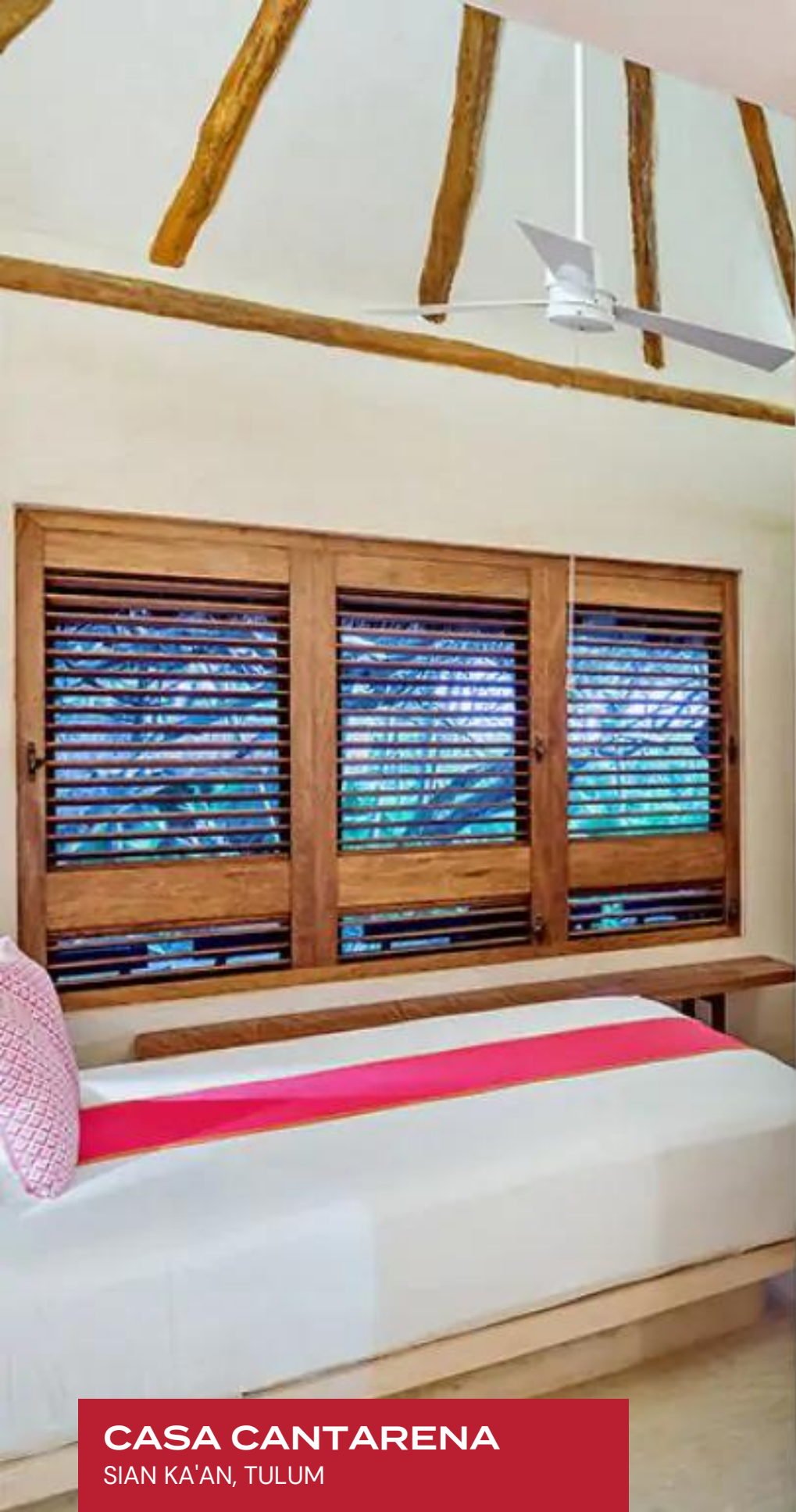
CASA CANTARENA SIAN KA'AN, TULUM