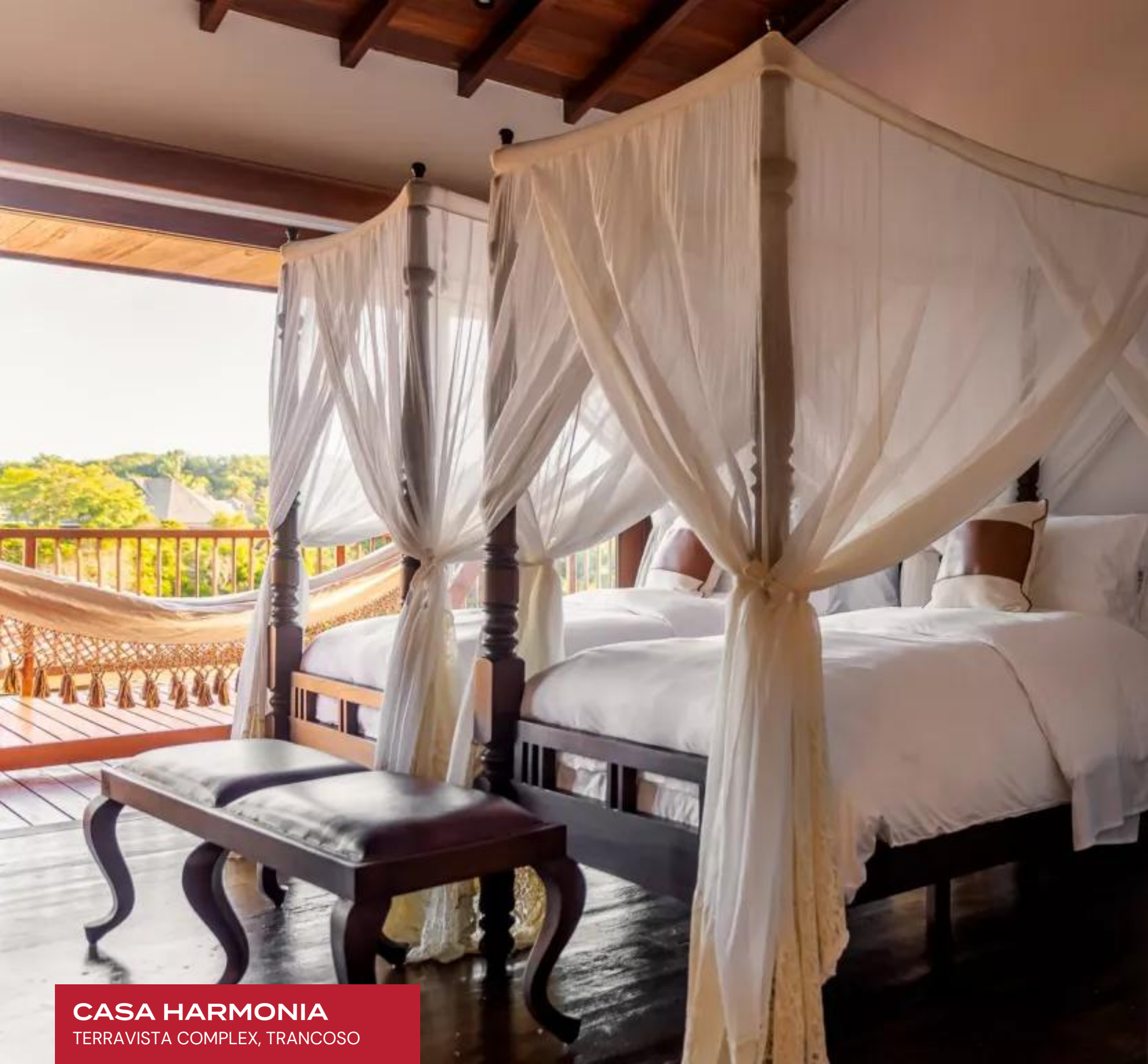
CASA HARMONIA TERRAVISTA COMPLEX, TRANCOSO