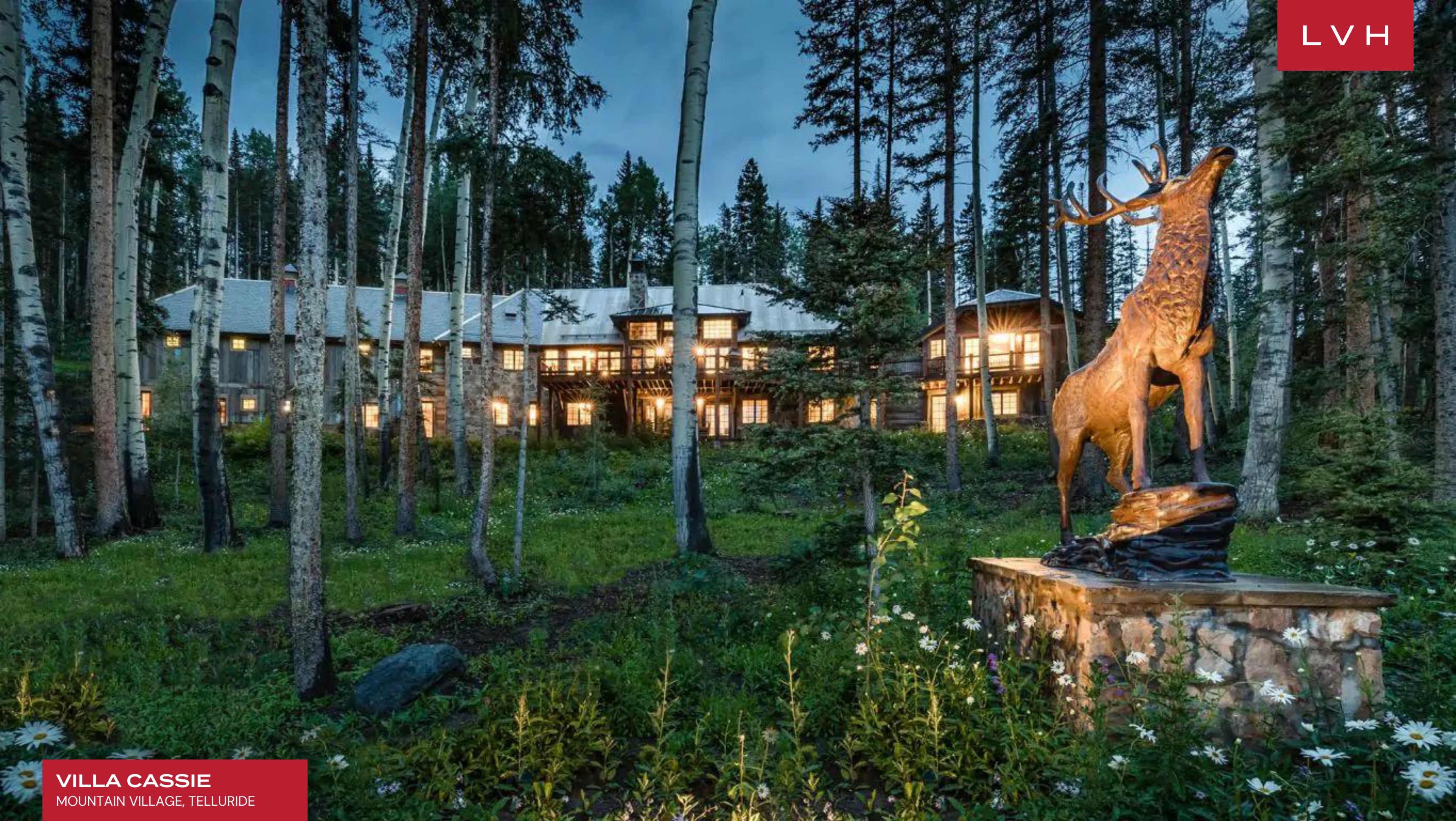
VILLA CASSIE MOUNTAIN VILLAGE, TELLURIDE