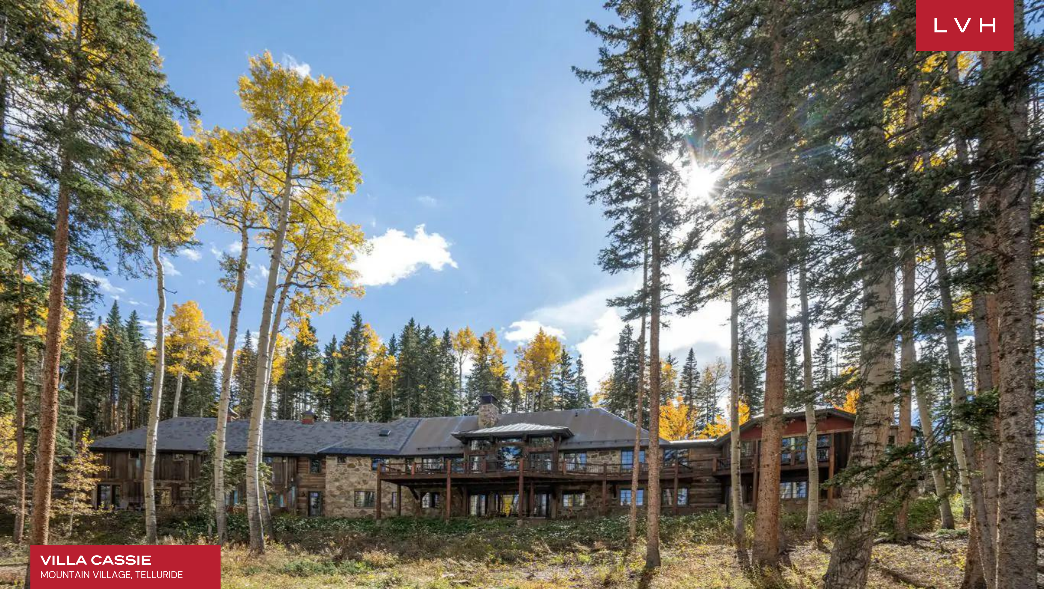
VILLA CASSIE MOUNTAIN VILLAGE, TELLURIDE