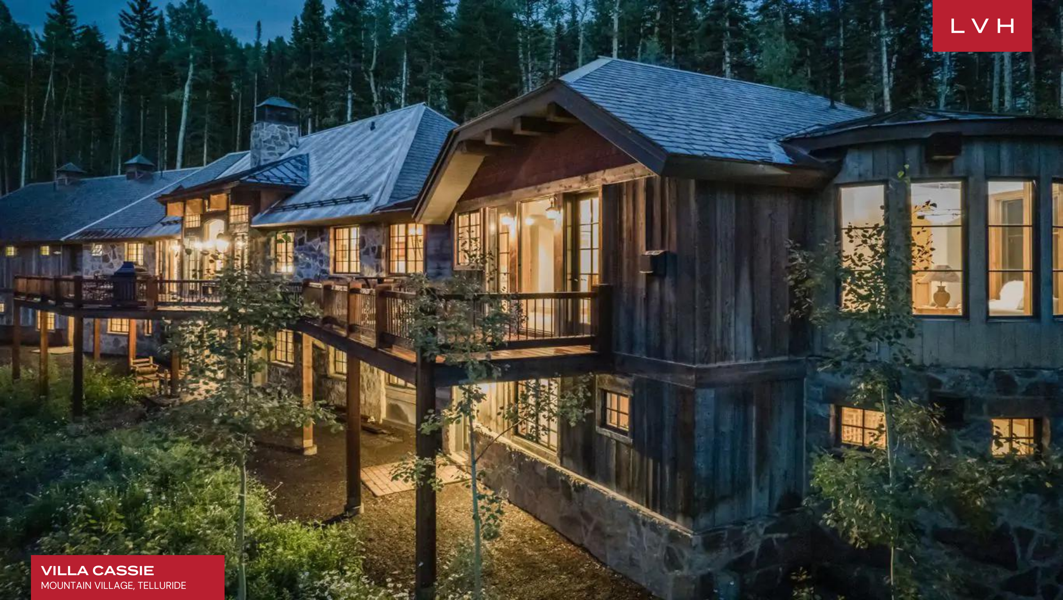
VILLA CASSIE MOUNTAIN VILLAGE, TELLURIDE