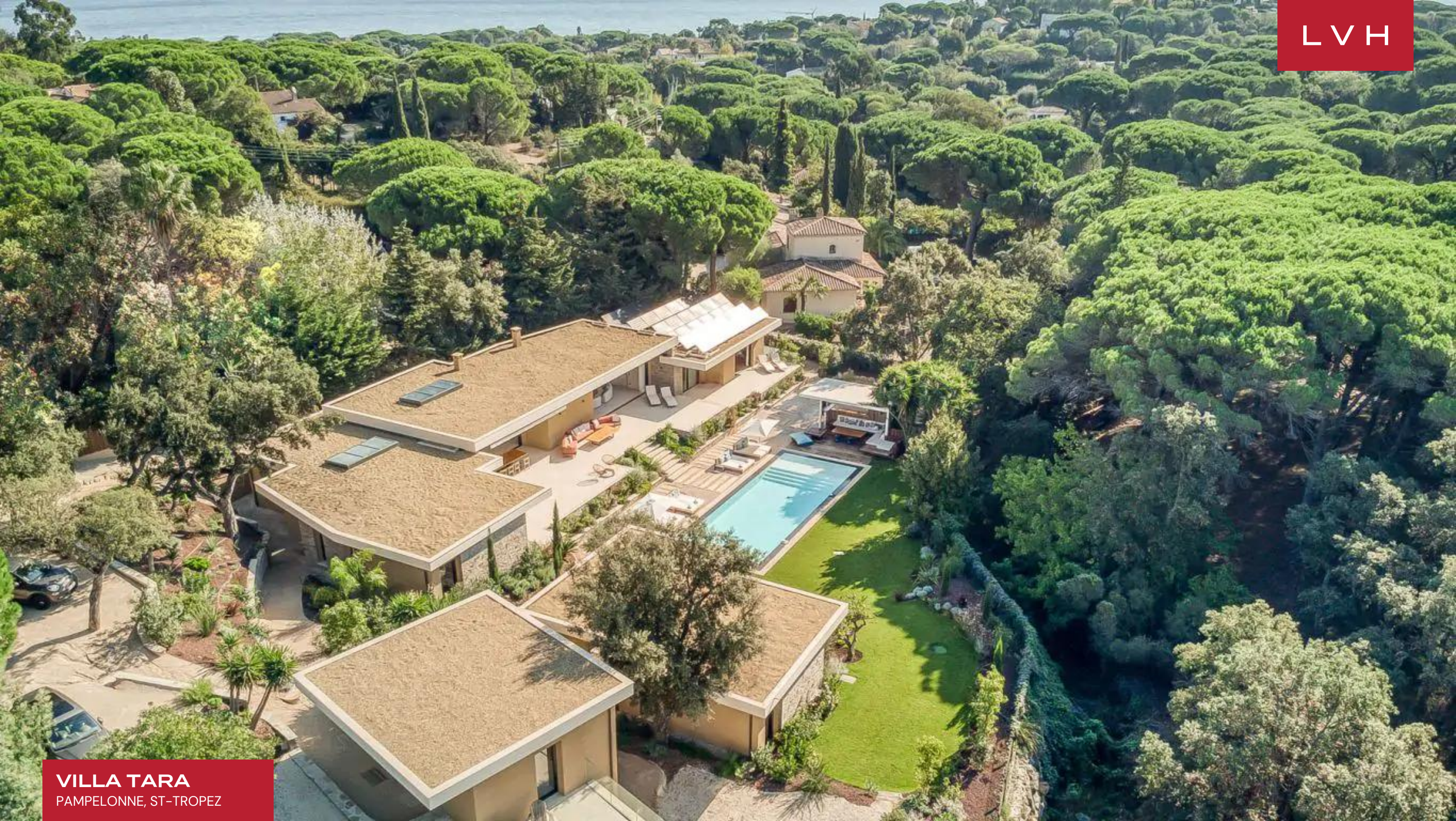
VILLA TARA PAMPOLONNE, ST-TROPEZ