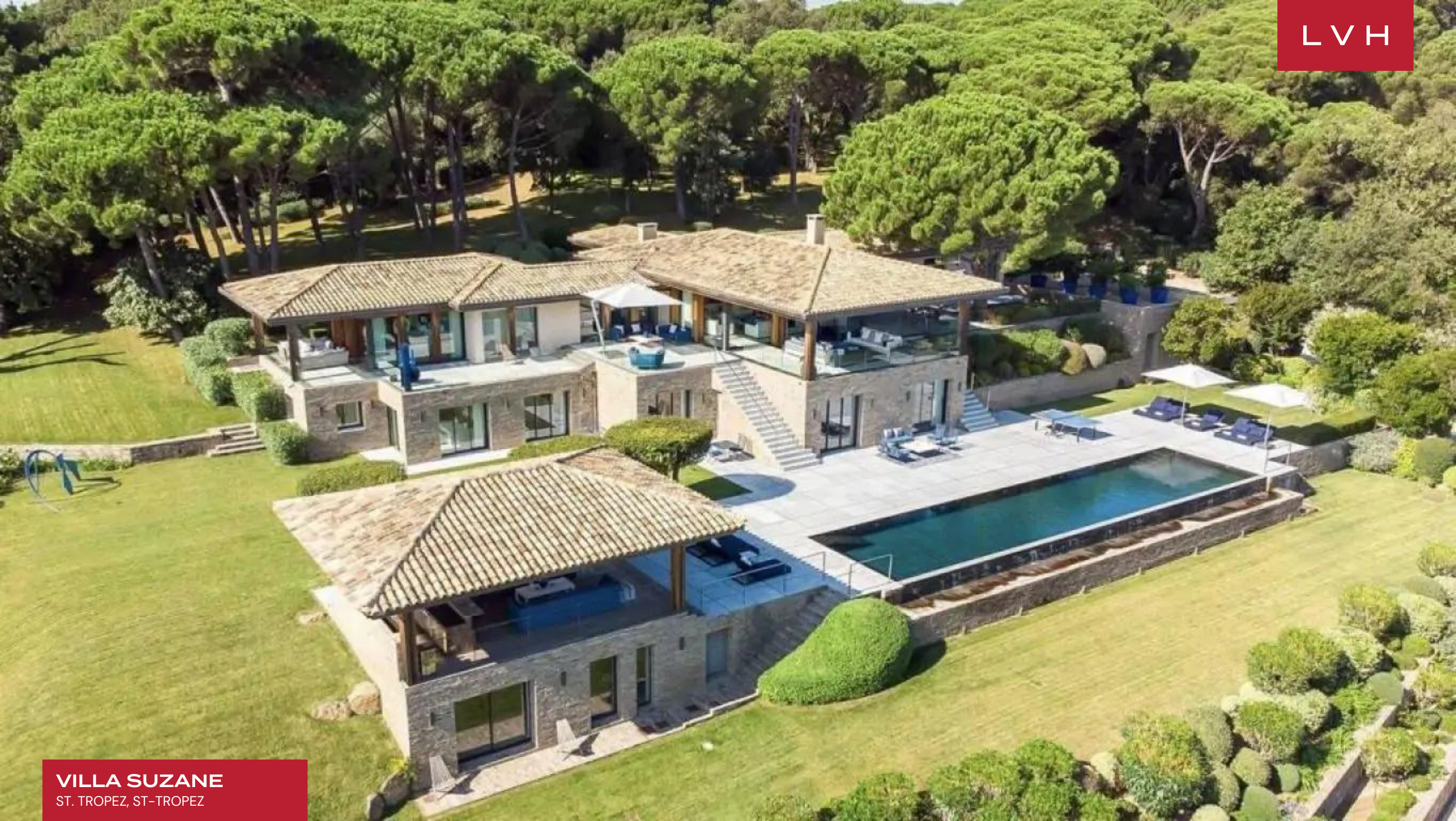
VILLA SUZANE ST. TROPEZ, ST-TROPEZ