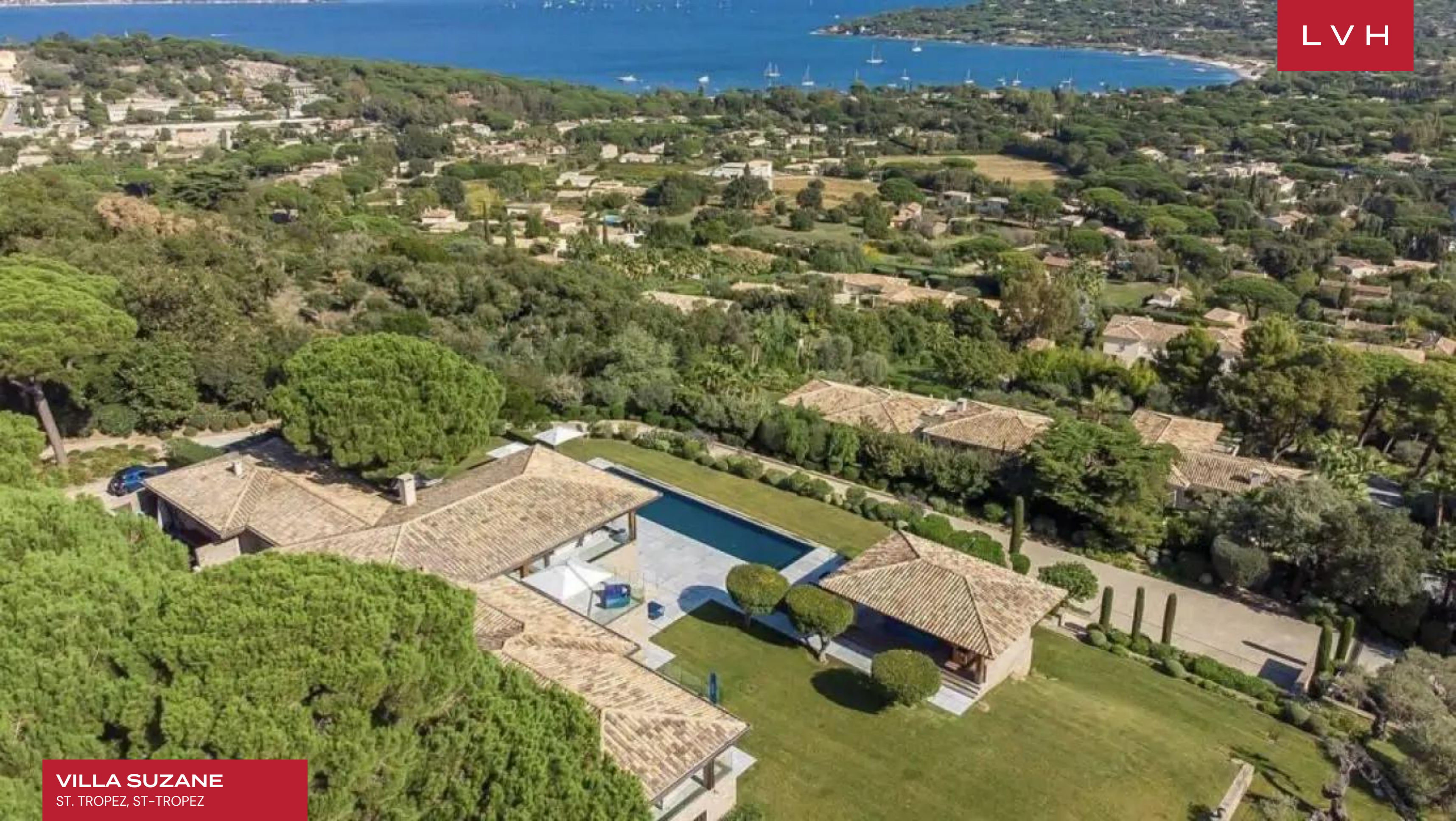
VILLA SUZANE ST. TROPEZ, ST-TROPEZ