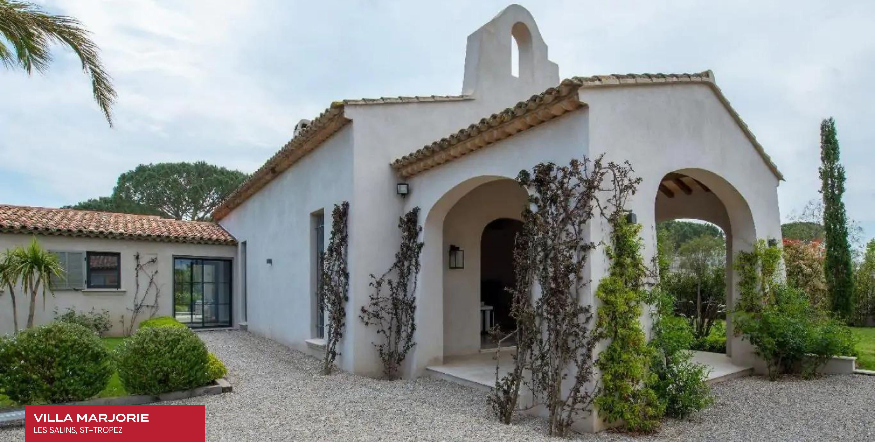
VILLA MARJORIE LES SALINS, ST-TROPEZ