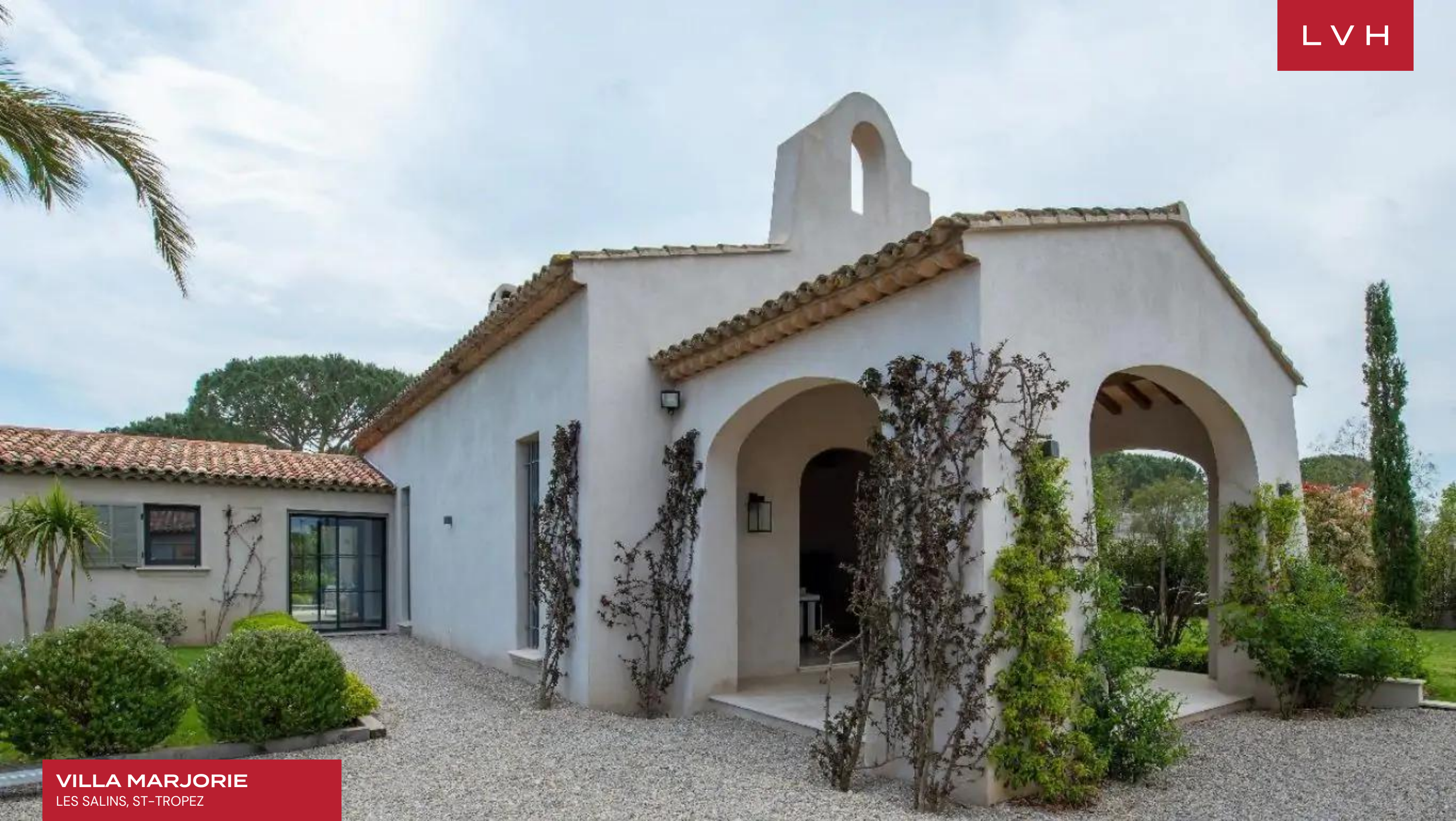
VILLA MARJORIE LES SALINS, ST-TROPEZ