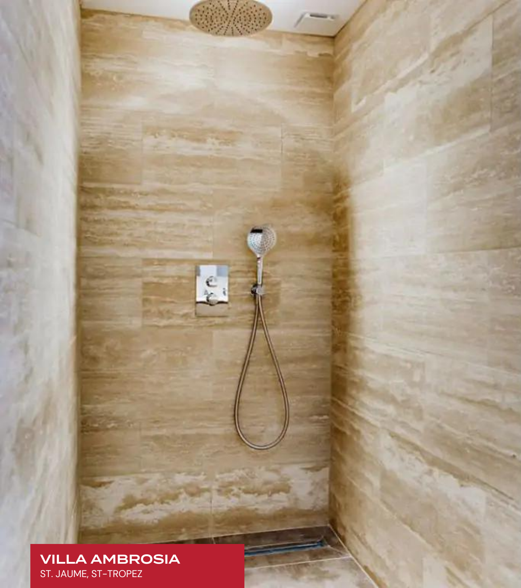
VILLA AMBROSIA ST. JAUME, ST-TROPEZ