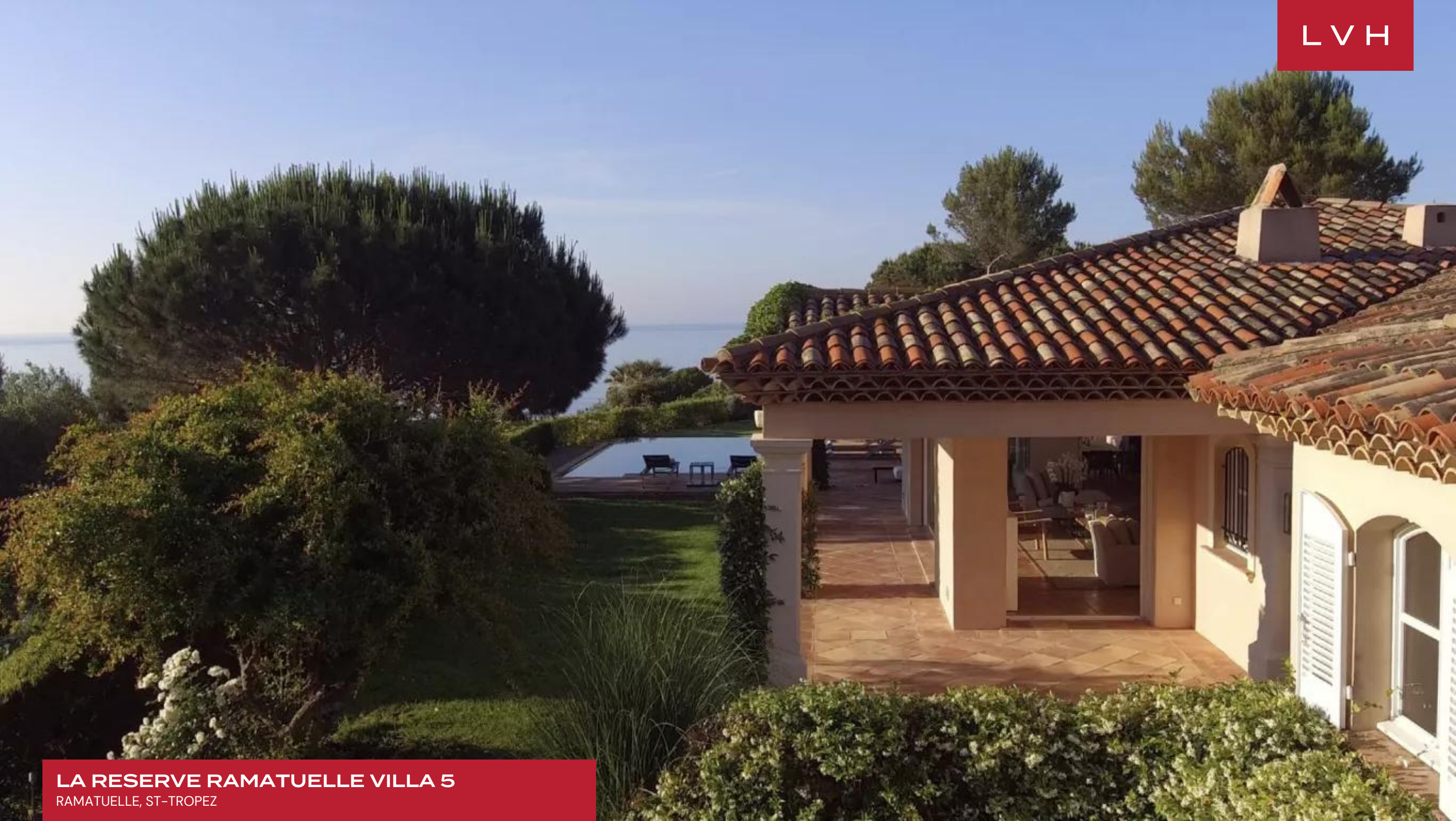
LA RESERVE RAMATUELLE VILLA 5 RAMATUELLE, ST-TROPEZ