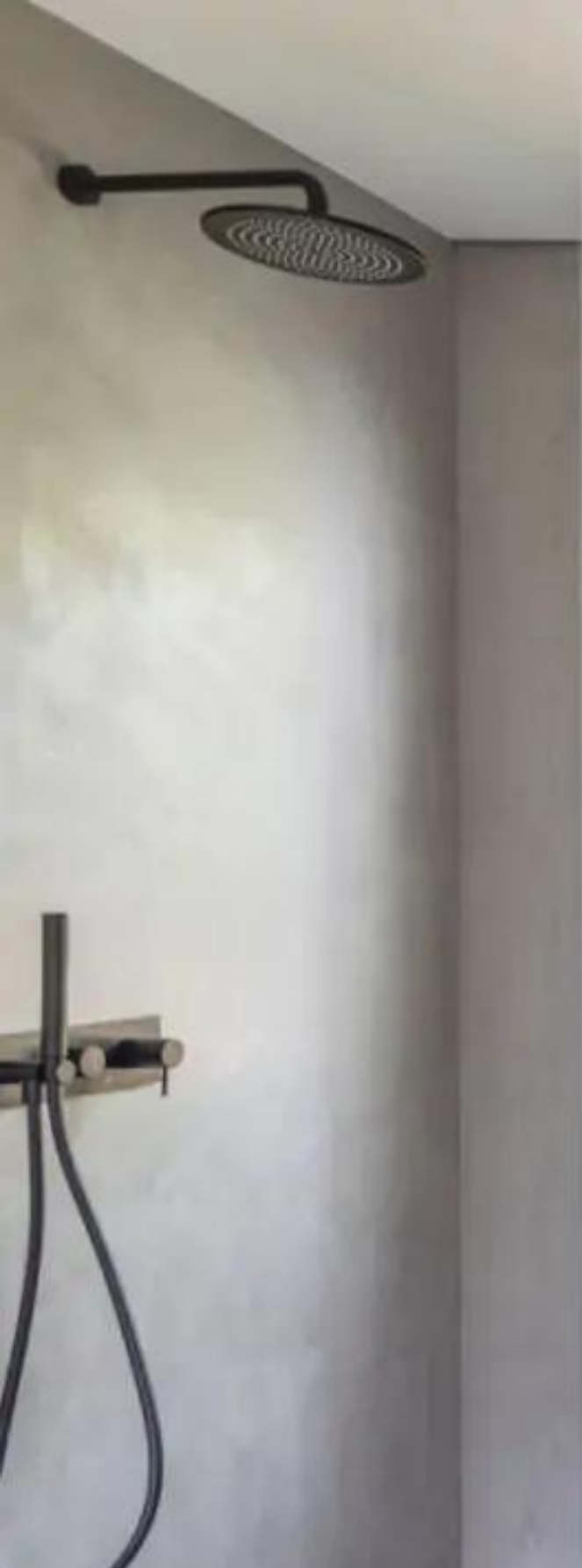
VILLA TAINOS POINTE MILOU, ST. BARTH