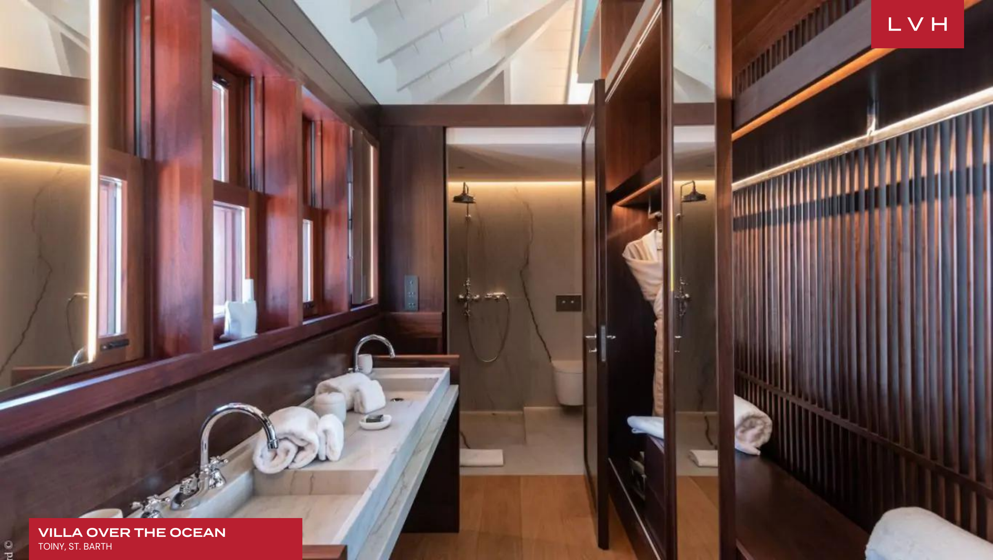
VILLA OVER THE OCEAN TOINY, ST. BARTH