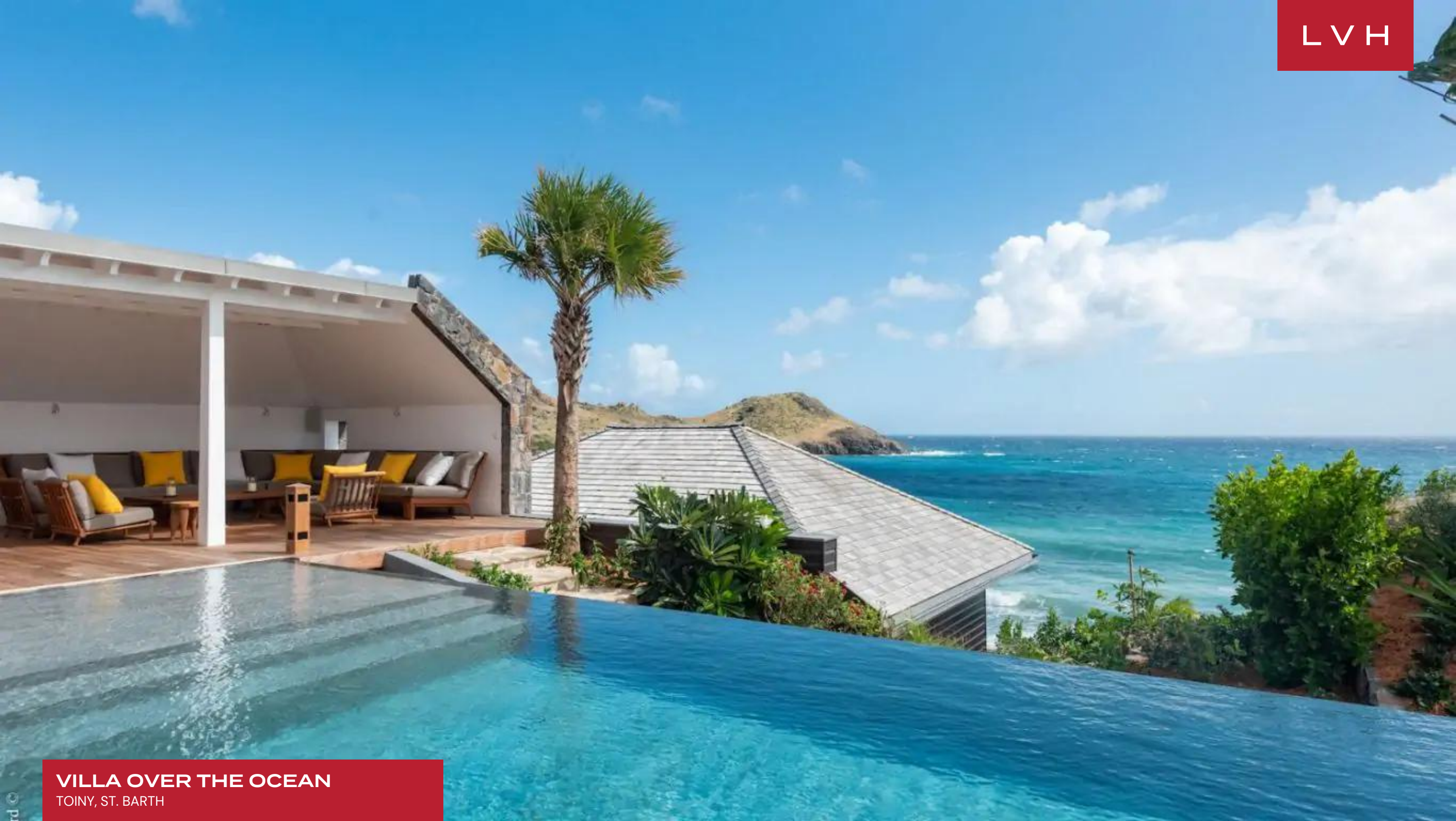
VILLA OVER THE OCEAN TOINY, ST. BARTH