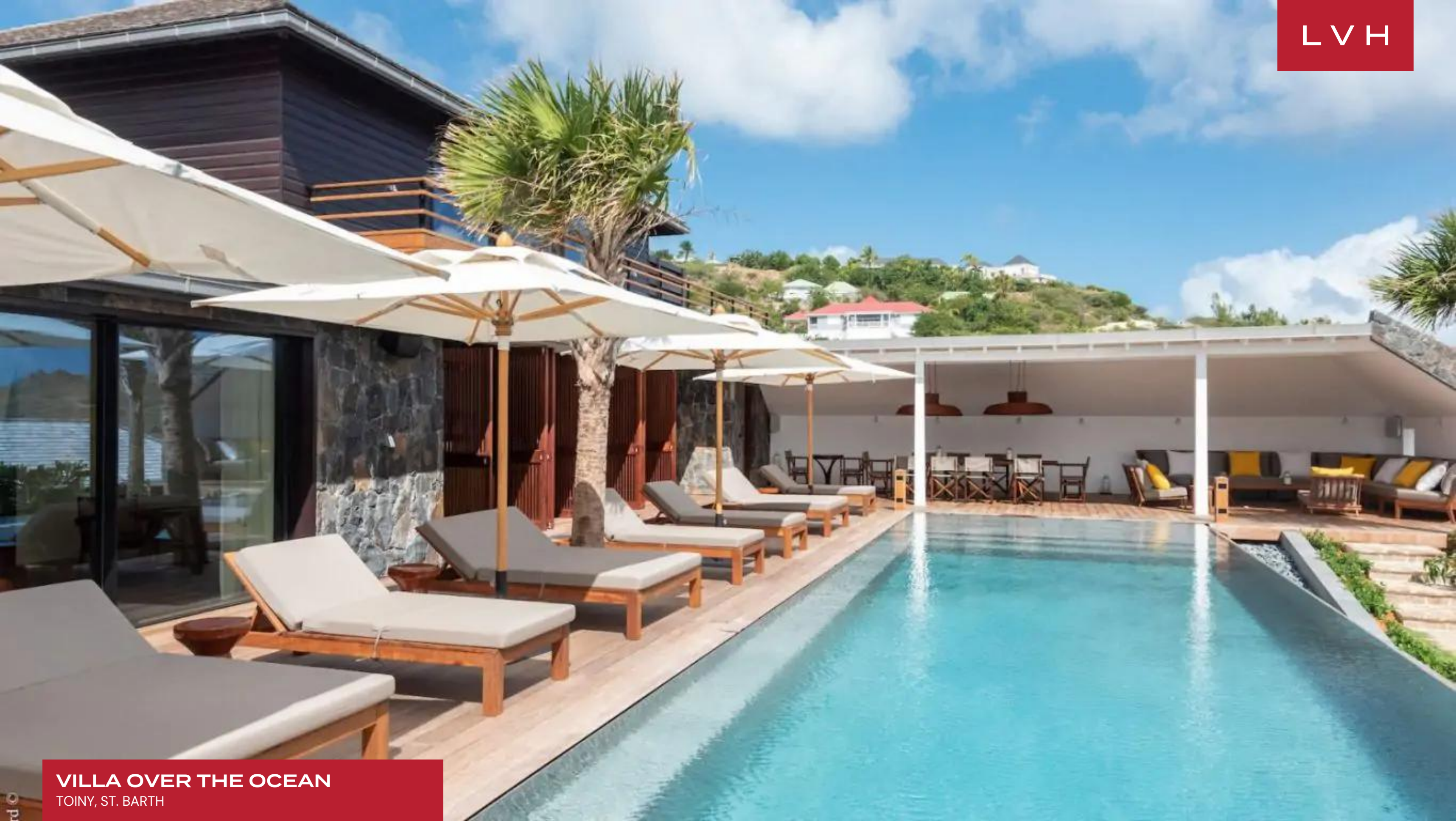
VILLA OVER THE OCEAN TOINY, ST. BARTH