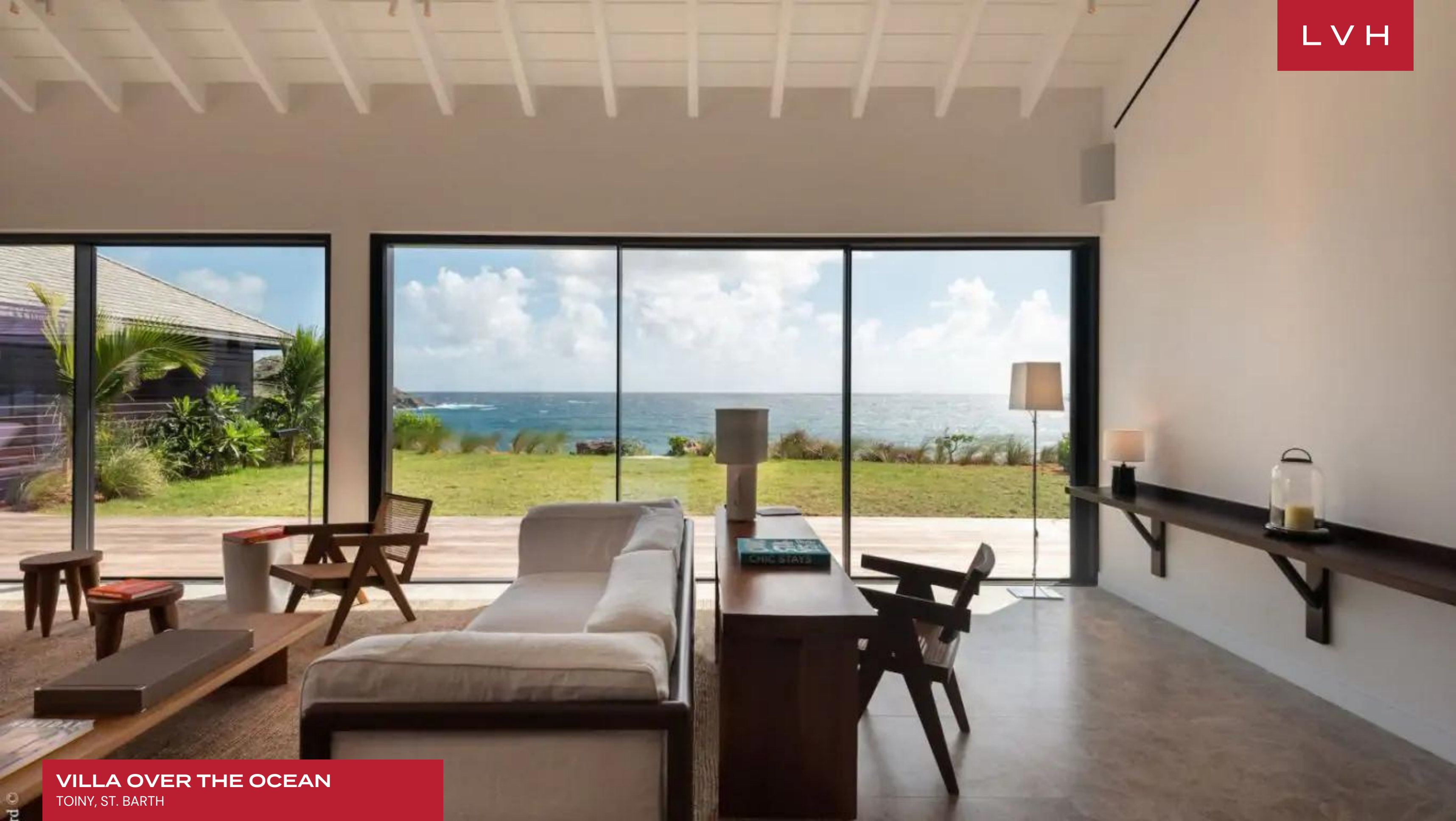
VILLA OVER THE OCEAN TOINY, ST. BARTH