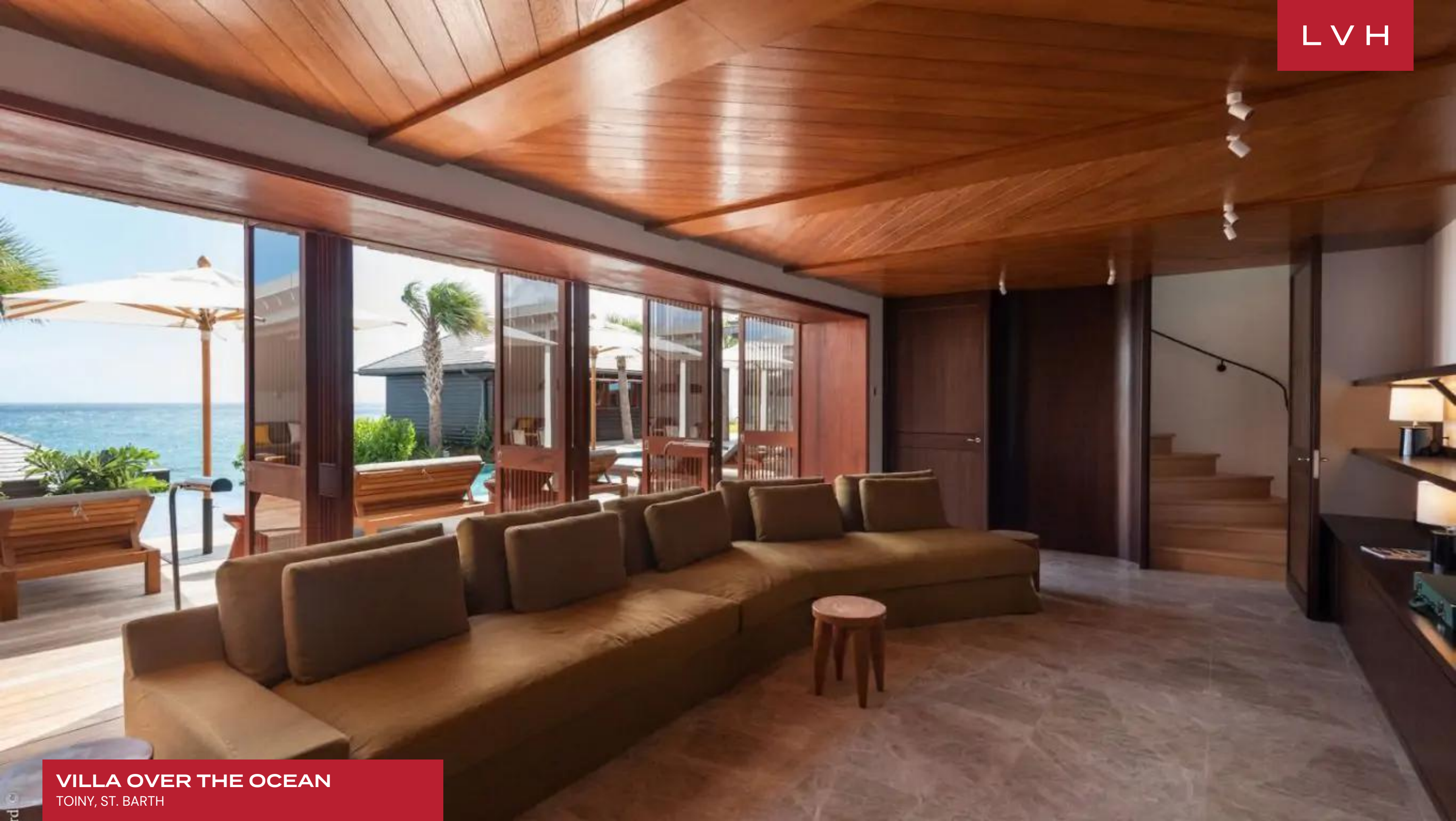
VILLA OVER THE OCEAN TOINY, ST. BARTH