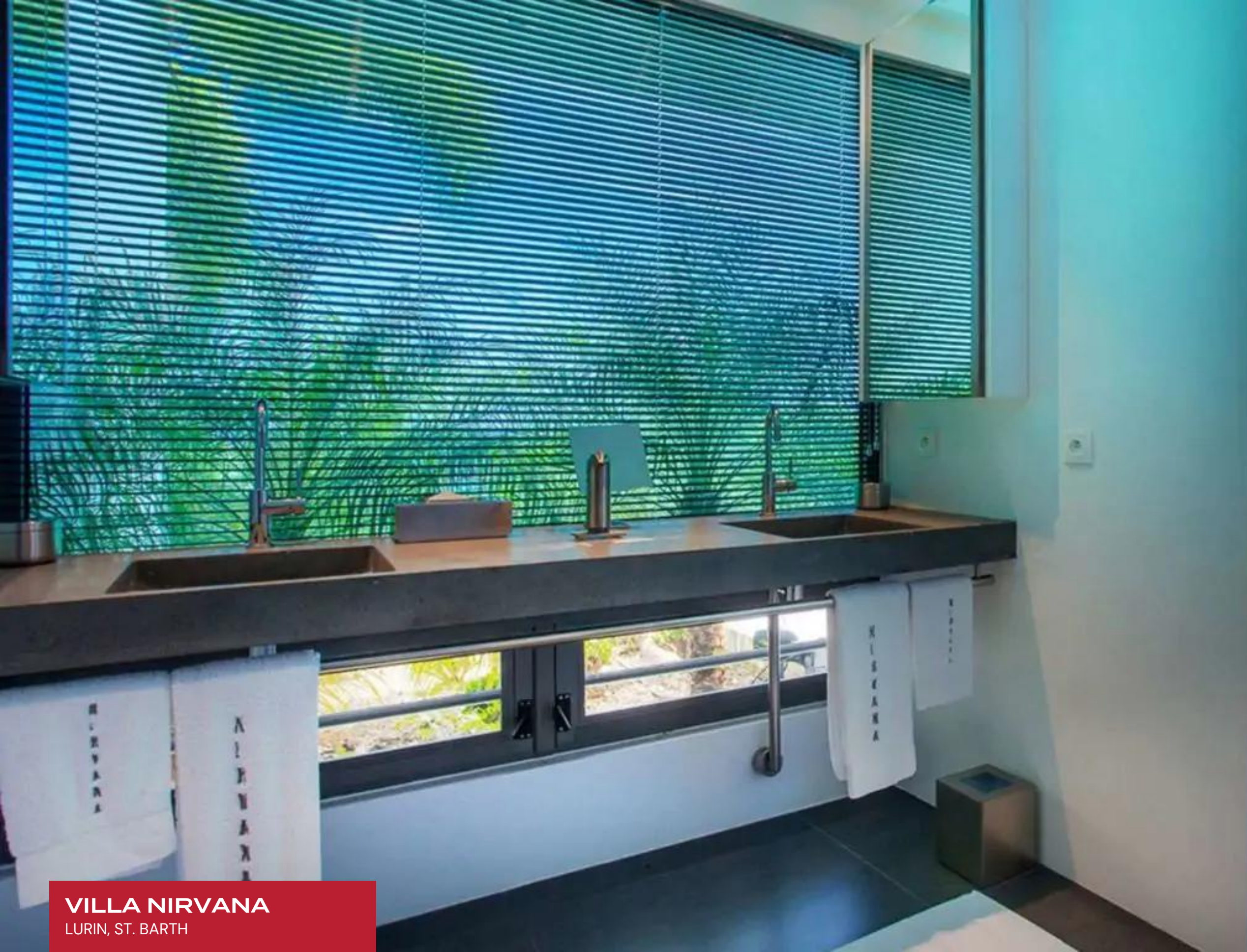
VILLA NIRVANA LURIN, ST. BARTH