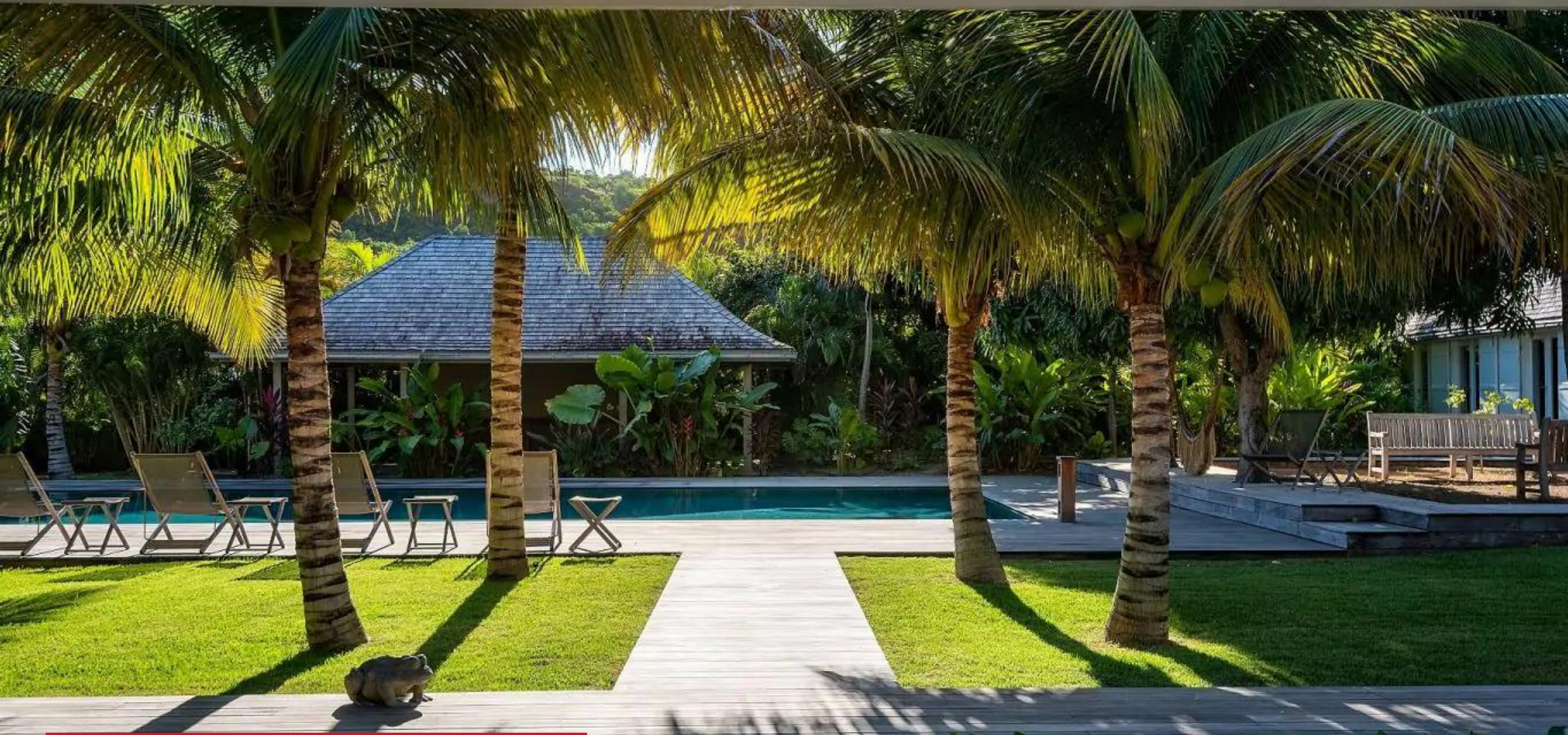
VILLA LE MANOIR DE LORIENT L'ORIENT, ST. BARTH