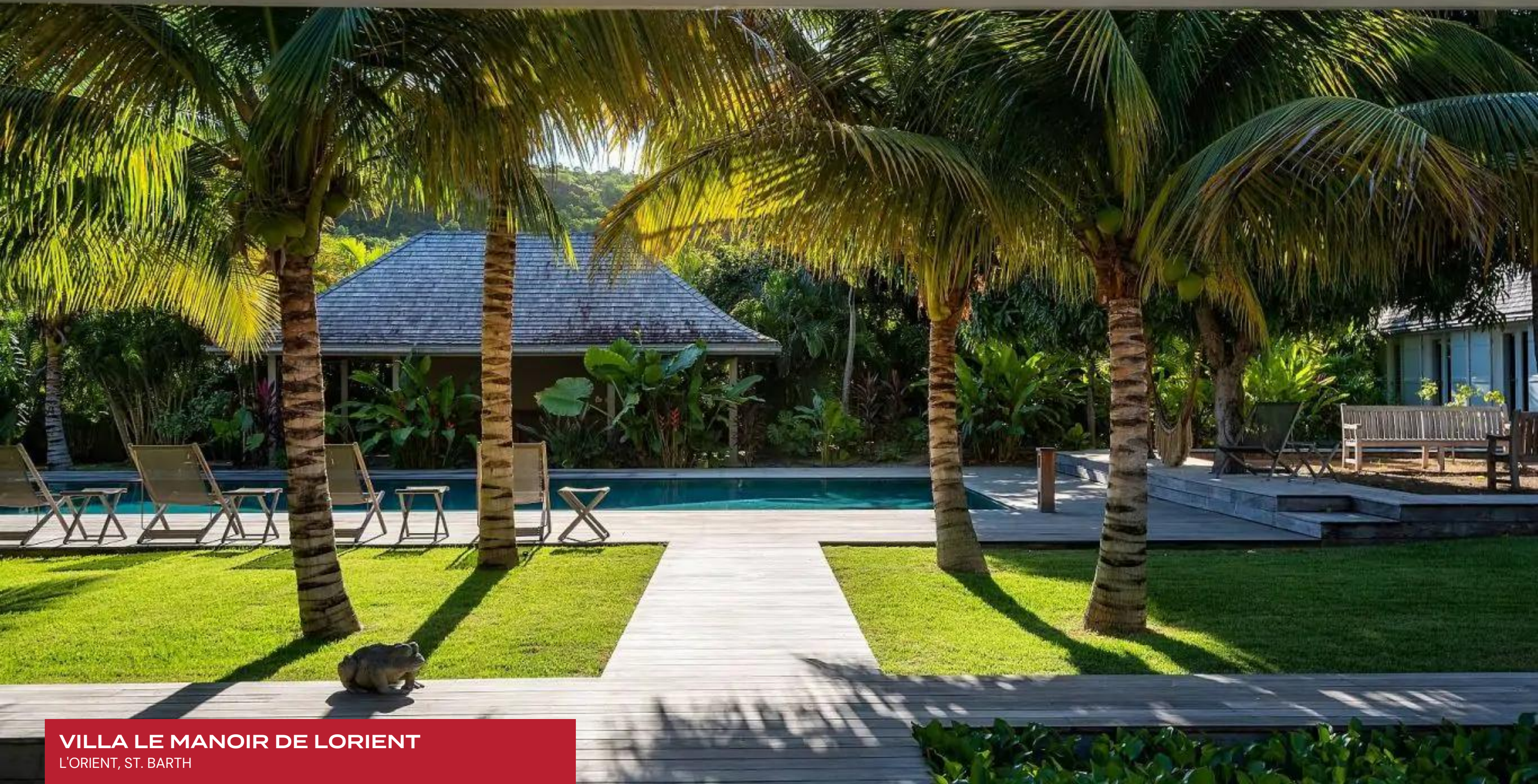
VILLA LE MANOIR DE LORIENT L'ORIENT, ST. BARTH