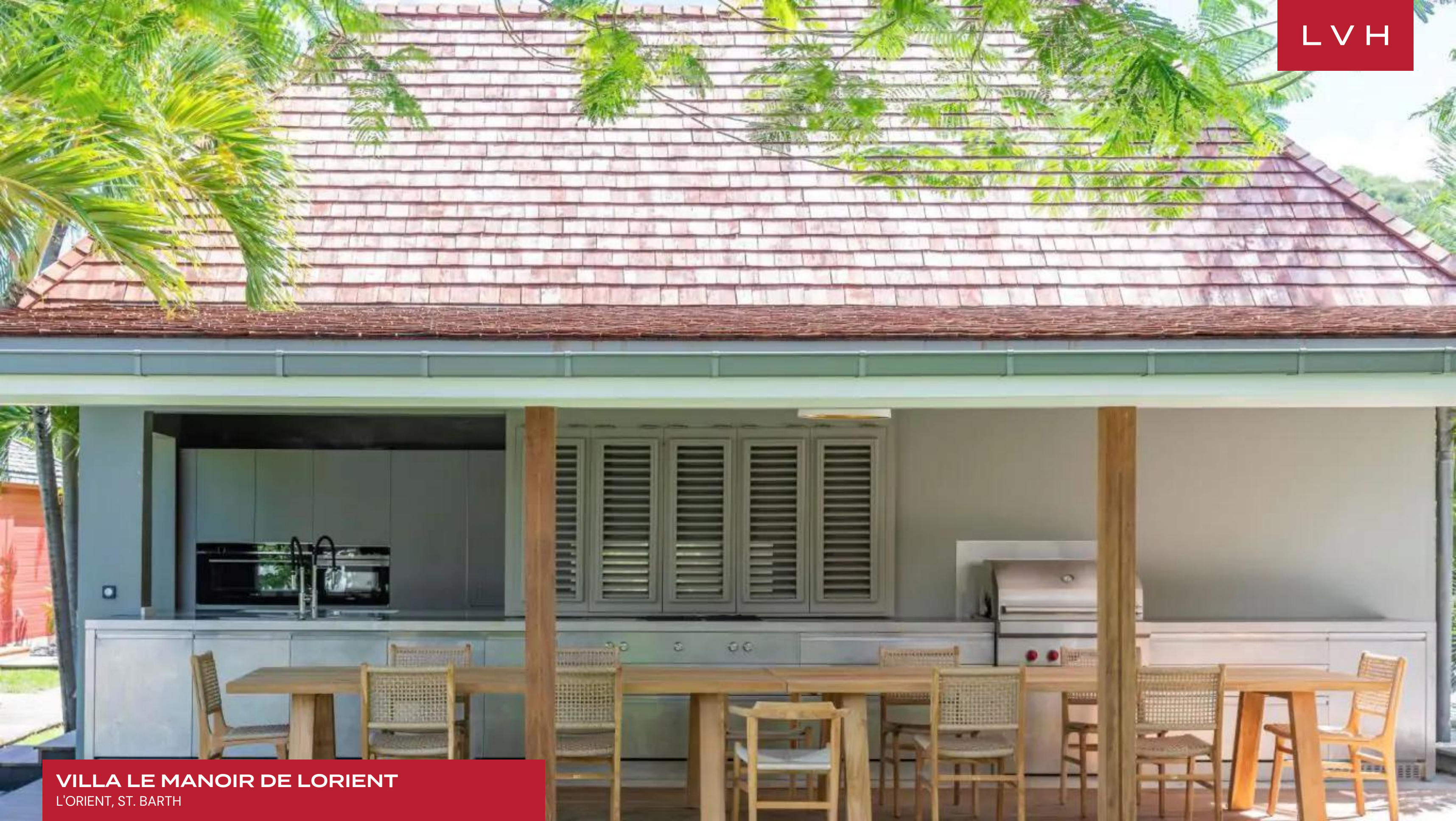
VILLA LE MANOIR DE LORIENT L'ORIENT, ST. BARTH