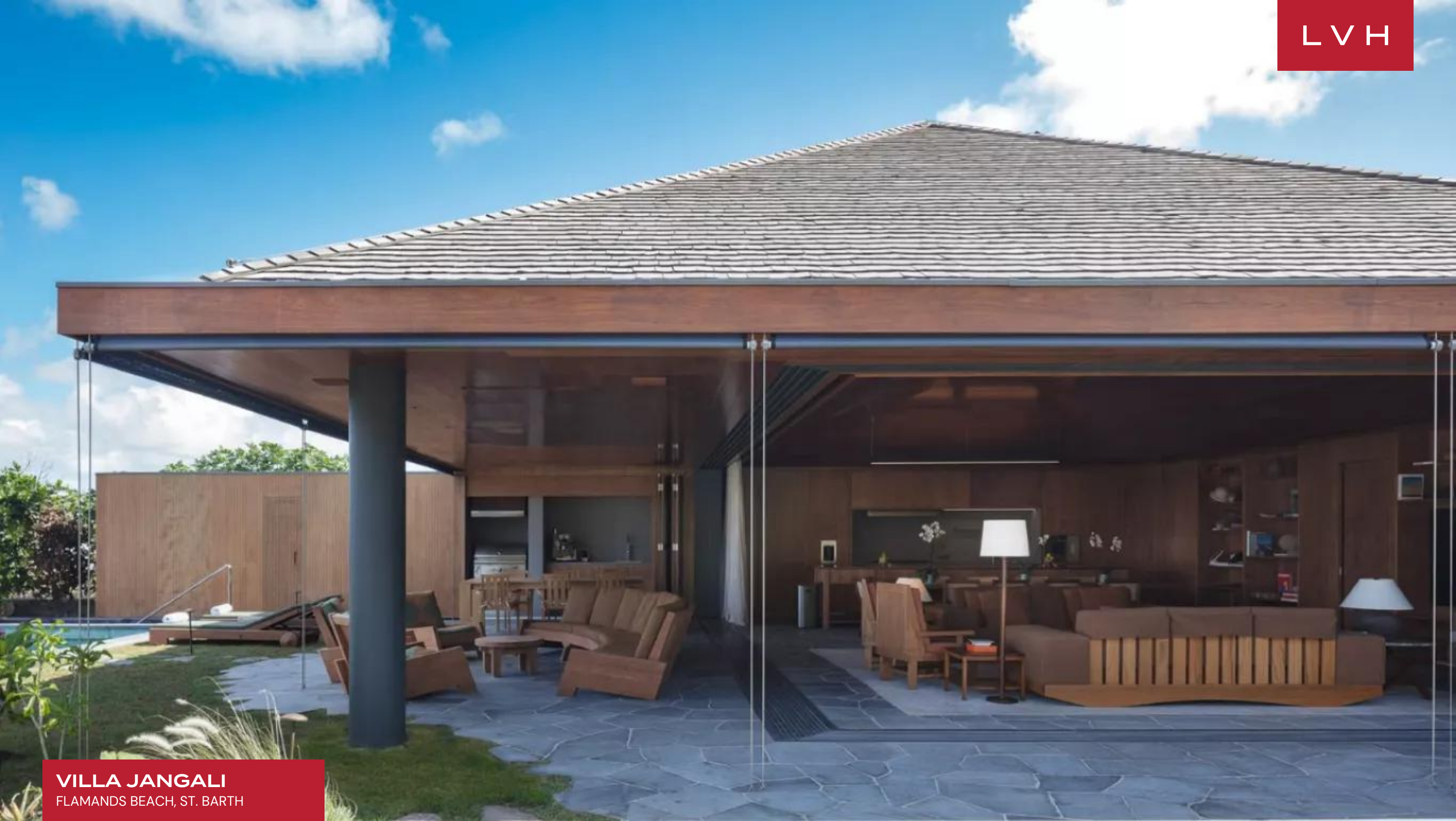
VILLA JANGALI FLAMANDS BEACH, ST. BARTH