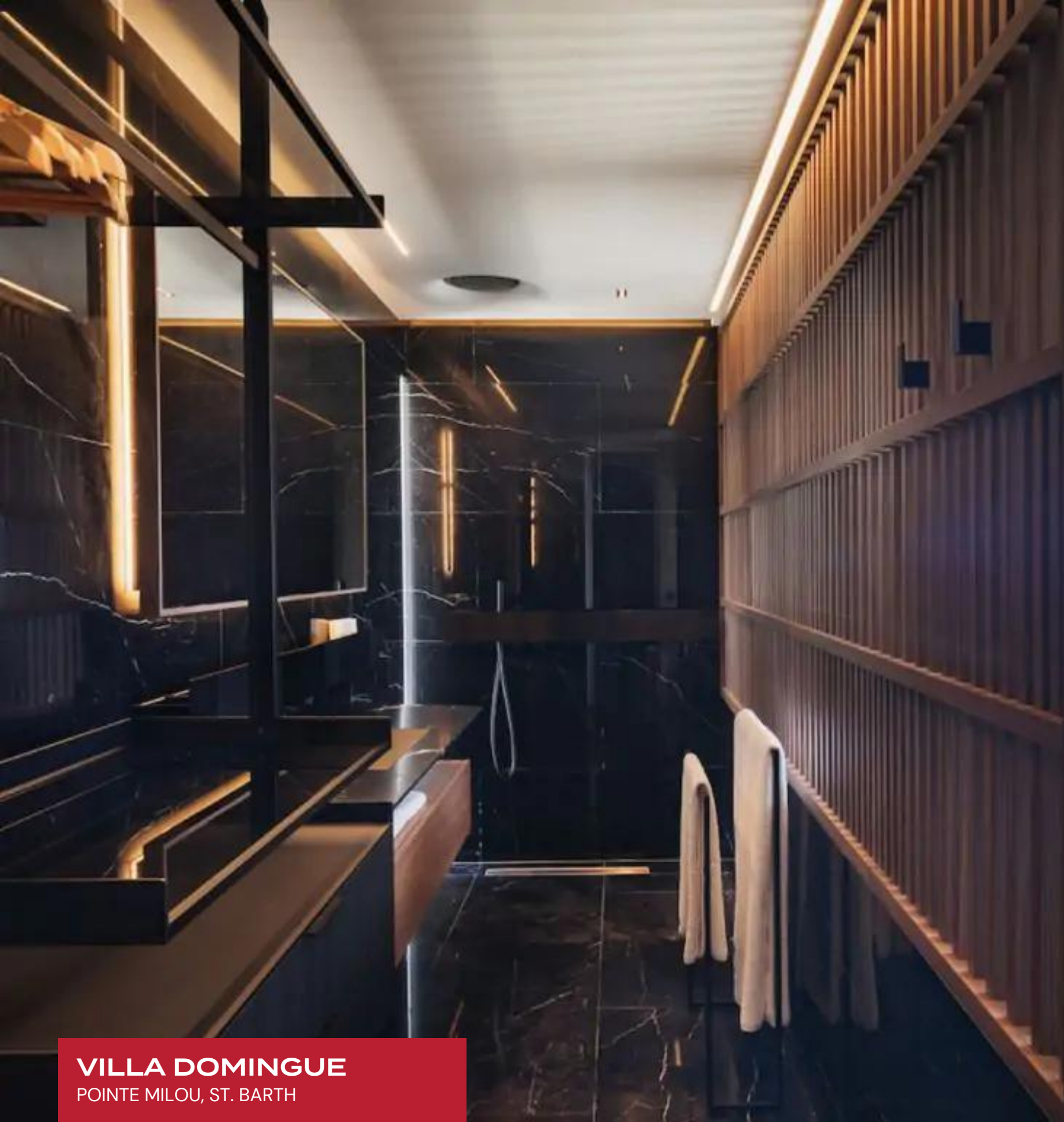
VILLA DOMINGUE POINTE MILOU, ST. BARTH