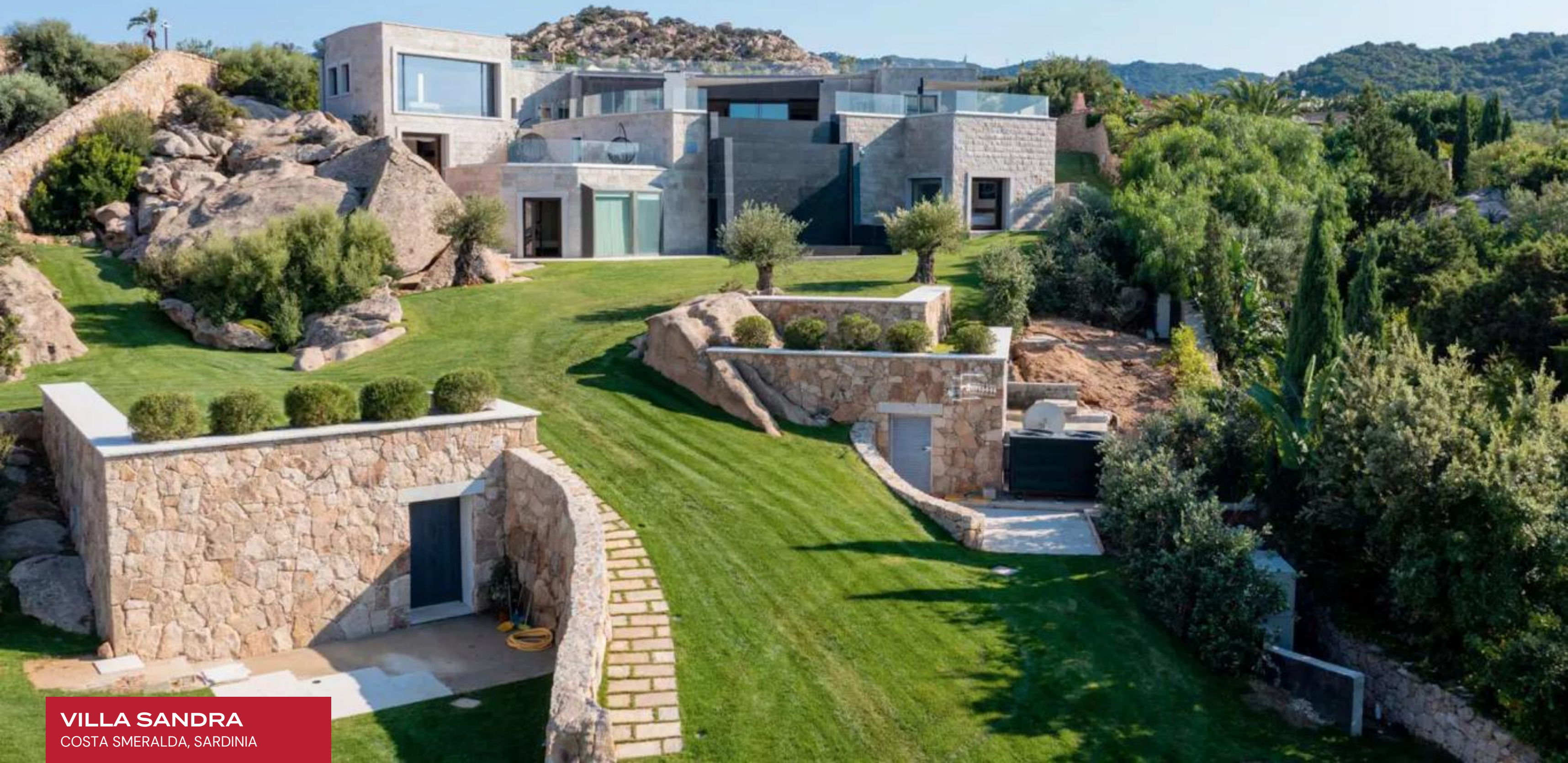
VILLA SANDRA COSTA SMERALDA, SARDINIA