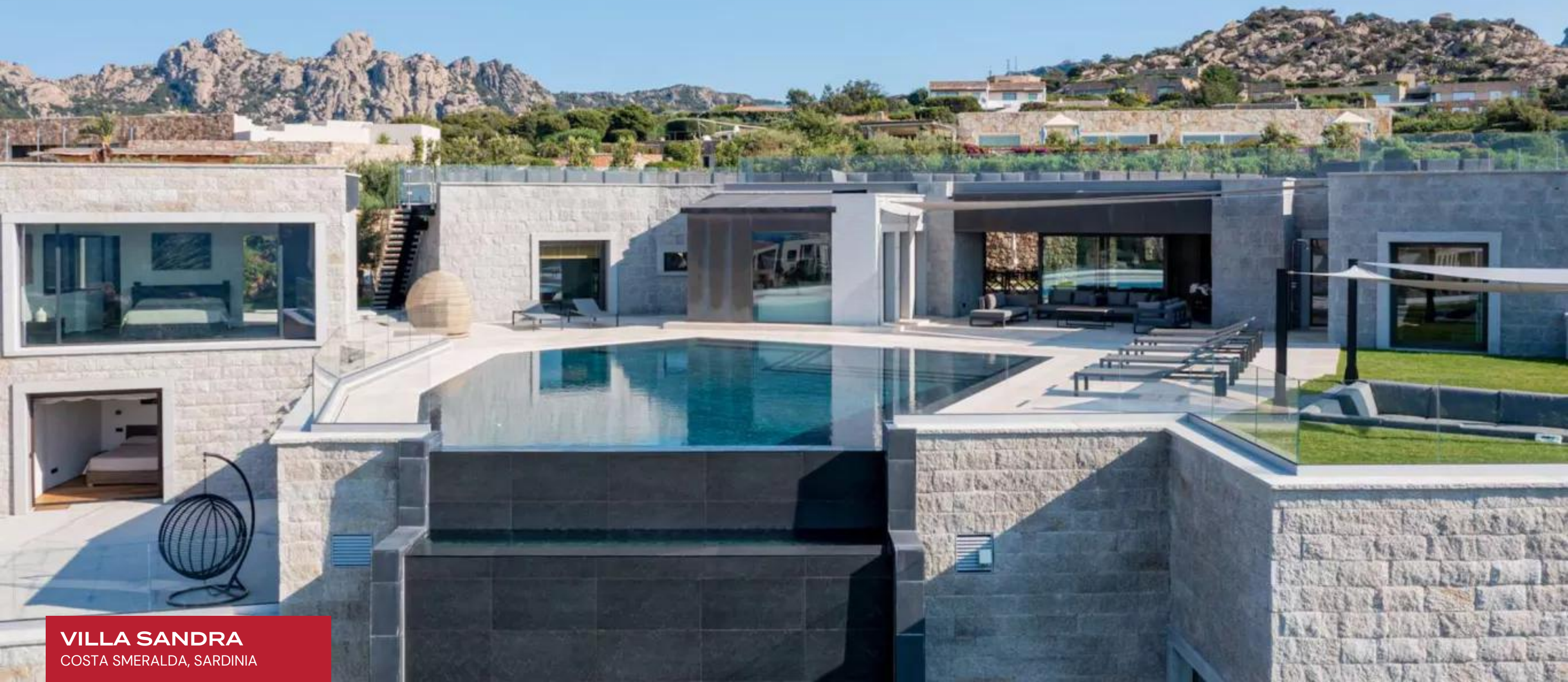
VILLA SANDRA COSTA SMERALDA, SARDINIA