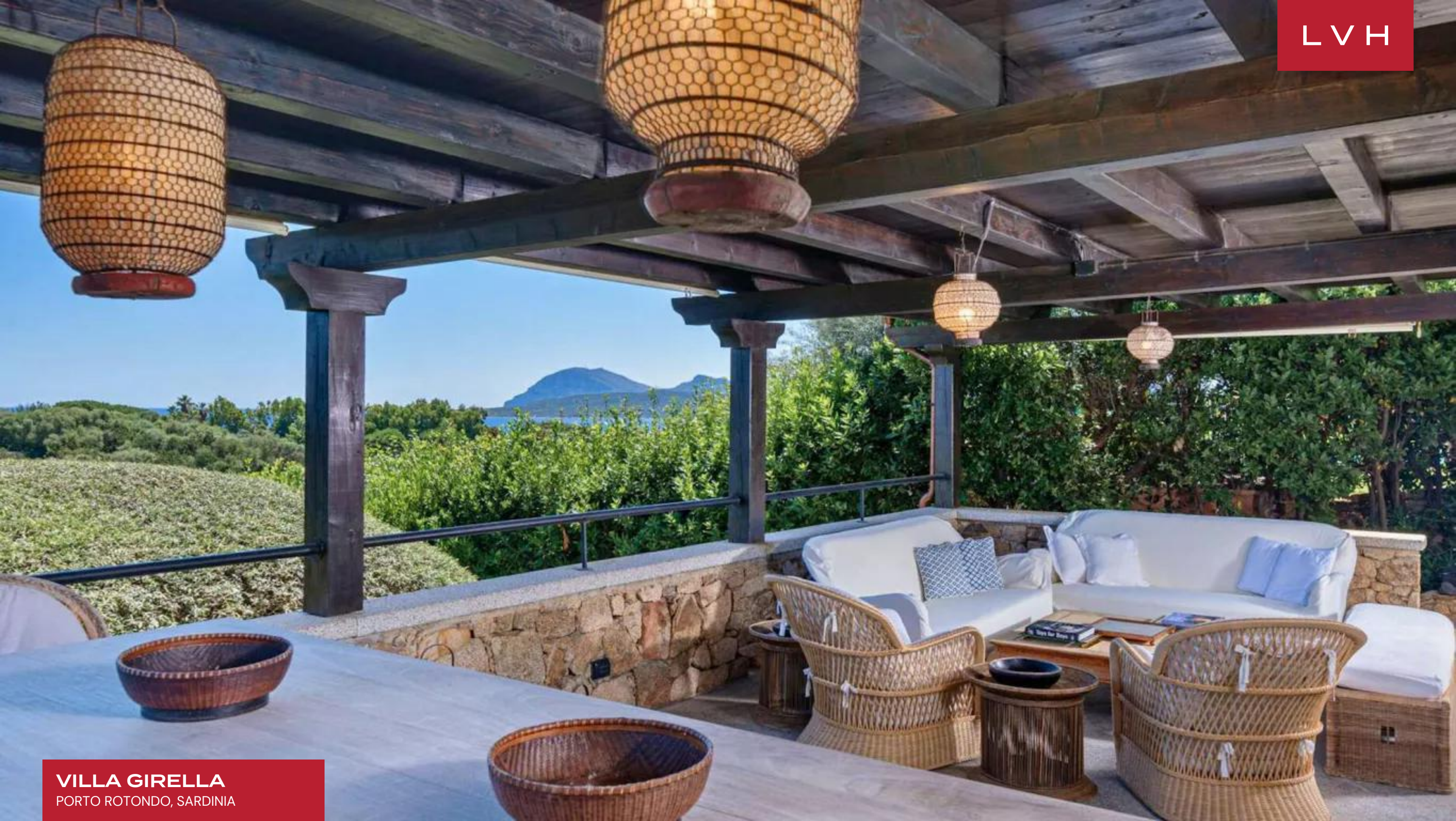
VILLA GIRELLA PORTO ROTONDO, SARDINIA