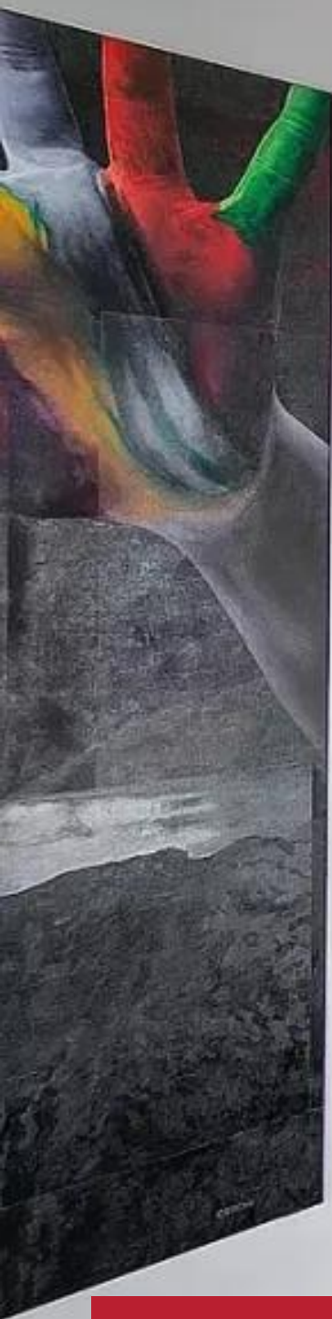
VILLA CHERYL MONTECITO, SANTA BARBARA