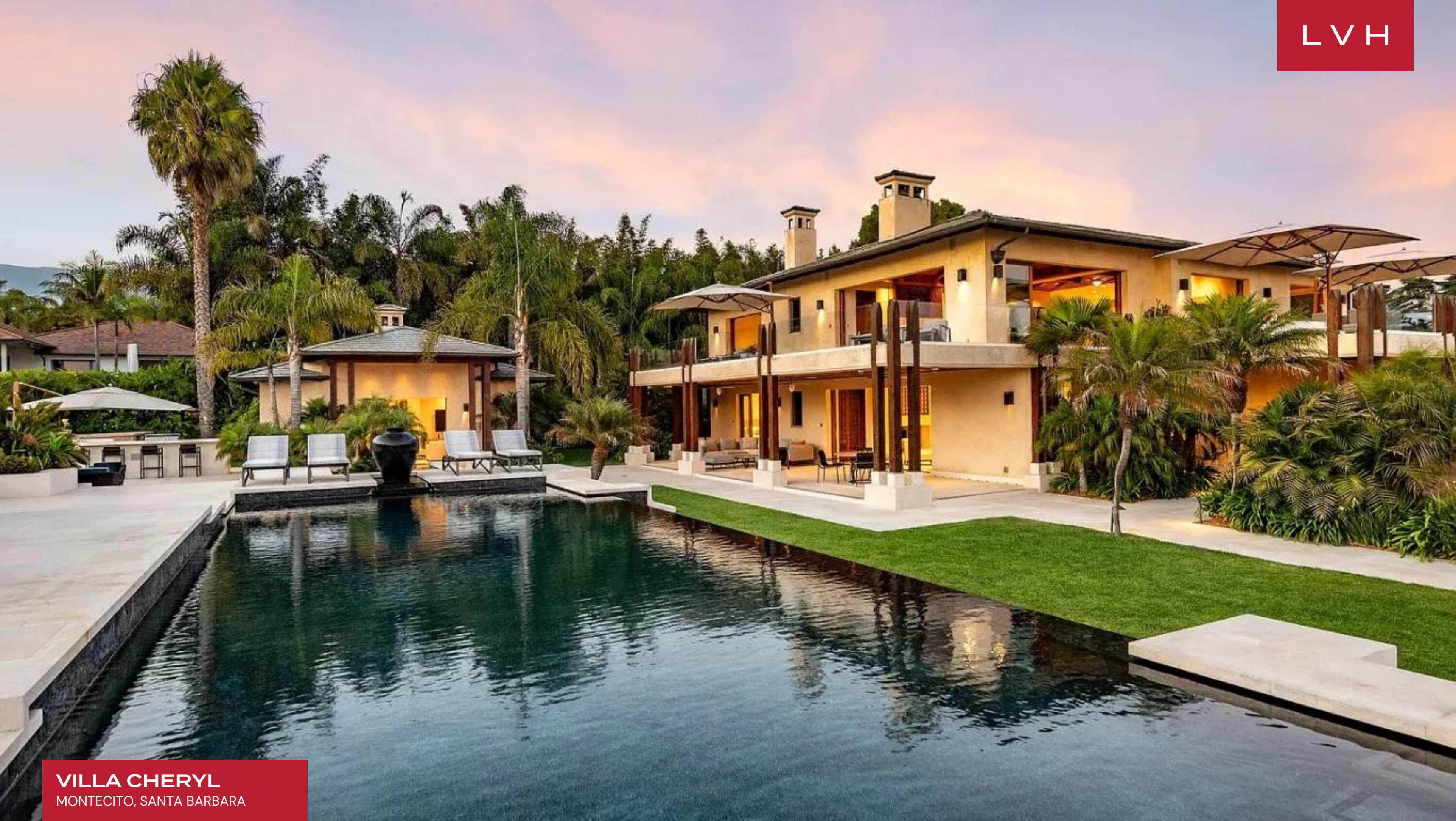
VILLA CHERYL MONTECITO, SANTA BARBARA