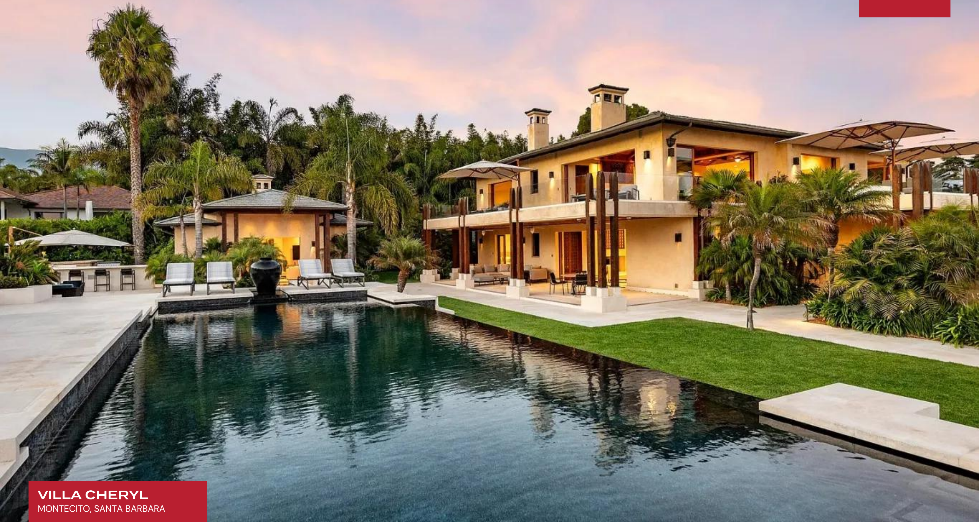
VILLA CHERYL MONTECITO, SANTA BARBARA