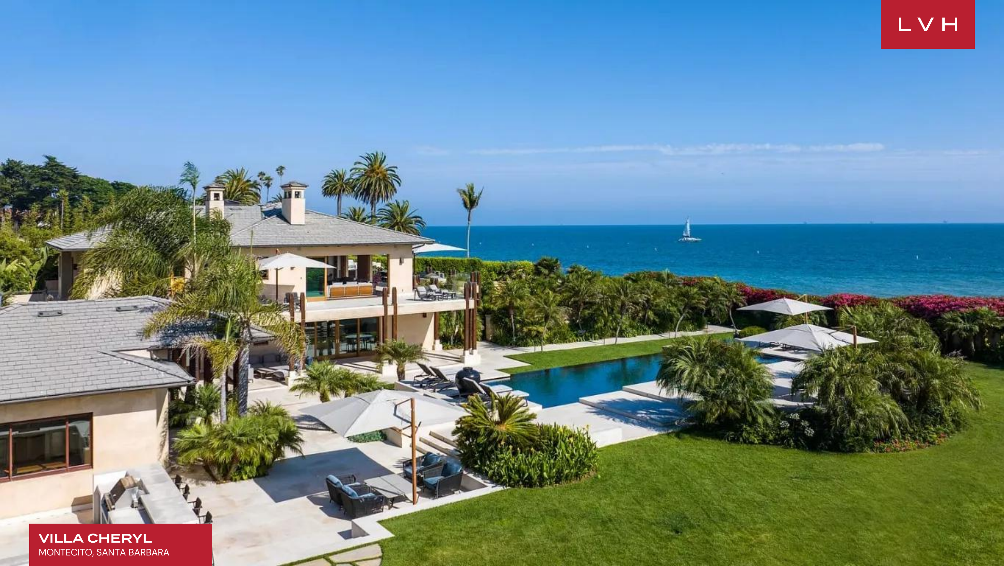
VILLA CHERYL MONTECITO, SANTA BARBARA