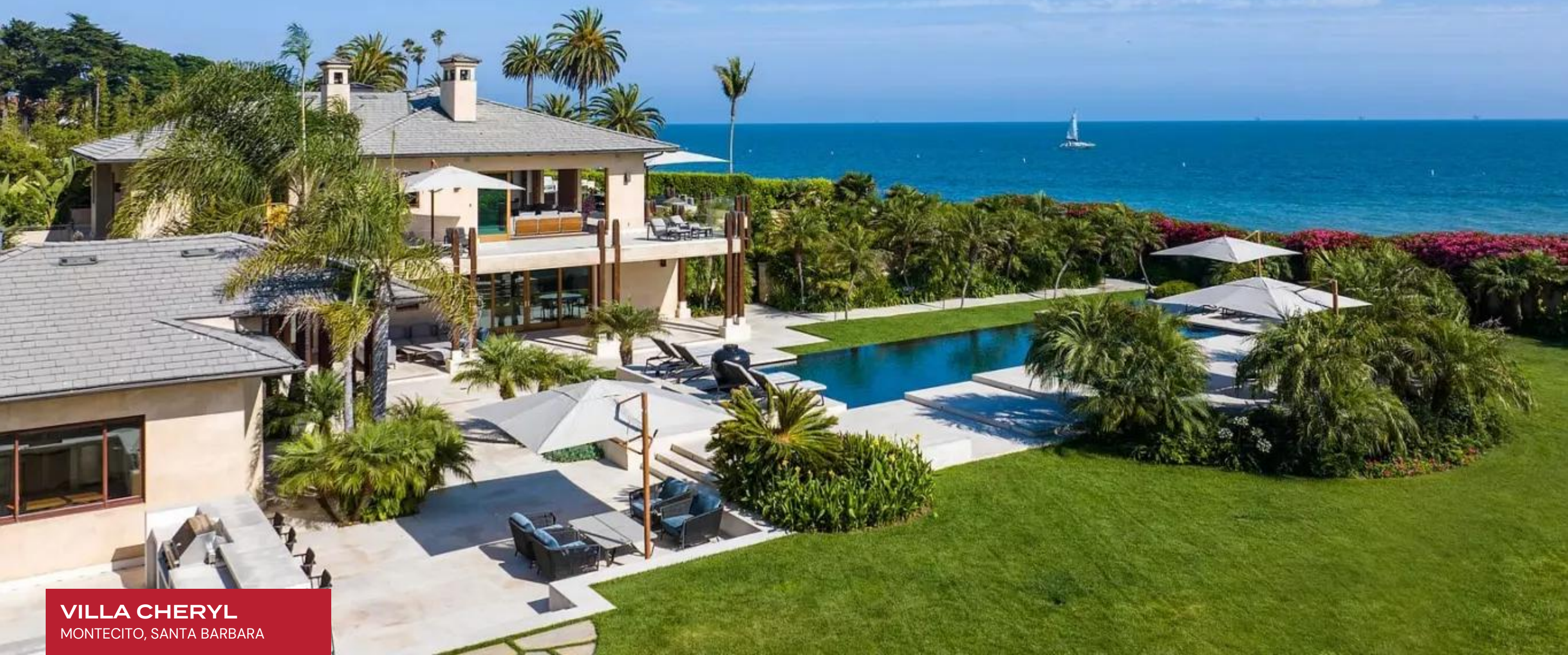
VILLA CHERYL MONTECITO, SANTA BARBARA