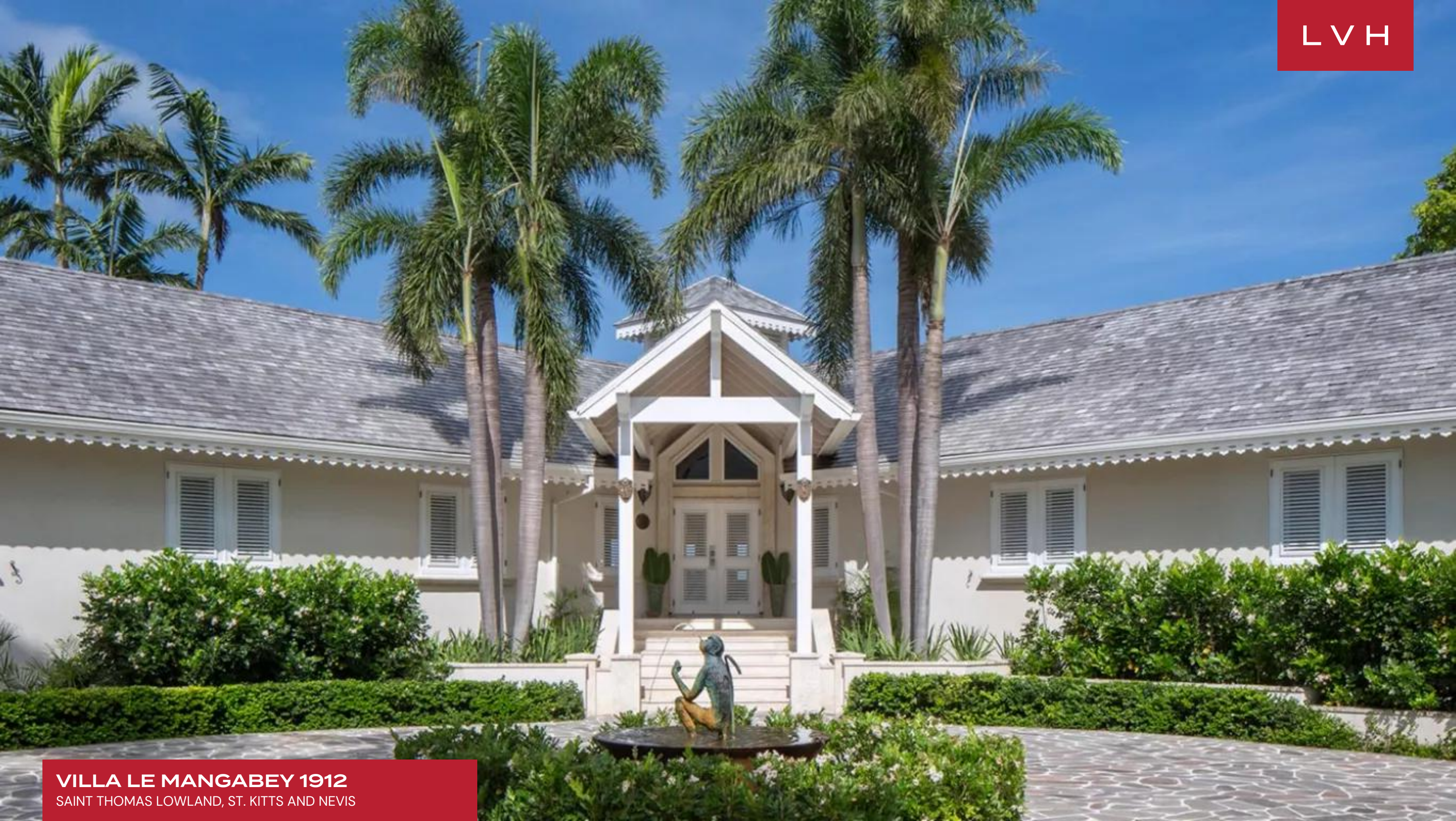
VILLA LE MANGABEY 1912 SAINT THOMAS LOWLAND, ST. KITTS AND NEVIS