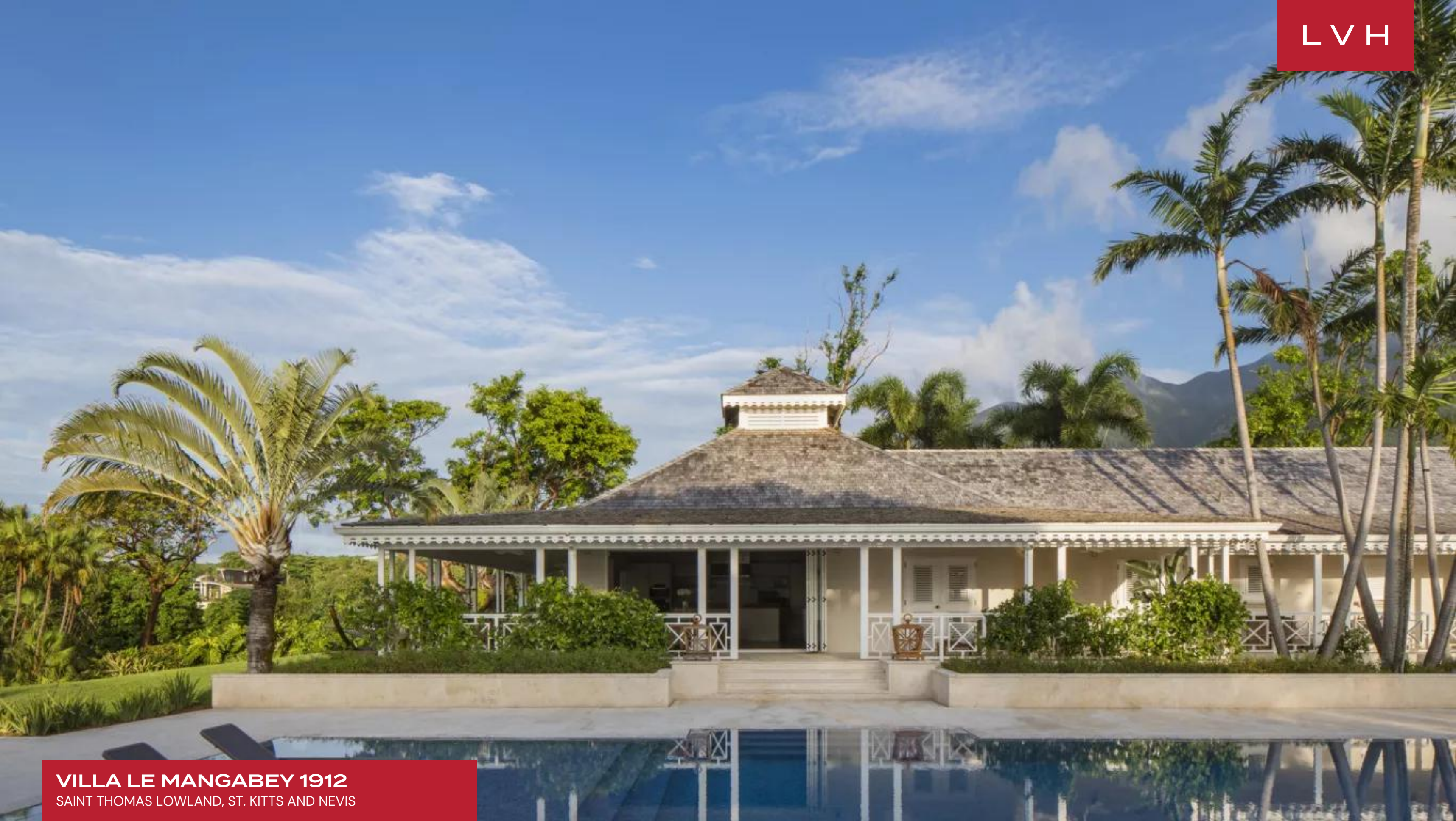
VILLA LE MANGABEY 1912 SAINT THOMAS LOWLAND, ST. KITTS AND NEVIS