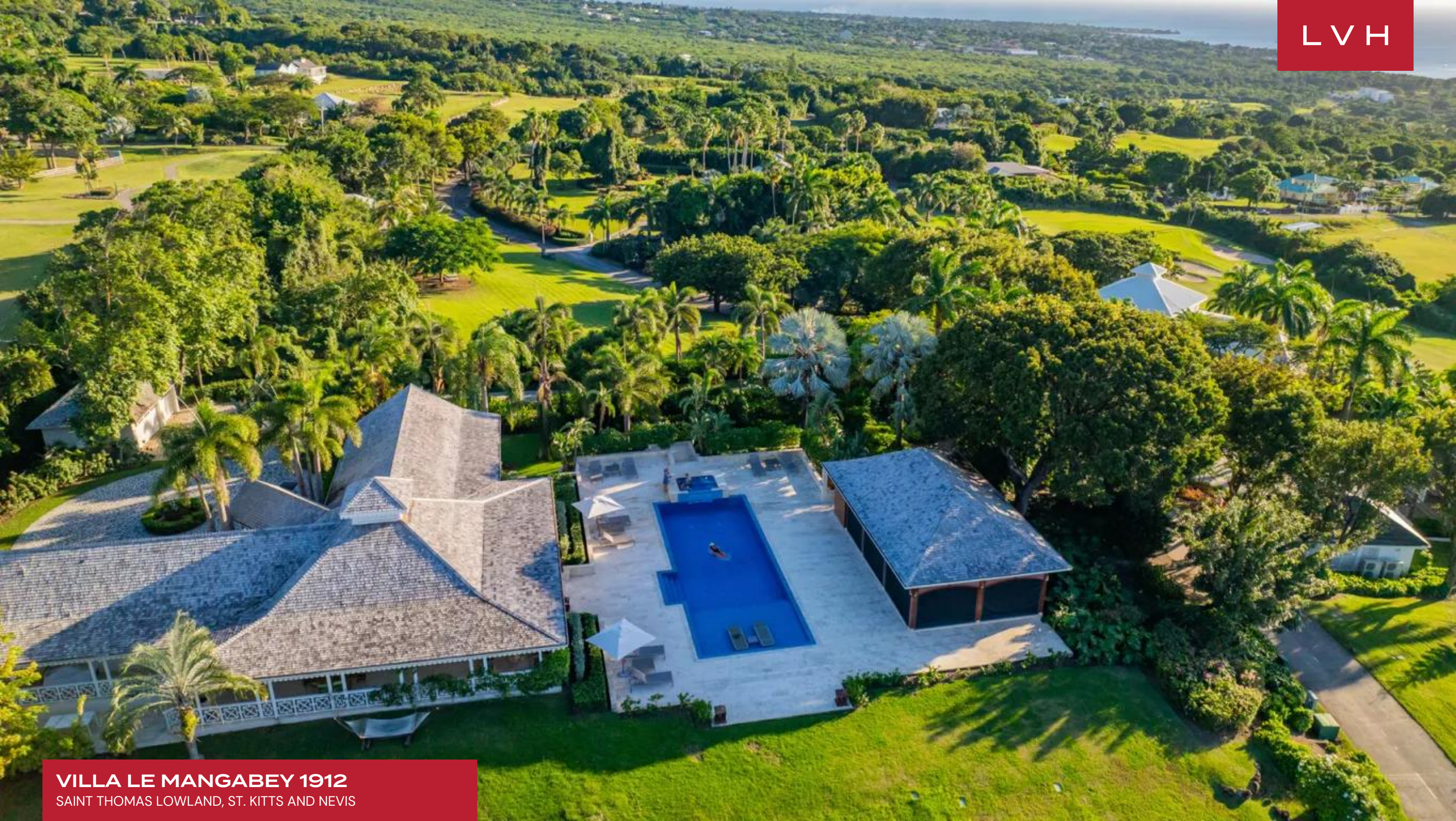
VILLA LE MANGABEY 1912 SAINT THOMAS LOWLAND, ST. KITTS AND NEVIS