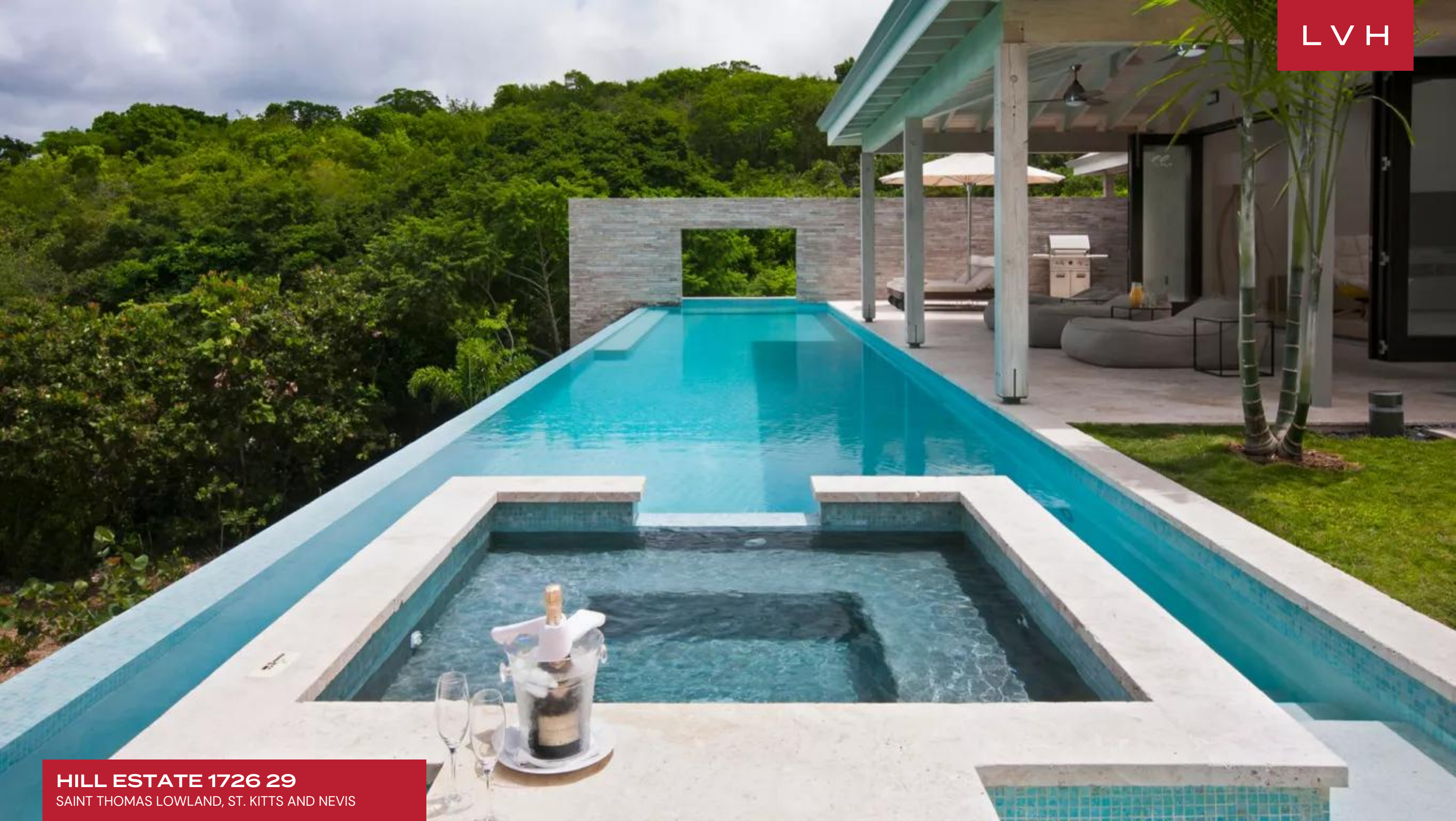
HILL ESTATE 1726 29 SAINT THOMAS LOWLAND, ST. KITTS AND NEVIS